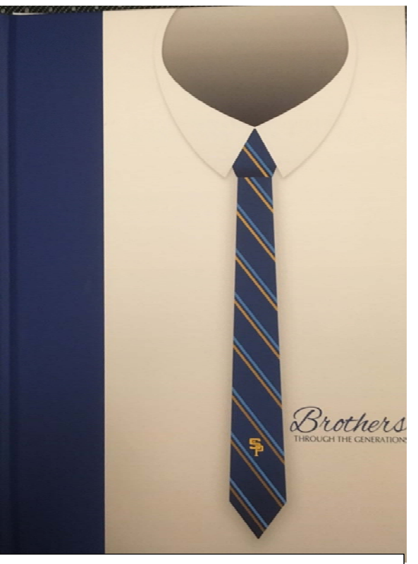
2019 Yearbook (The Conifer). Order this year's before Mar 14's price increase.