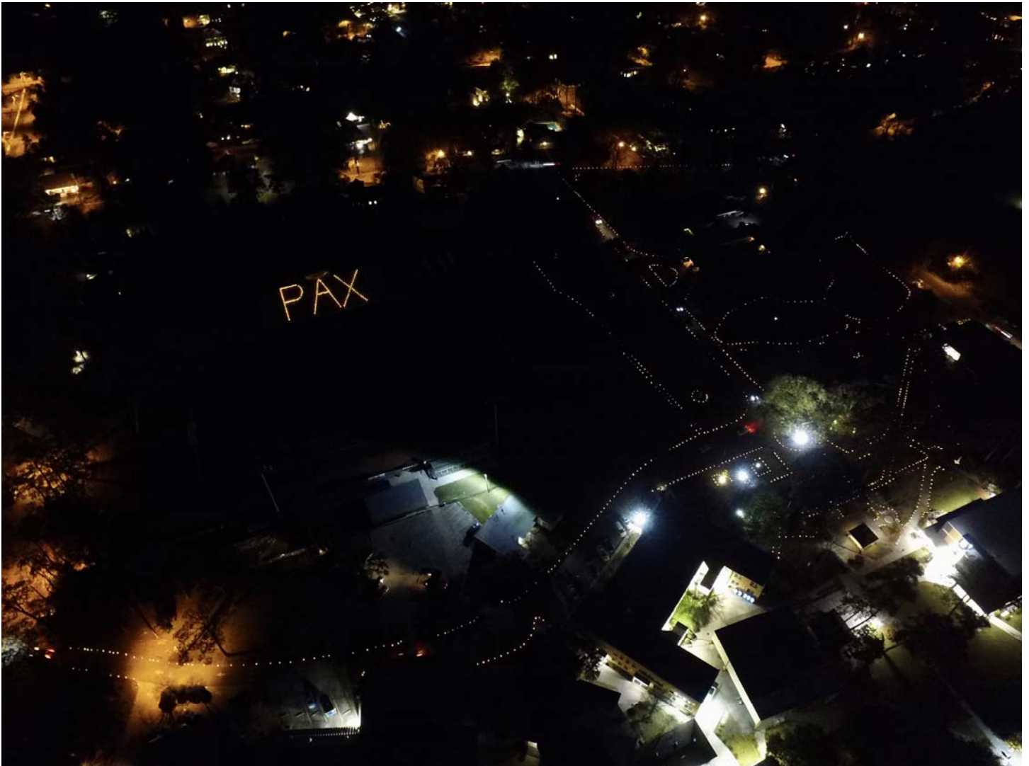
A drone's eye view of the campus on luminaria night!

Have a blessed Christmas season! Thank you for the First Semester! Maranatha!