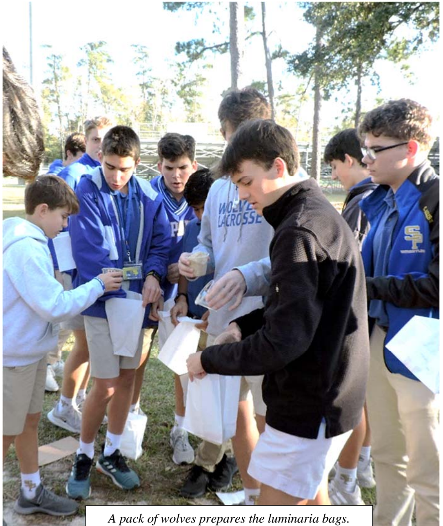
A pack of wolves prepares the luminaria bags.