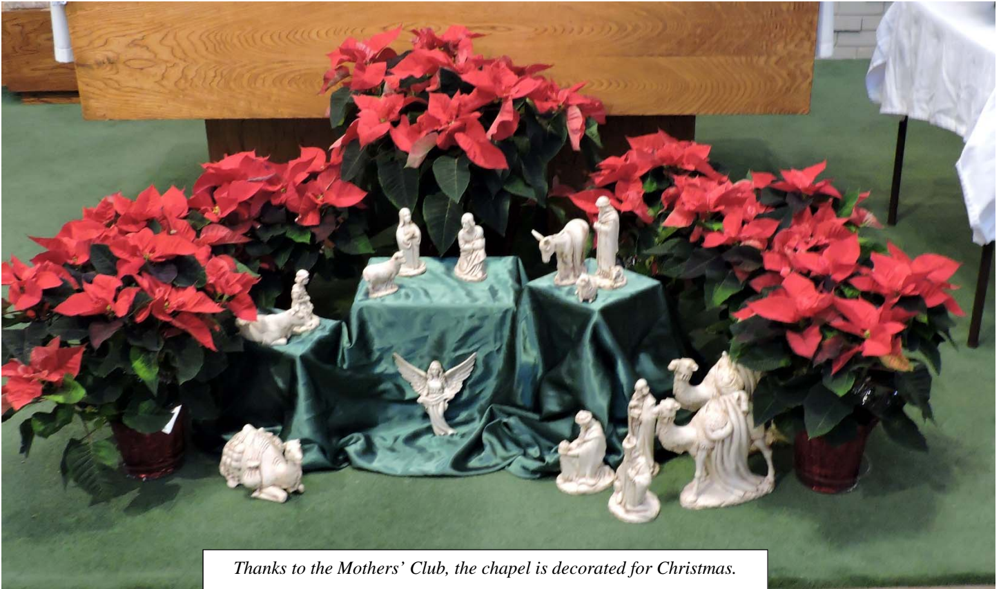
Thanks to the Mothers' Club, the chapel is decorated for Christmas.