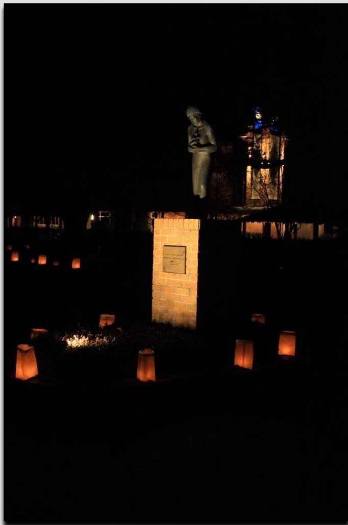
The Sacred Heart of Jesus is surrounded with luminaries while the Benilde tower shines brightly in the background.