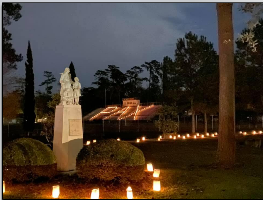
“PAX”, Latin for the sign of Peace, is lighted with luminary bags in Hunter Stadium.