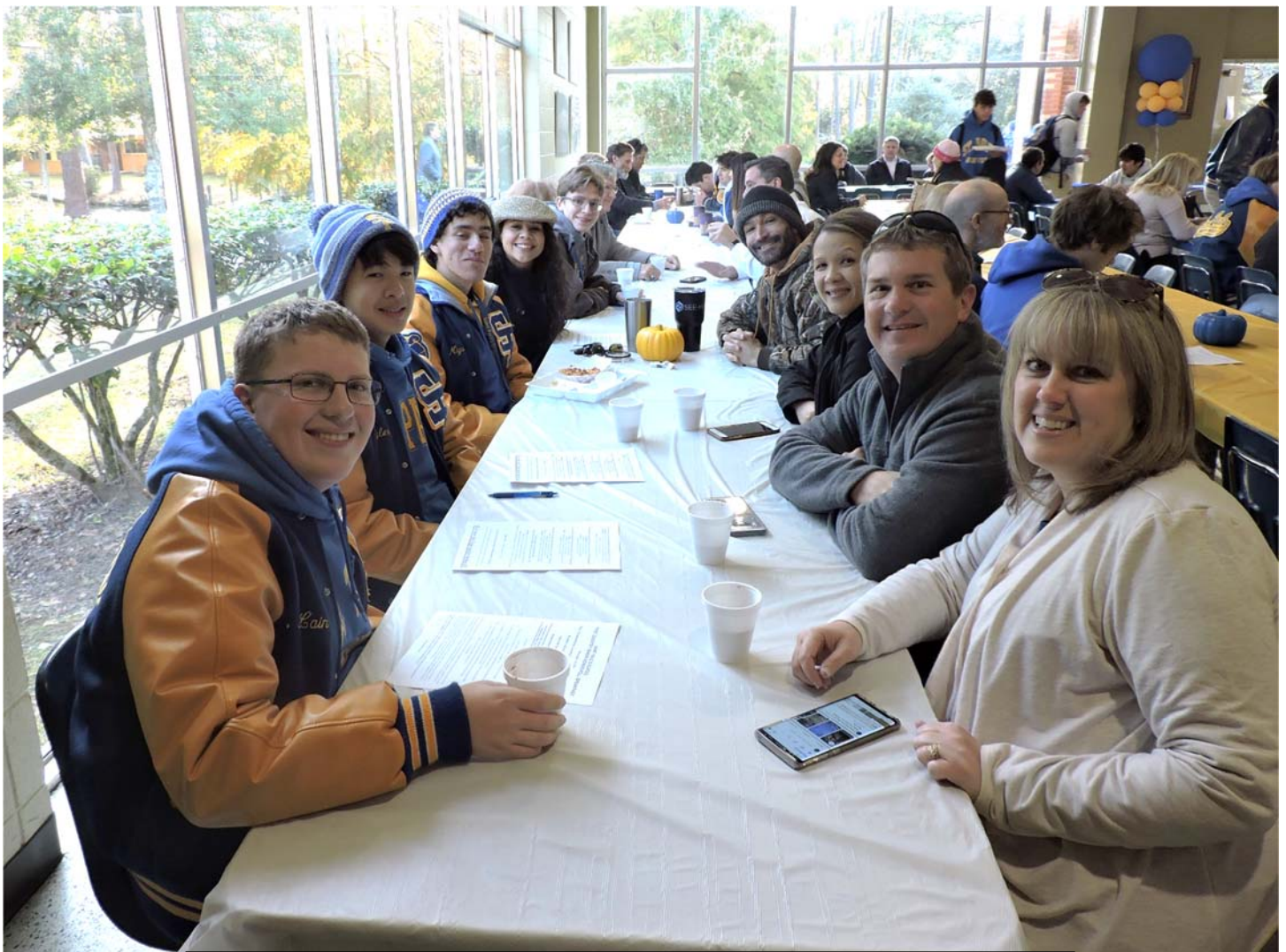
Seniors and their parents await start of HR Breakfast on a very cold Wed morning!