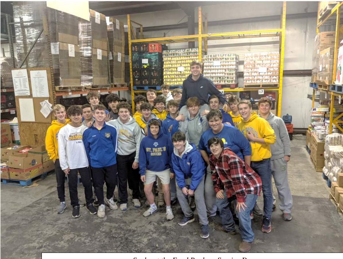
Sophs at the Food Bank on Service Day