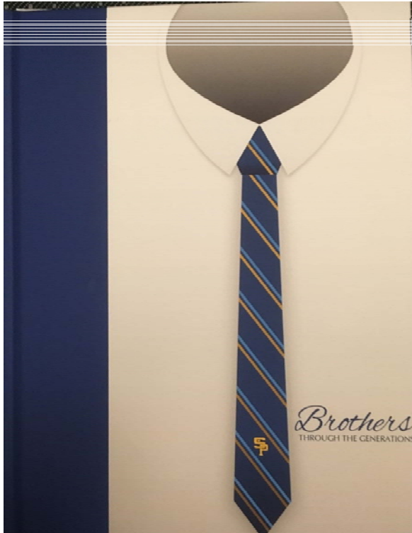
2019 Yearbook (The Conifer). Order this year's before Oct 12's price increase.