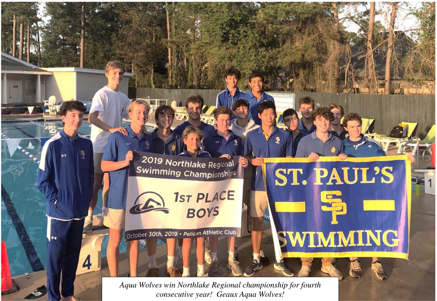
Aqua Wolves win Northlake Regional championship for fourth consecutive year! Geaux Aqua Wolves!

WEEKLY HUMOR: in honor of Thanksgiving, here are my annual Thanksgiving jokes: