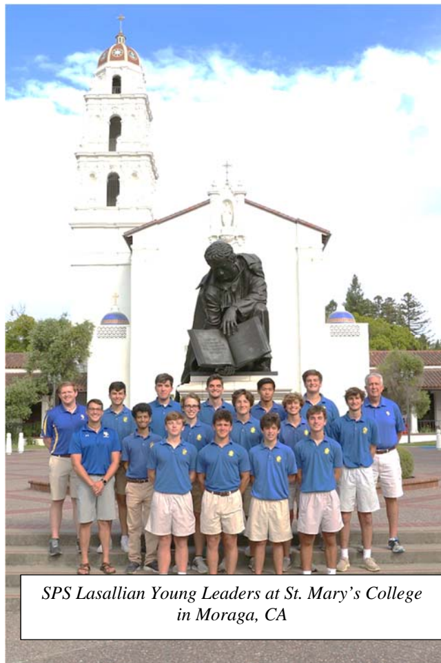
SPS Lasallian Young Leaders at St. Mary's College in Moraga, CA