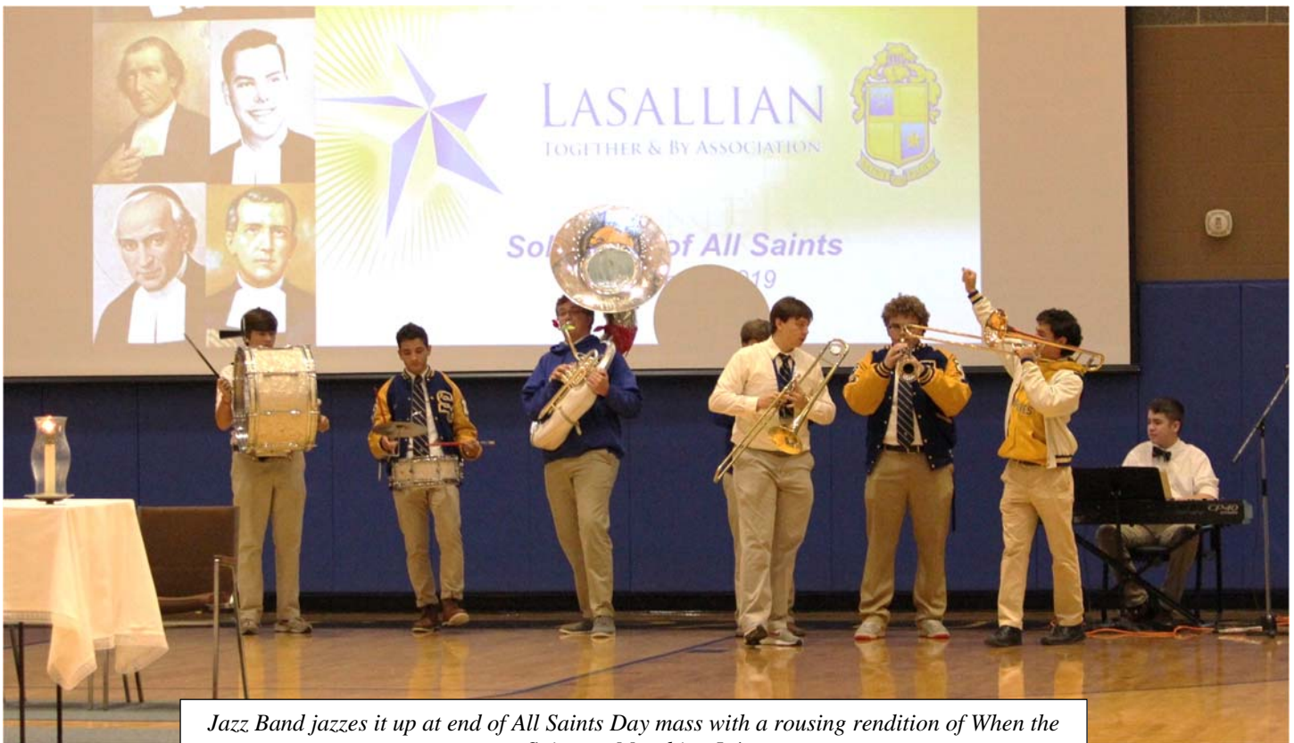
Jazz Band jazzes it up at end of All Saints Day mass with a rousing rendition of When the Saints to Marching In!

“Preach by example; practice before the eyes of the young what you wish them to accept.” (SJB DLS)