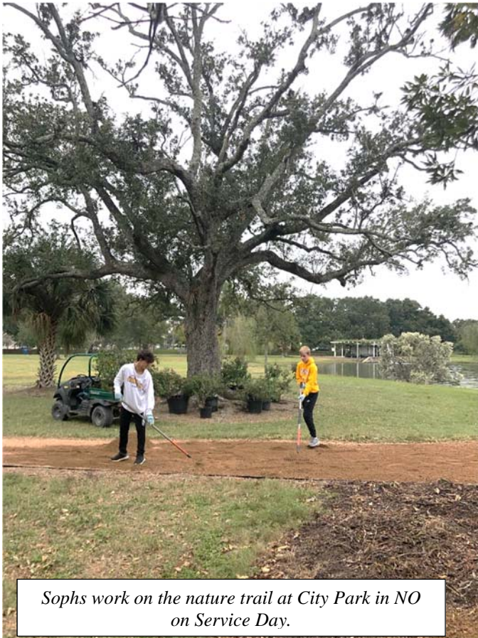
Sophs work on the nature trail at City Park in NO on Service Day.

digital newspaper! Compliment the outstanding staff. Subscribe! Support the future of journalism! Geaux Paper Wolves!