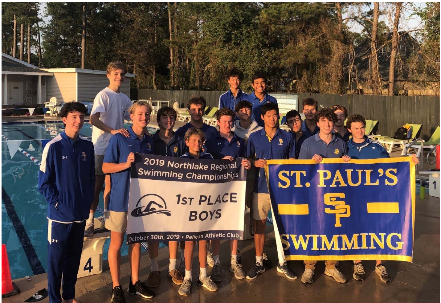
A fourpeat – Geaux Aqua Wolves!