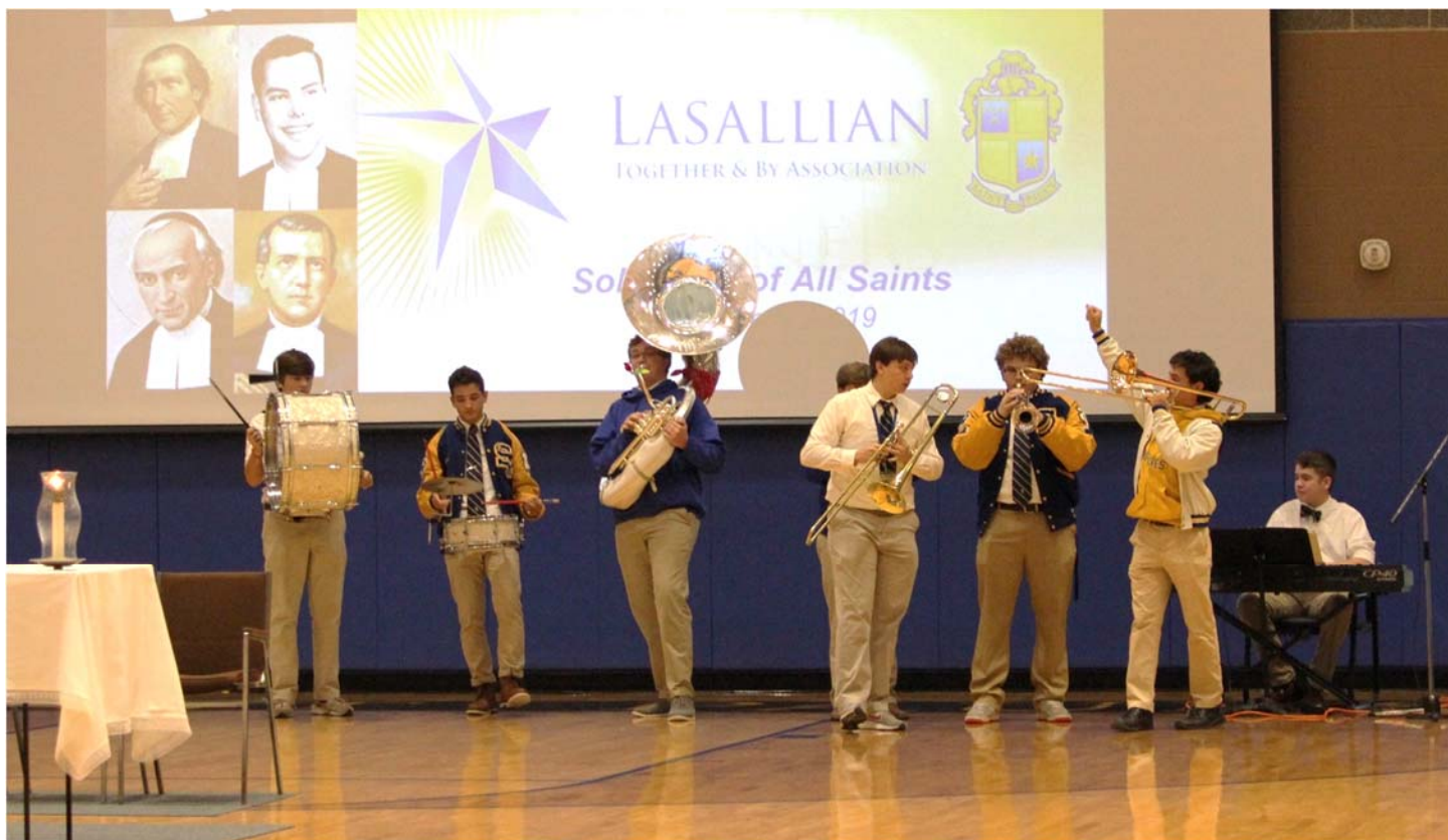
Jazz Band jazzes it up at end of All Saints Day mass with a rousing rendition of When the Saints to Marching In!