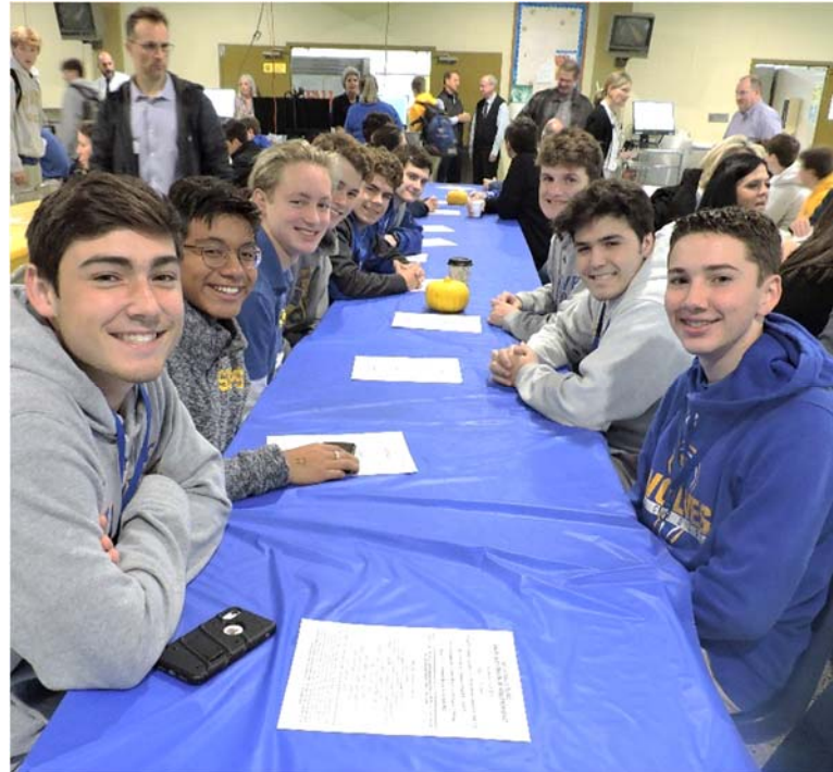
Juniors, hungry for both vocabulary and Chick-fil-A, await start of HR breakfast!