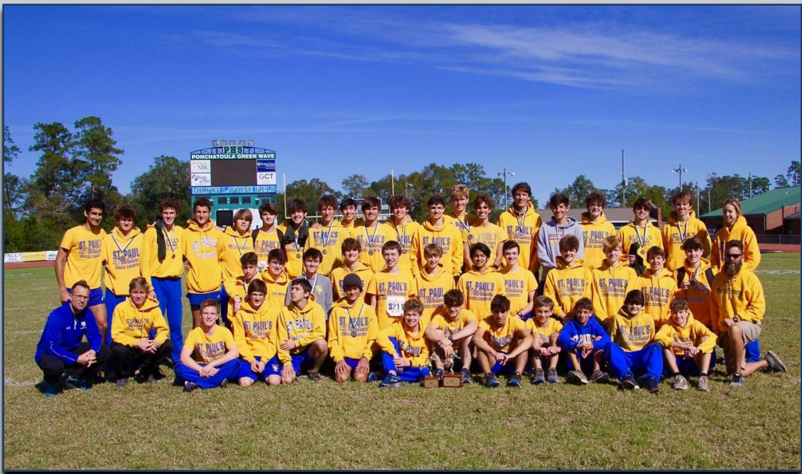
Pictured above are the first place District winners.