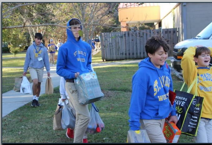
Students happily load waiting pickup trucks with bags of food.

This year, the Northshore community has organized another event to help the food bank, The Battle for the Bank. The Battle for the Bank was a basketball tournament on November 16 between schools in and around Covington, including: Covington High School, Saint Paul's School, Northlake Christian, and Archbishop Hannan High School. The cost of admission to this event is two nonperishable food items for the food bank. This event will increase the contributions to the food bank from the local community.