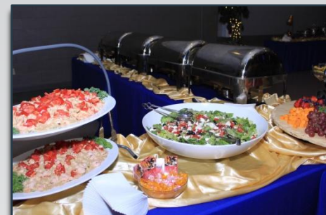
Food was plentiful for our guests.