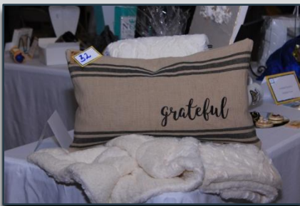
Even the auction items express our thanks!