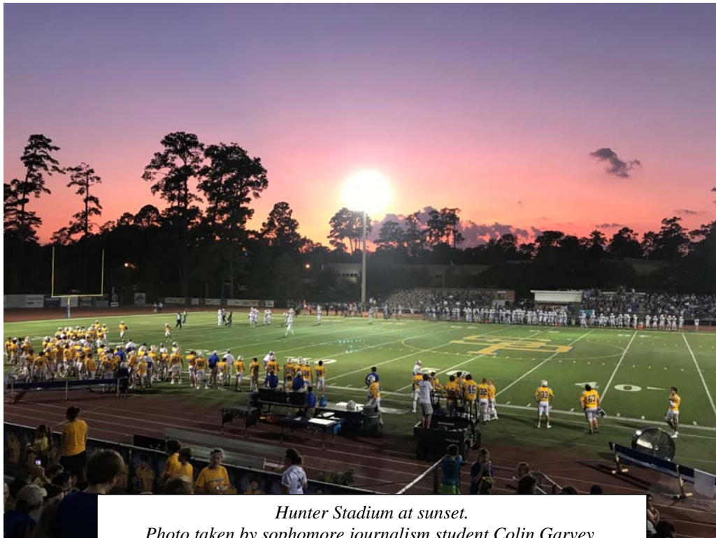
Hunter Stadium at sunset.