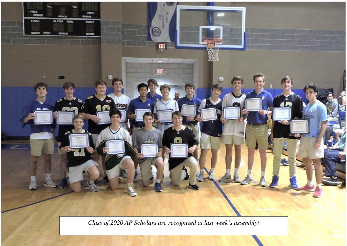
Class of 2020 AP Scholars are recognized at last week's assembly!

EMERGENCY CLOSINGS: As we pass the height of the tropical season (Sep 10) and with safety foremost in our minds, I remind all of the directives from the Office of Catholic Schools of the Archdiocese of NO: