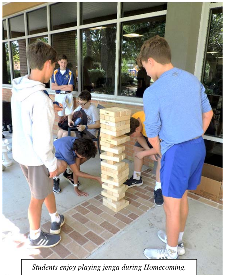
Students enjoy playing jenga during Homecoming.