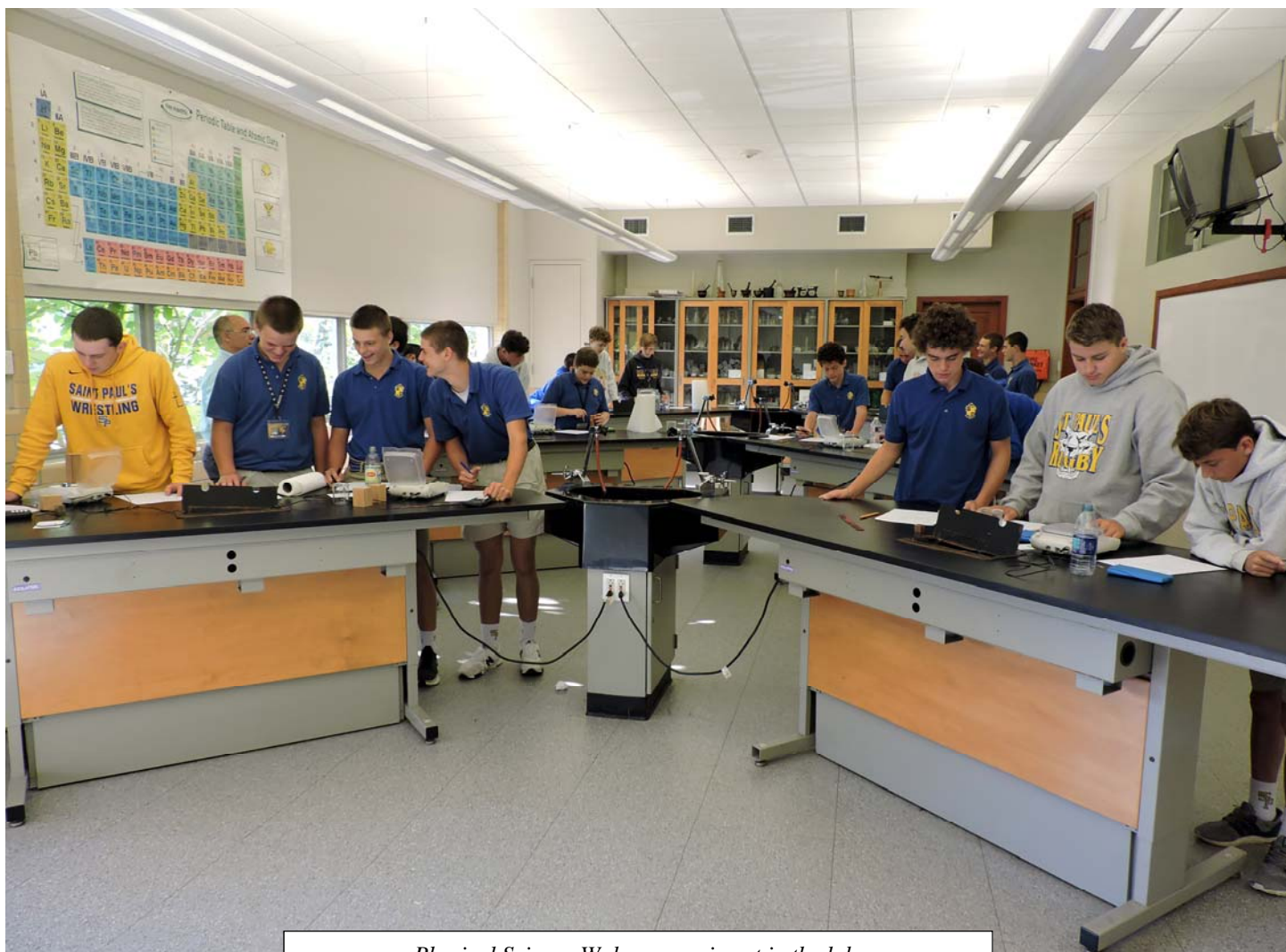
Physical Science Wolves experiment in the lab.

FATHER-SON BIBLE STUDY: Several fathers and sons conduct Bible Study every other Tuesday morning at 7 am in the admin building conference room. All are welcome. If size outgrows space, we will re-locate to another part of campus. First session is Tuesday, September 17 at 7 am.