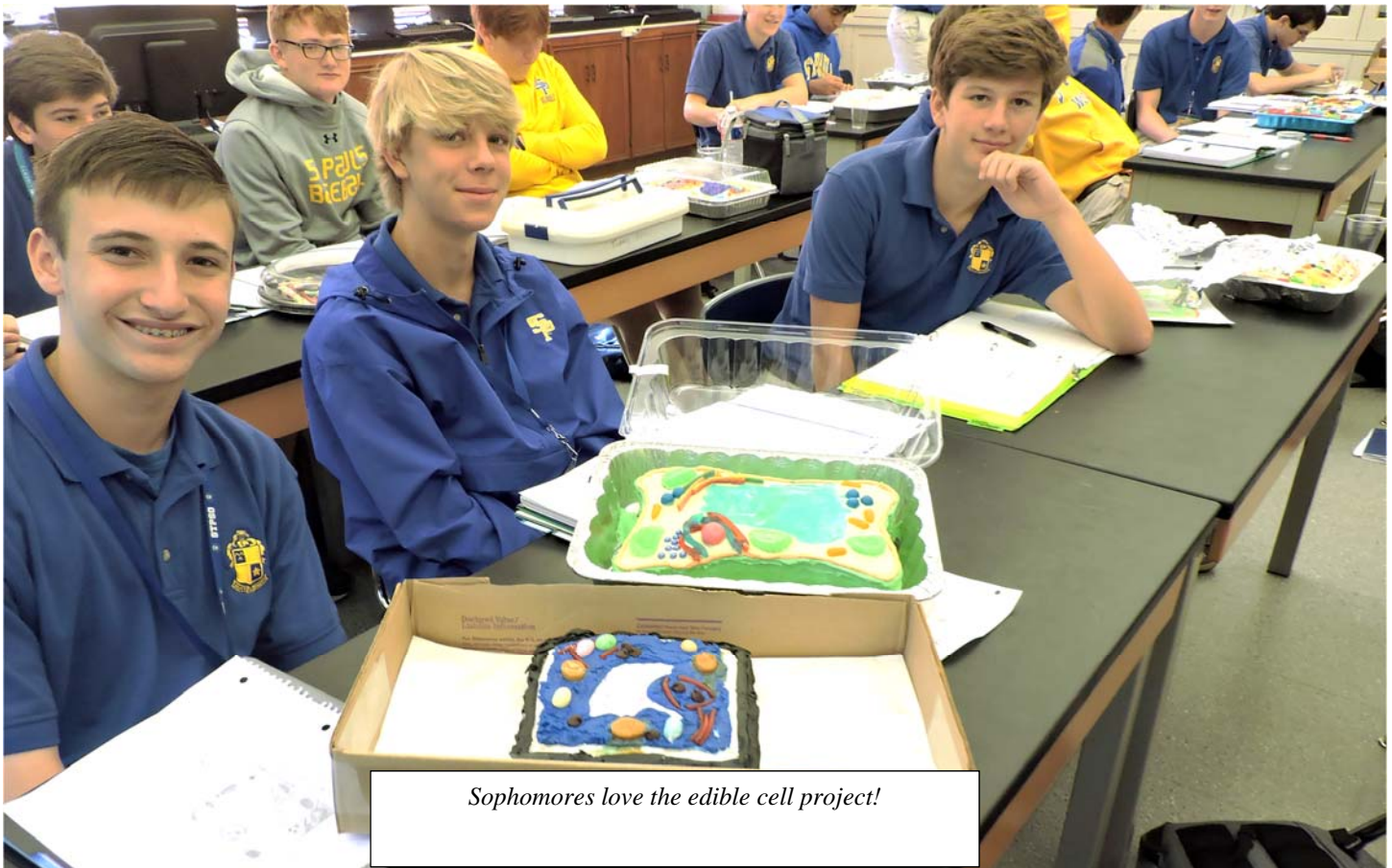
Sophomores love the edible cell project!