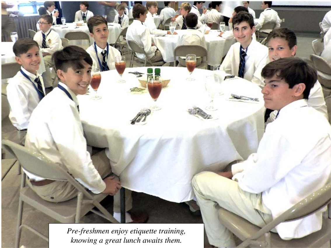
Pre-freshmen enjoy etiquette training, knowing a great lunch awaits them.

• TDIH: In 1814, Francis Scott Key pens words, later set to music, that in 1931 becomes USA's national anthem, "The Star-Spangled Banner." The poem, titled "The Defence of Fort McHenry," was written when Key saw Fort McHenry in MD bombarded by British in the War of 1812 & was inspired by a U.S. flag flying at dawn.