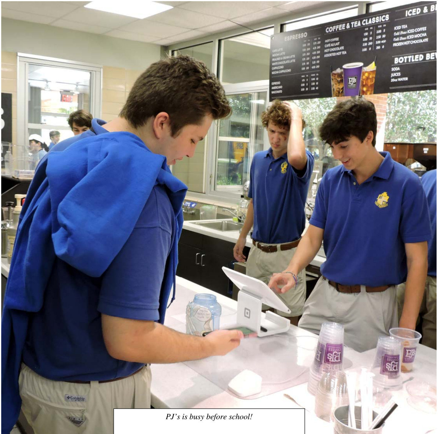
PJ's is busy before school!

HOMEWORK FAIR: The St. Tammany Parish Library will hold a special Back to School Homework Fair to help students discover what their library card can do for them. And it's free! Sep 10, 5:30 – 7:30 at Madisonville Branch and Sep 25,, 5:30-7:30 at the Slidell branch. For more information, check the online events calendar www.sttammanylibrary.org