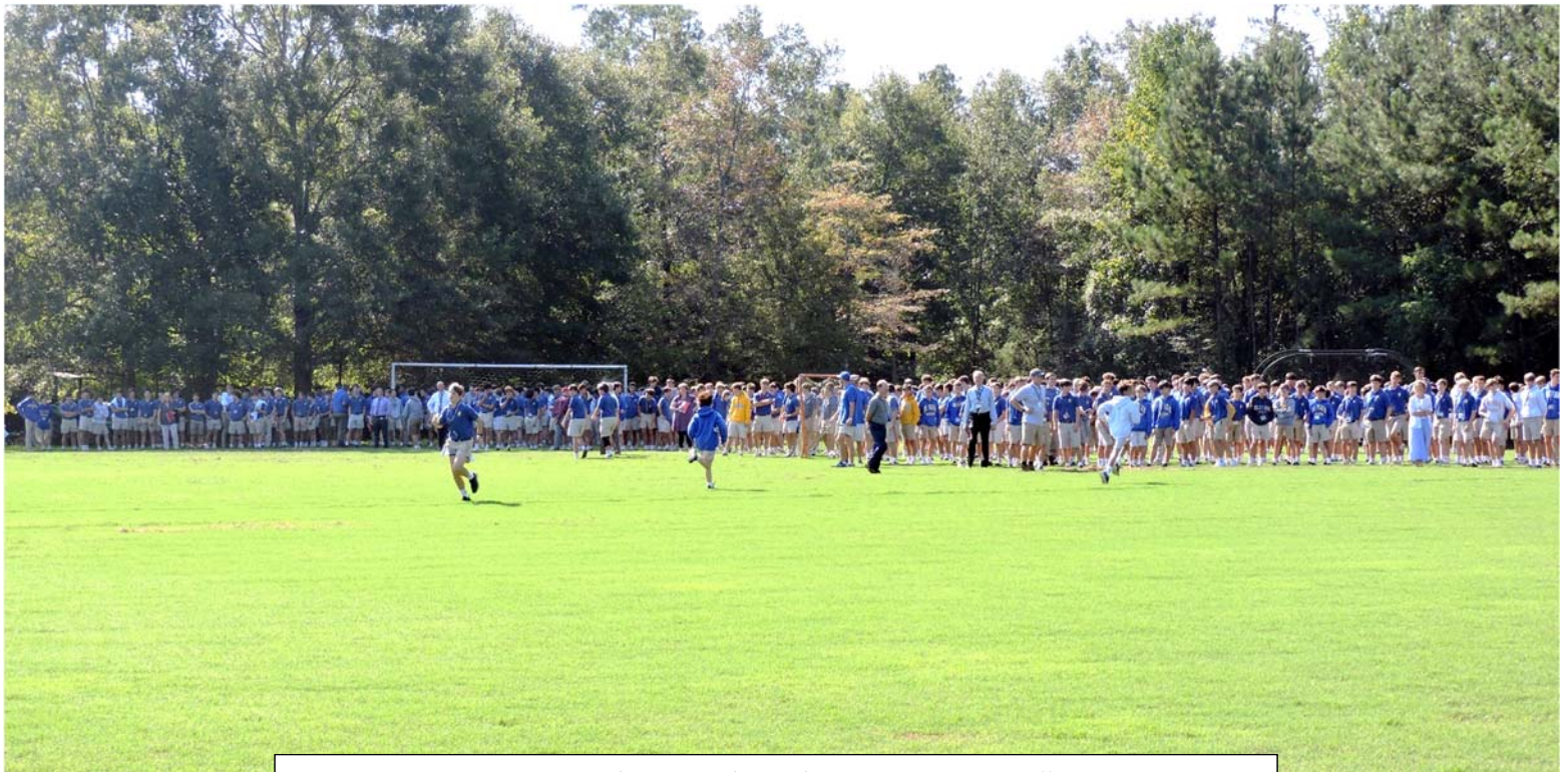
Runners submit attendance during Evacuation Drill.