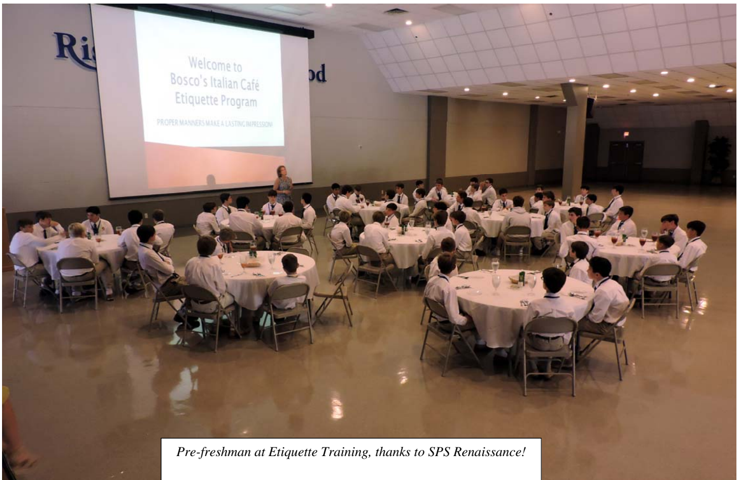
Pre-freshman at Etiquette Training, thanks to SPS Renaissance!