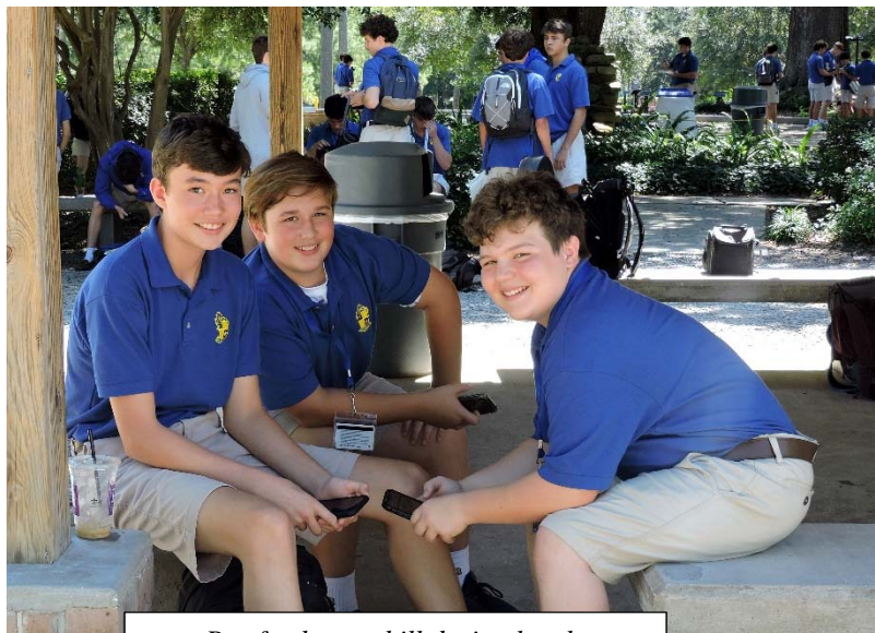
Pre-freshmen chill during lunch.