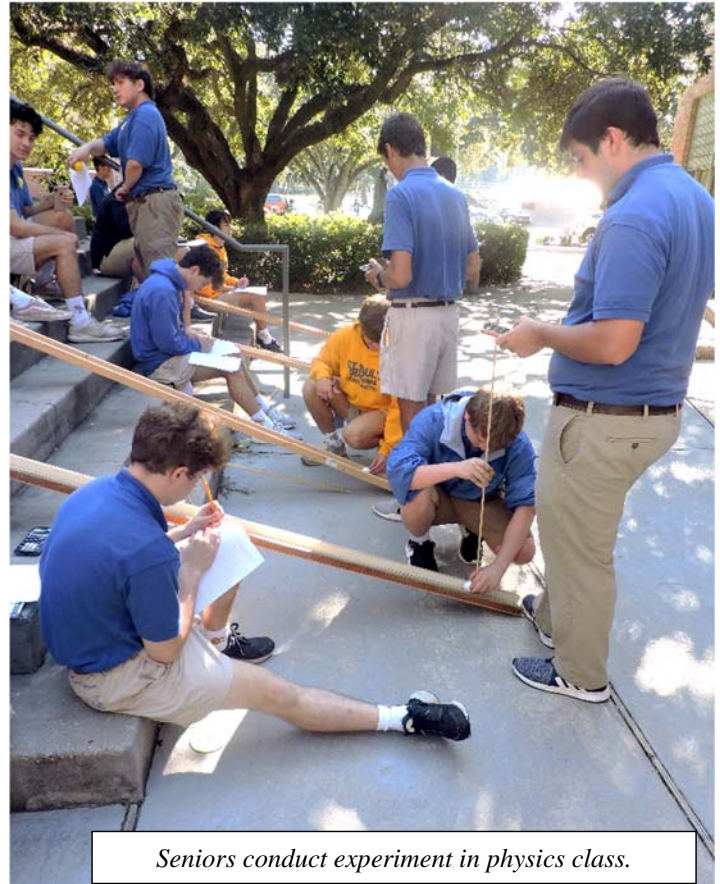
Seniors conduct experiment in physics class.