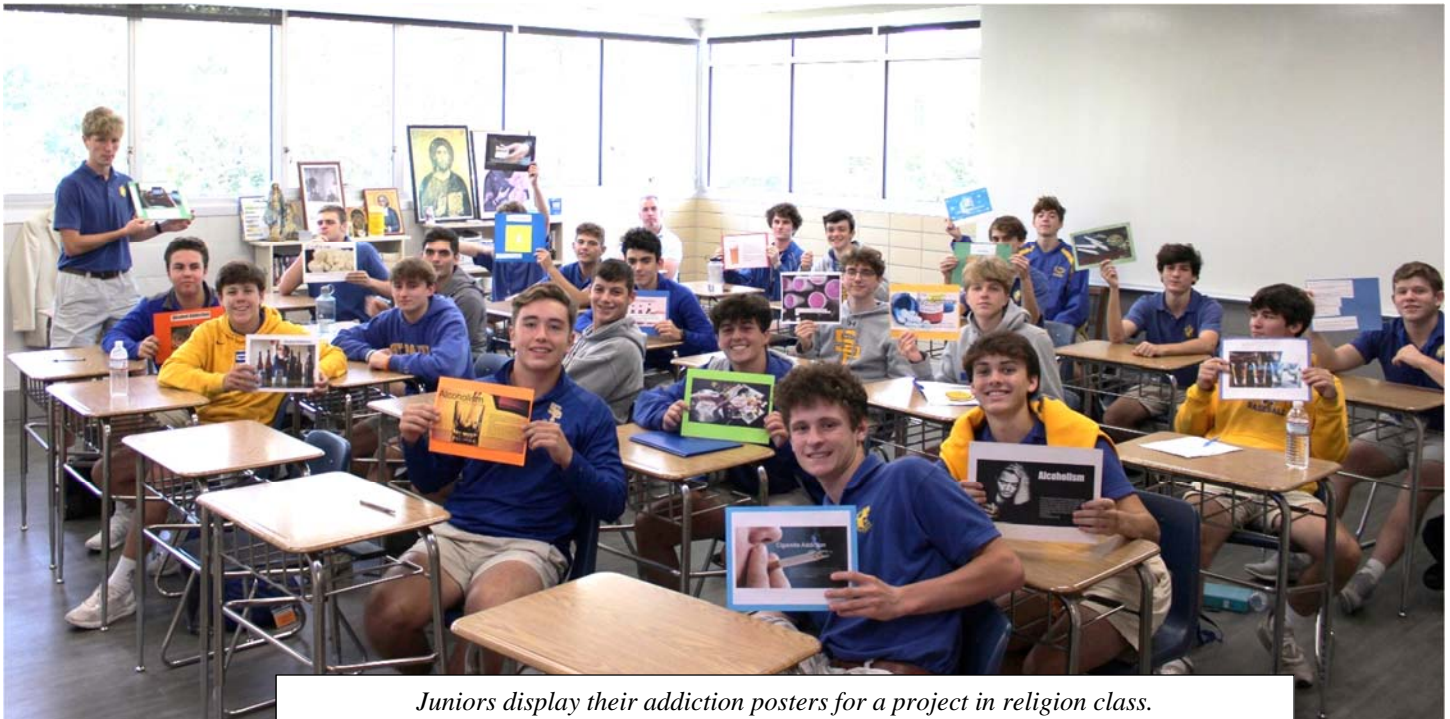
Juniors display their addiction posters for a project in religion class.

FOOTBALL GAME CONDUCT FOR ADULTS: With the opening of our football season, we expect the adult community to set a positive example for the students. Accordingly,