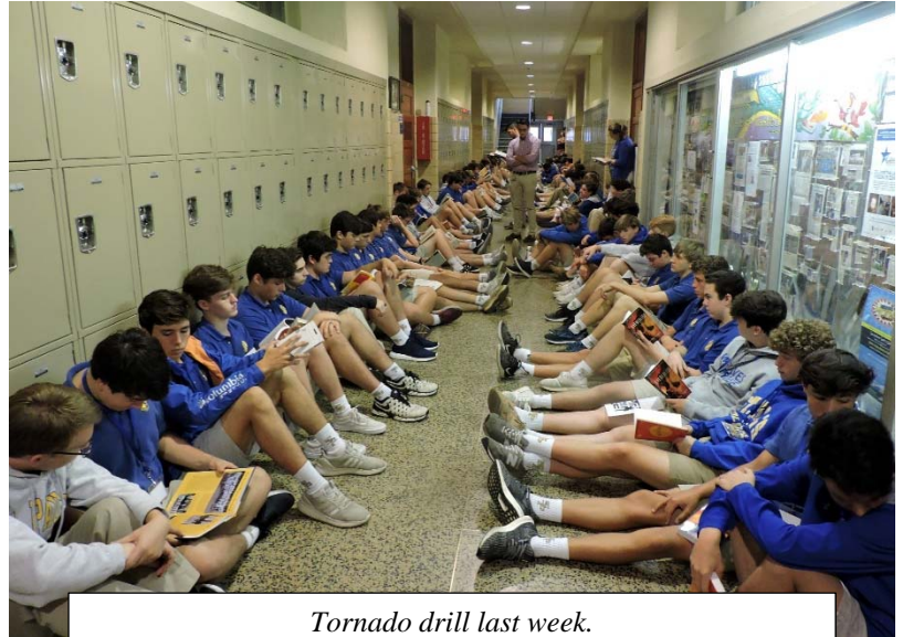
Tornado drill last week.

AFTER SCHOOL ISSUES: Assignment Hall and detention are in full operation. Parents, please stress with your sons the need to do homework and follow rules. And if your son does end up in AH or detention, please establish a procedure for him to follow so that you are not wandering around looking for him. We tell the AH student to call their parents. We'll provide a phone if needed.