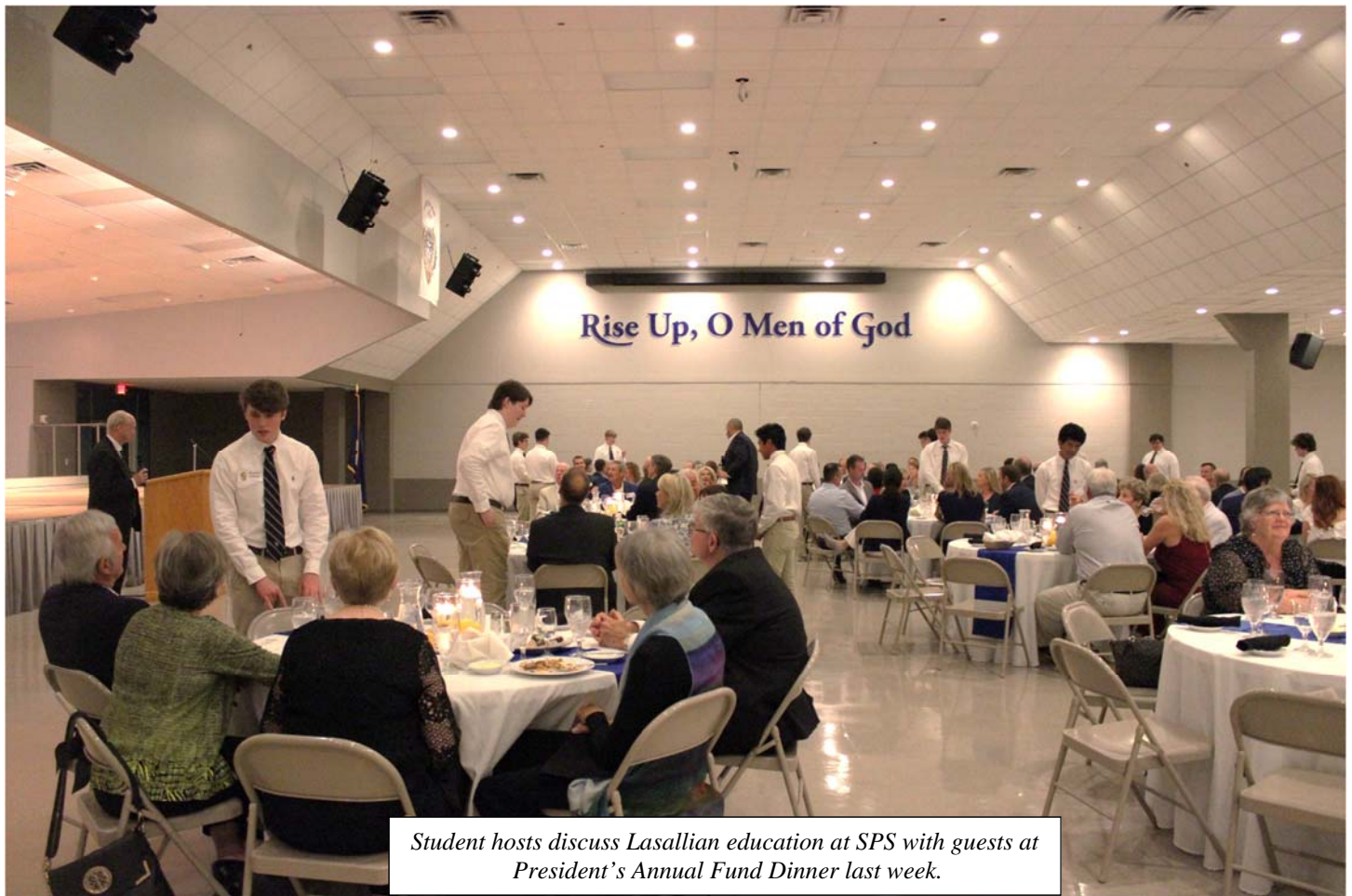
Student hosts discuss Lasallian education at SPS with guests at President's Annual Fund Dinner last week.