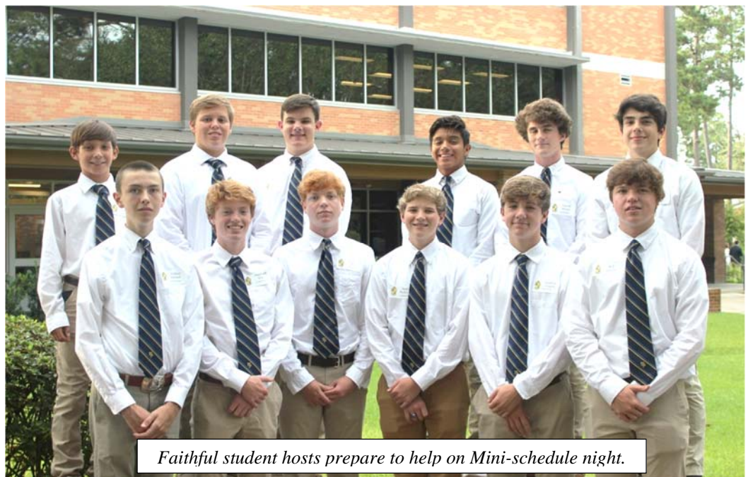
Faithful student hosts prepare to help on Mini-schedule night.

adopted the Gregorian calendar, already in effect in the rest of the world (you know those independent British!) As a result, Sep 3 instantly became Sep 14 simply by an Act of Parliament. The people were outraged and demanded their 11 days back. Moral: make the most of each day God gives us; while it's a shame to lose a day, it's even worse to waste it.