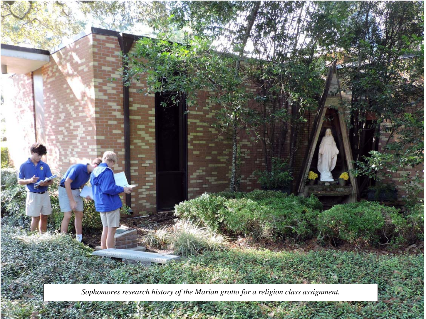
Sophomores research history of the Marian grotto for a religion class assignment.

DEVELOPMENT OFFICE: Danielle sent the following last week to the 110 donors from last May's GiveNola day, which targeted theater renovations: Several months ago, you very generously donated to our #LightTheStage campaign on GiveNola day. With over 110 of you contributing and $14,000 raised, we were able to make a difference! During the summer break, our electricians were busy with the upgrade. New LEDs were installed on every column, so that the rotunda could be lit for pre-show and show time as well, with a variety of colors. A work light was installed over the stage and two side work lights were replaced with stronger LEDs so the students will have increased visibility during class. In addition, the bulbs over the seats were replaced to give the area a warmer look and feel. We couldn't accomplish this work without your help! THANK YOU for your investment in Saint Paul's School!! I've attached a couple of photos for your review. https://drive.google.com/drive/folders/1J3Fp3JqACIPKVHfn4Z4eJ4X7kwm1KgoE?usp=sharing