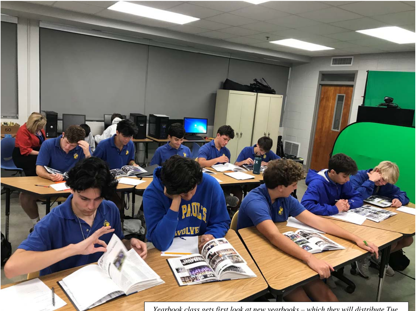
Yearbook class gets first look at new yearbooks – which they will distribute Tue.