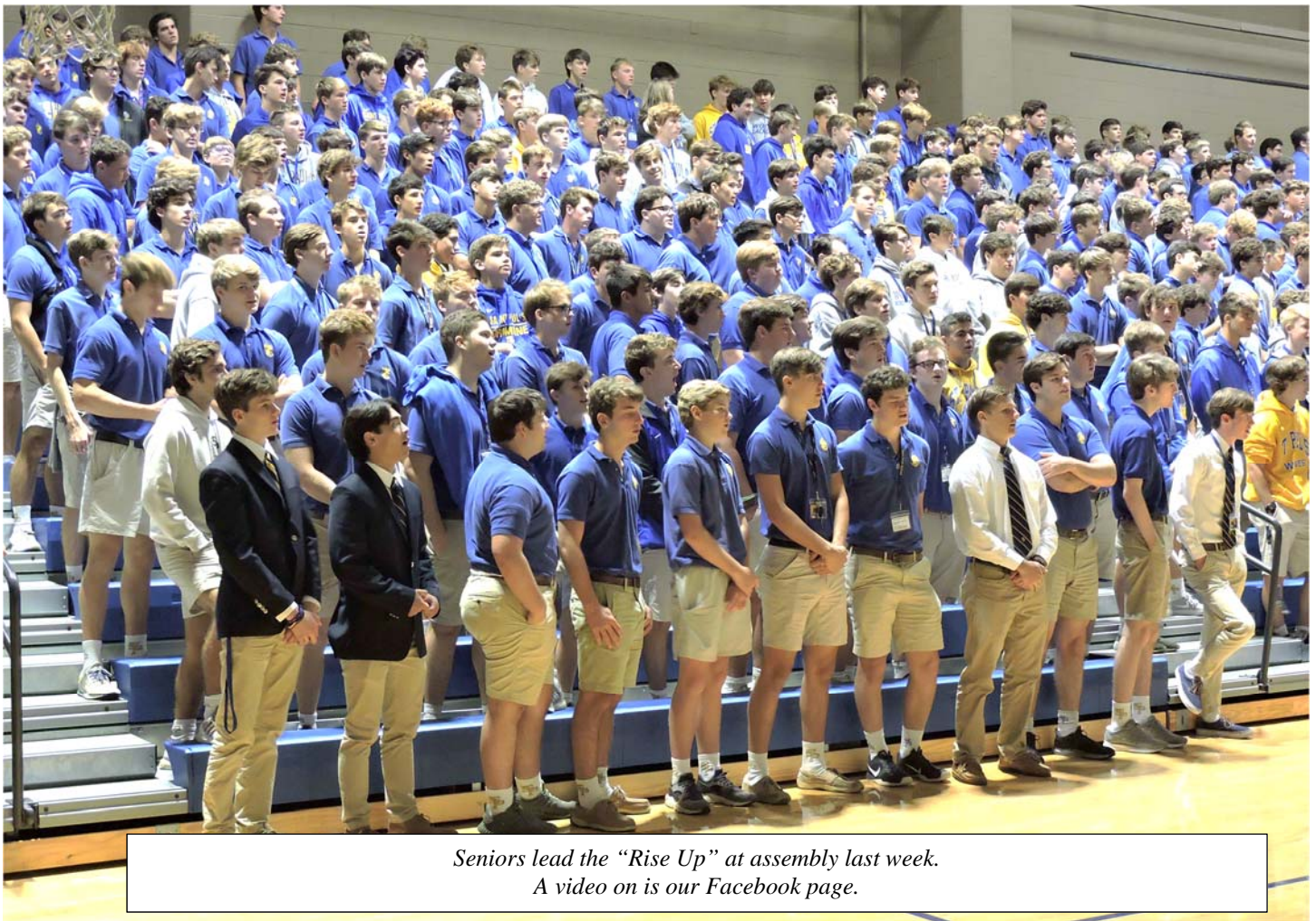
Seniors lead the “Rise Up” at assembly last week. A video on is our Facebook page.

ASSIGNMENT HALL: AH is in full swing. Students are sent to AH if they report to class without their homework. They will stay in AH after school until they finish the homework. AH is not a punishment but a helping structure. Please stress with your son the need to complete his homework on time and to bring it to class.