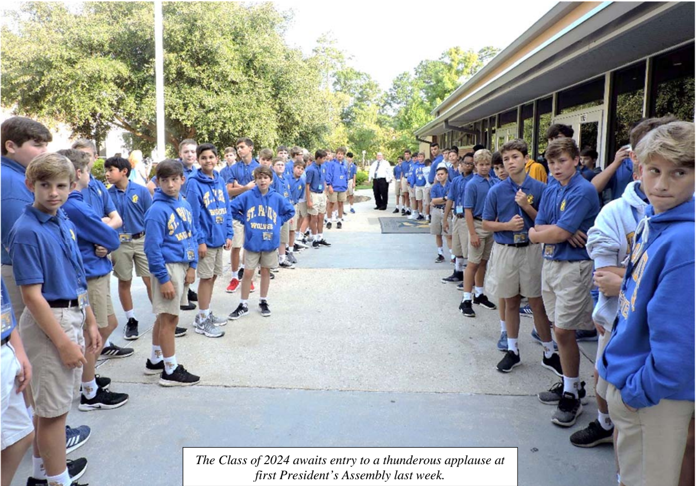
The Class of 2024 awaits entry to a thunderous applause at first President's Assembly last week.

Sun, Aug 25 26 (I encourage our Catholic families to attend mass as a family and our non-Catholic families to worship at their place of choice)