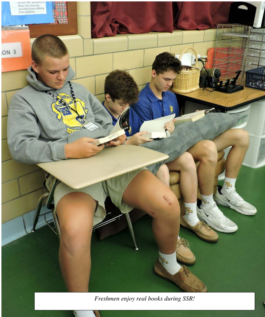
Freshmen enjoy real books during SSR!

WOLF PACKS: Our revised advisory program (now known as Wolf Packs) debuts on Tuesday. Here are highlights: