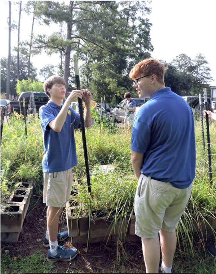
Wolves prep vegetable garden to prepare for growing vegetables for the local food bank.