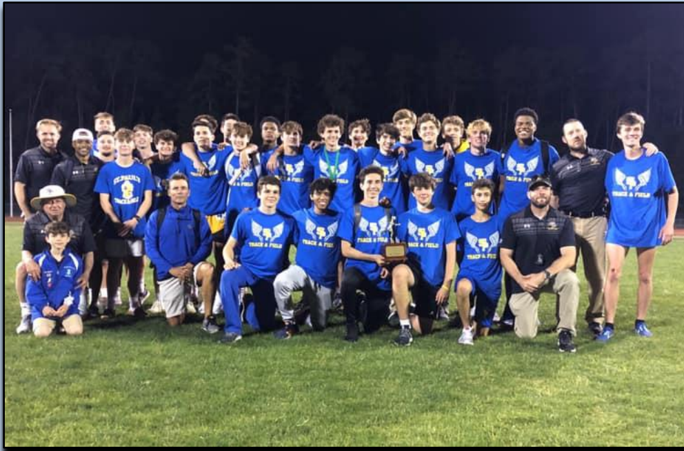
Pictured at left are members of the 2019 Track and Field team.