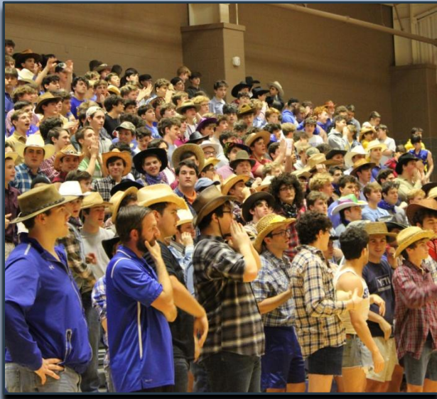
Challenge Night theme of Cowboy was a big hit for SPS students.