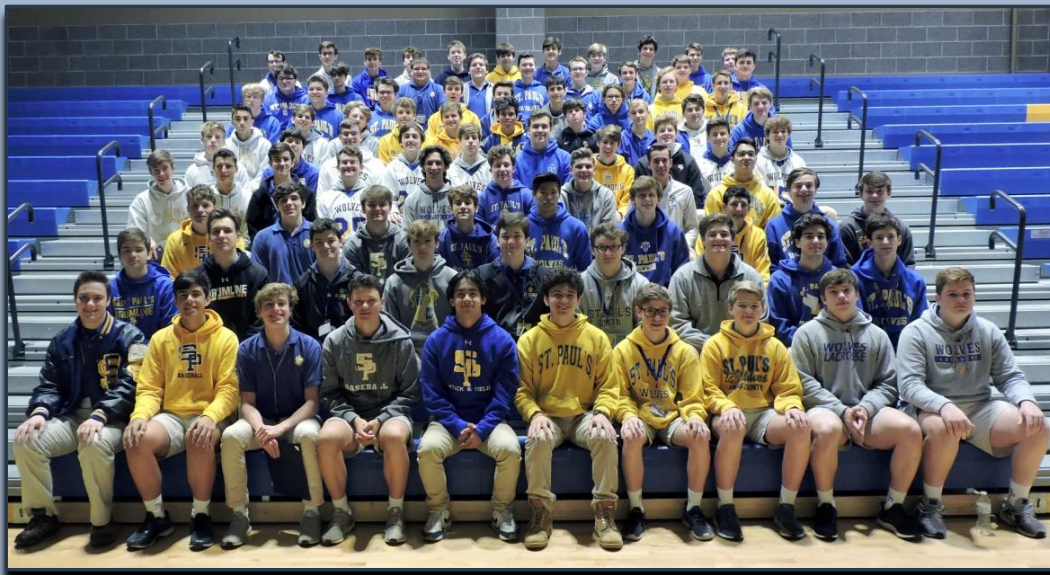
Members of the 30+ Club who enjoyed a pizza lunch are pictured at a President's Assembly.