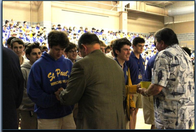
Seniors receive their alumni pin from class members of 1969.