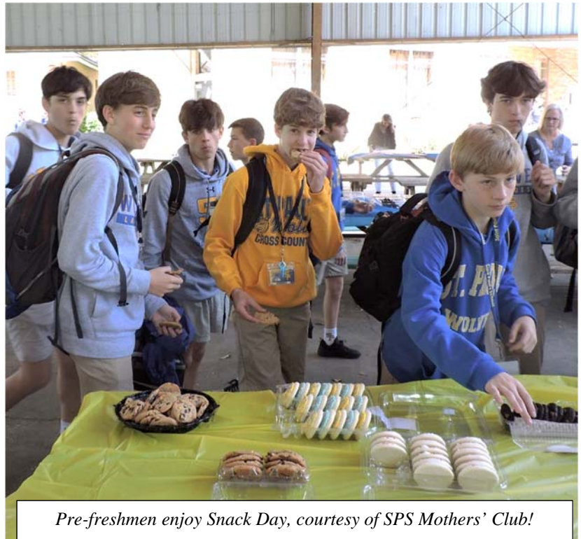
Pre-freshmen enjoy Snack Day, courtesy of SPS Mothers' Club!

Mon, Apr 22 – Sun, Apr 28: EASTER HOLIDAYS (NOT SPRING BREAK): We give these holidays in honor of Easter, not in honor of spring. Please AVOID using the terminology of “spring break” as we must stress the religious nature of these holidays. You are on your own for TDIH, school events and National Whatever Days!