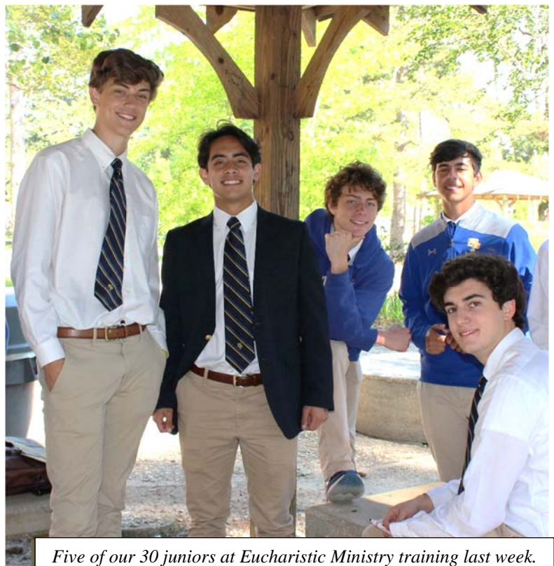
Five of our 30 juniors at Eucharistic Ministry training last week.