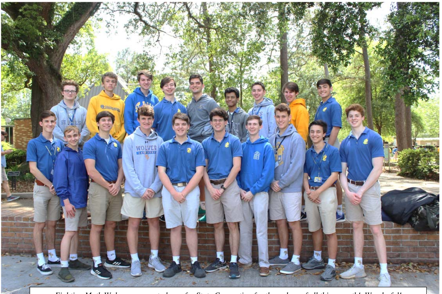
Fighting Math Wolves prepare to leave for State Convention for three days of all things math! Wonderful!

Care & Vigilance: We must stay focused in these days before Easter Holidays (not spring break), especially with seniors. We will do our jobs competently, and we expect the students to do theirs. Please stress this with your sons – especially seniors.