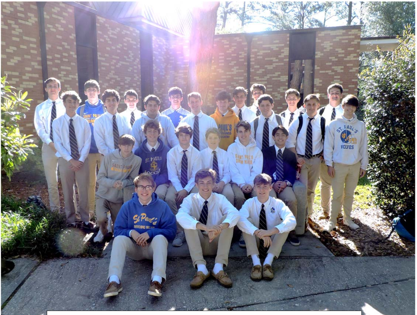
Juniors prepare for Eucharistic Ministry training!