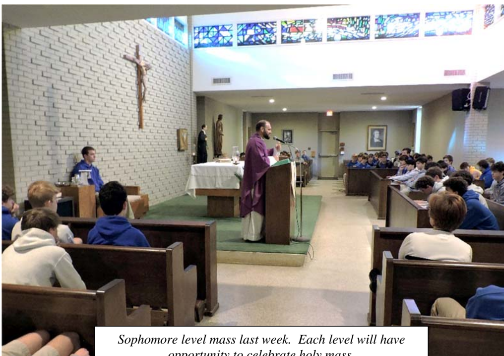
Sophomore level mass last week. Each level will have opportunity to celebrate holy mass.