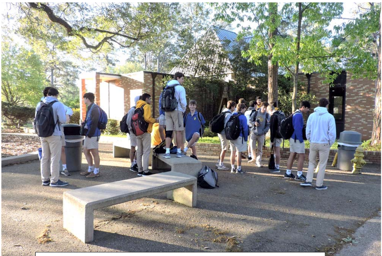
Juniors enjoy each other's company before school.

Study Hall after School: the library is open every afternoon (Monday-Thursday) until 4:30. Students are free to come and go by signing in and out. You are encouraged to mention this service to your sons who are on campus after school with nothing to do or who may be waiting for a late ride or a practice to begin. All we ask is that they treat the facility with respect and that they are quiet. The space will be supervised by faculty.