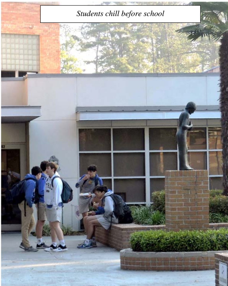
Students chill before school

Easter Holidays, not Spring Break: Saint Paul's gives holidays in honor of Easter, not in honor of spring. Accordingly, please refrain from using the term Spring Break. The holidays are to celebrate Easter, and anything we can do to reinforce that, we should. Names matter. Thanks. FYI, Easter holidays begin with Good Friday on April 19. Classes resume on Monday, April 29 with an all school mass.