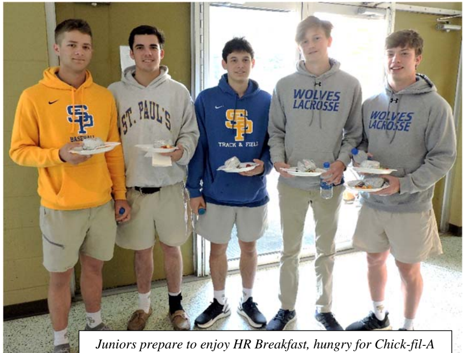
Juniors prepare to enjoy HR Breakfast, hungry for Chick-fil-A and vocabulary words!