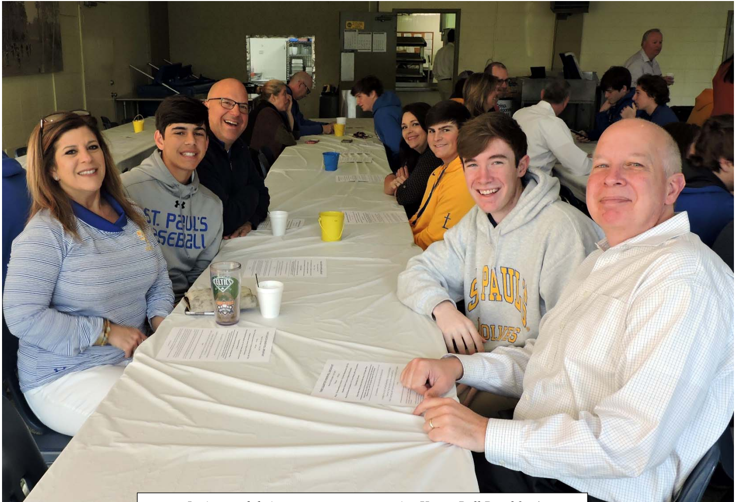
Juniors and their parents prepare to enjoy Honor Roll Breakfast!