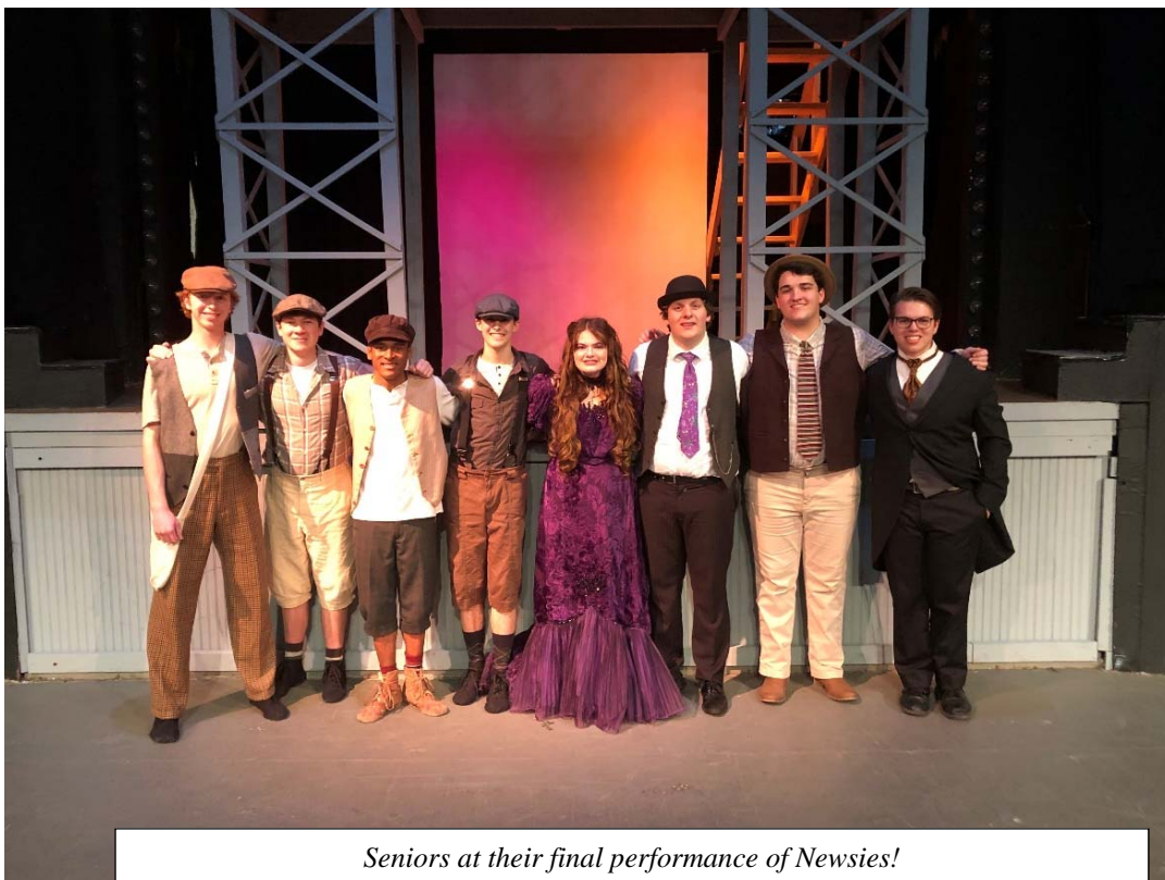
Seniors at their final performance of Newsies!