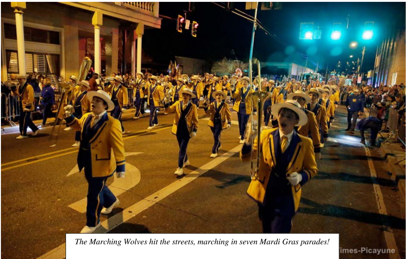
The Marching Wolves hit the streets, marching in seven Mardi Gras parades!

Mon, Mar 04 – Sun, Mar 10 – Mardi Gras / Beginning of Lent Holidays – you are own your own for TDIH, National Whatever Day, and athletic activities. The newsletter is tired and is taking a vacation. Next newsletter will be sent on Sun, Mar 10.