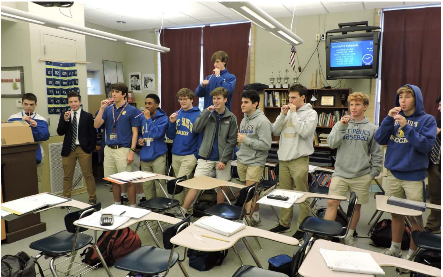
Physics students made musical instruments out of plastic straws and water to create different notes. They then played Twinkle, Twinkle Little Star.

CPR & Stop the Bleed Program: Continuing our efforts to promote student health and safety, we will be providing Stop-the-Bleed and CPR workshops to all of our students and faculty. These 90-minute workshops will begin this week. Lakeview Regional Medical Center, Pontchartrain Cancer Center, Mandeville Fire and Acadian Ambulance Service have generously donated time and expertise to bring these lifesaving skills to our students and staff.