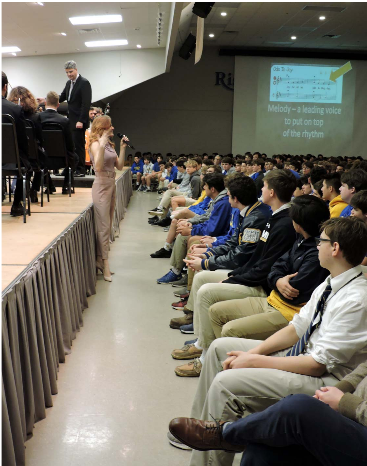
Students attend to LPO's concert last week.