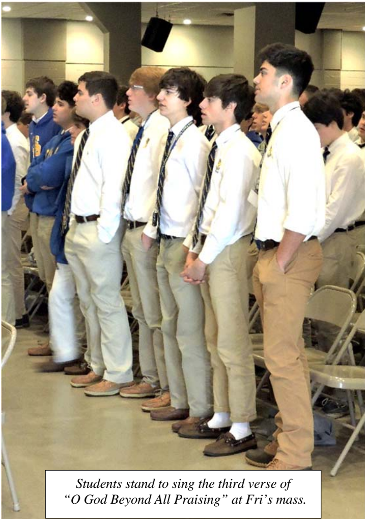
Students stand to sing the third verse of "O God Beyond All Praising" at Fri's mass.