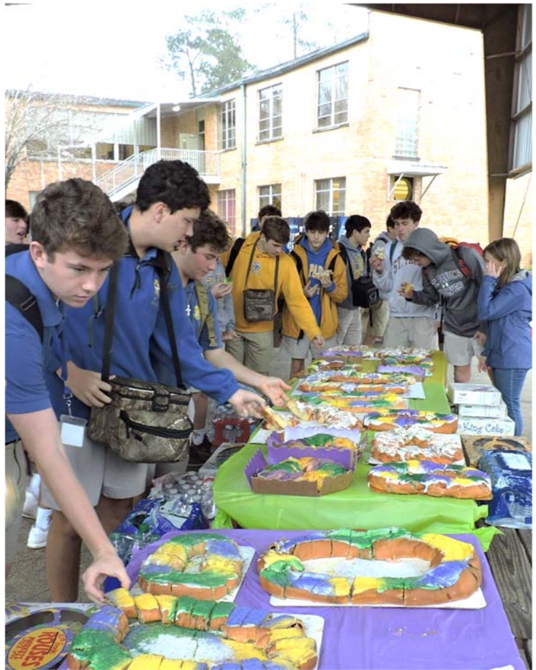
Hungry Wolves attack Mothers' Club King Cake Day! Did you ever see so much King Cake in one location?