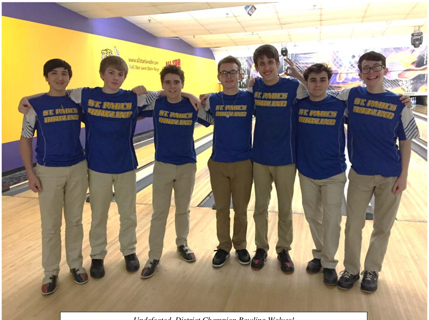
Undefeated, District Champion Bowling Wolves!