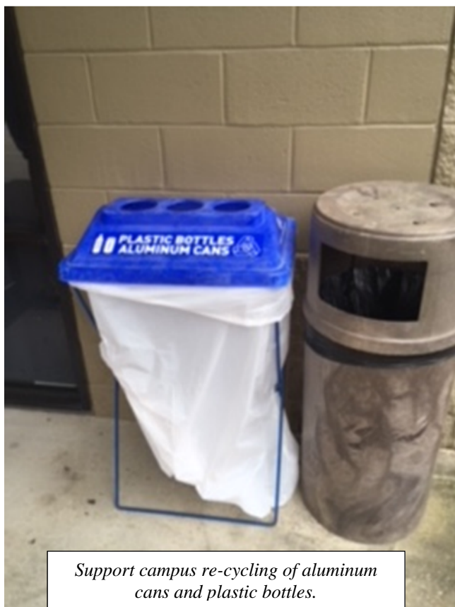
Support campus re-cycling of aluminum cans and plastic bottles.

Recycling Initiative: Our Env Science Wolves encourage student to participate in their recycling efforts. They recycle aluminum cans and plastic bottles. Please encourage your son to support this initiative.