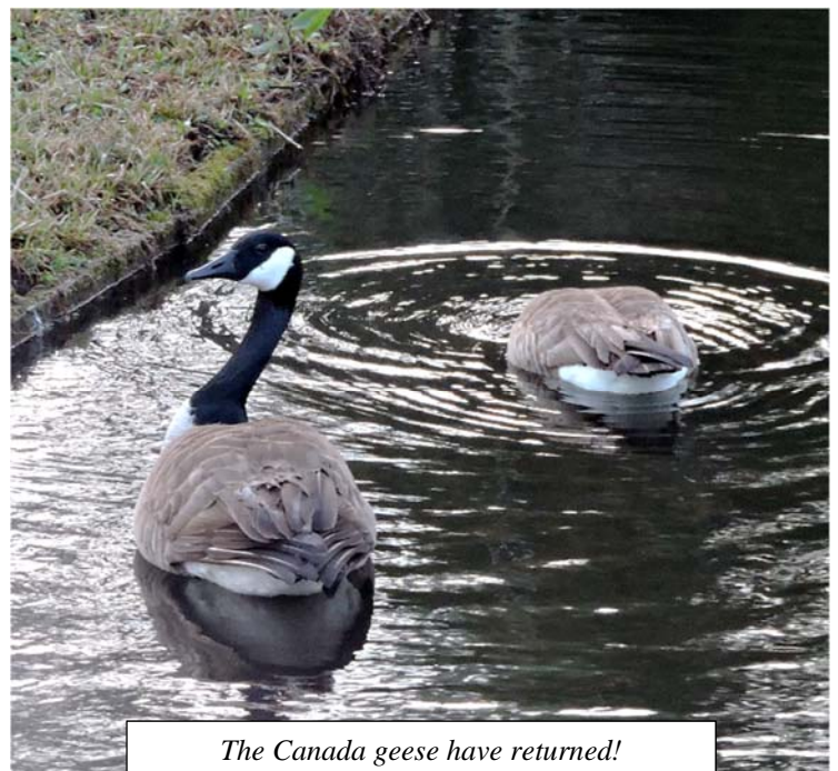
The Canada geese have returned! Can spring be far behind?