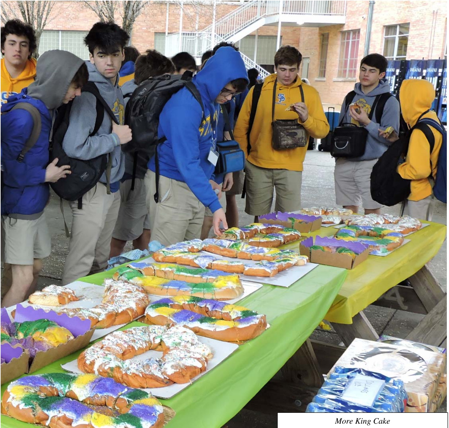
More King Cake

Tuxedoes: Tuxedoes to Geaux will be at Saint Paul's on Monday, March 11, at 11 am in the lobby of the BAC and on Tuesday, March 19 th , at 3 pm in the bookstore. Tuxedo, shirt, and tie -- $159 plus tax.