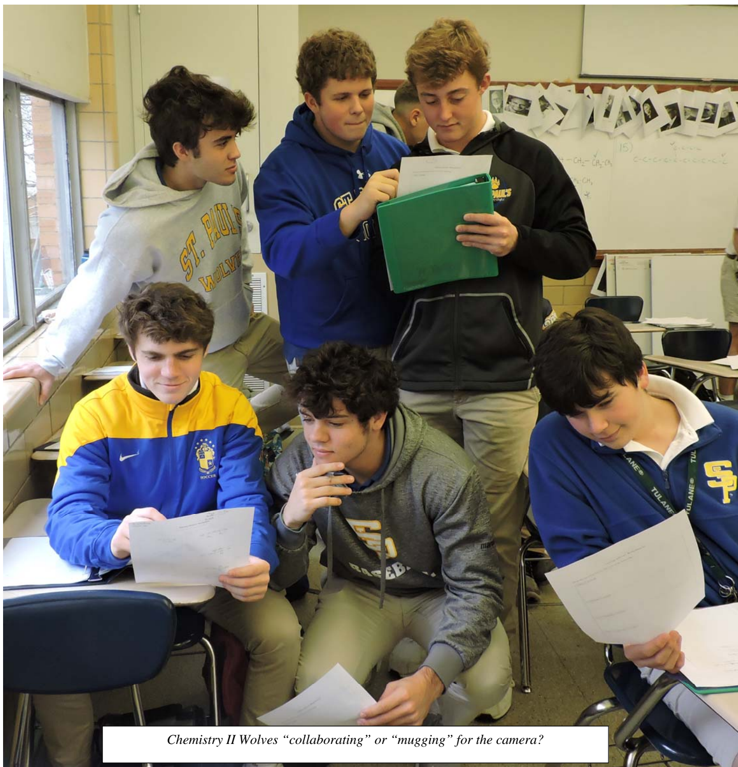
Chemistry II Wolves “collaborating” or “mugging” for the camera?

Paper Wolf Update: Please encourage your students to read The Paper Wolf on line ( www.thepaperwolf.com ) and read it yourself. Compliment the staff. Subscribe. Support the future of journalism.