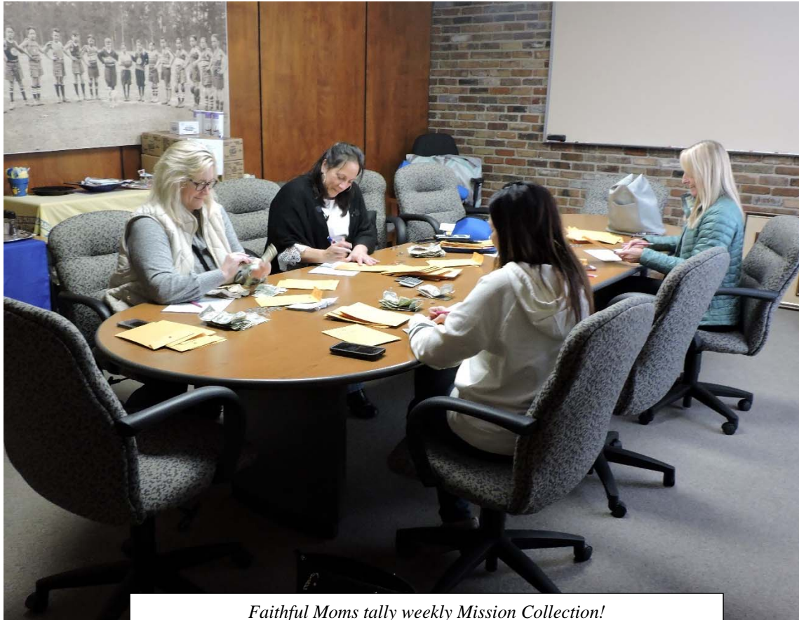
Faithful Moms tally weekly Mission Collection!

Fortnite Addiction: Several reputable journals ran stories last week on a growing phenomenon: addiction to Fortnite. Here's an article from The Denver Post: https://www.denverpost.com/2018/12/02/fortnite-addiction-video-game-rehab/ Some parents have even sent their kids to Fortnite rehab! I definitely am concerned for some of our students!