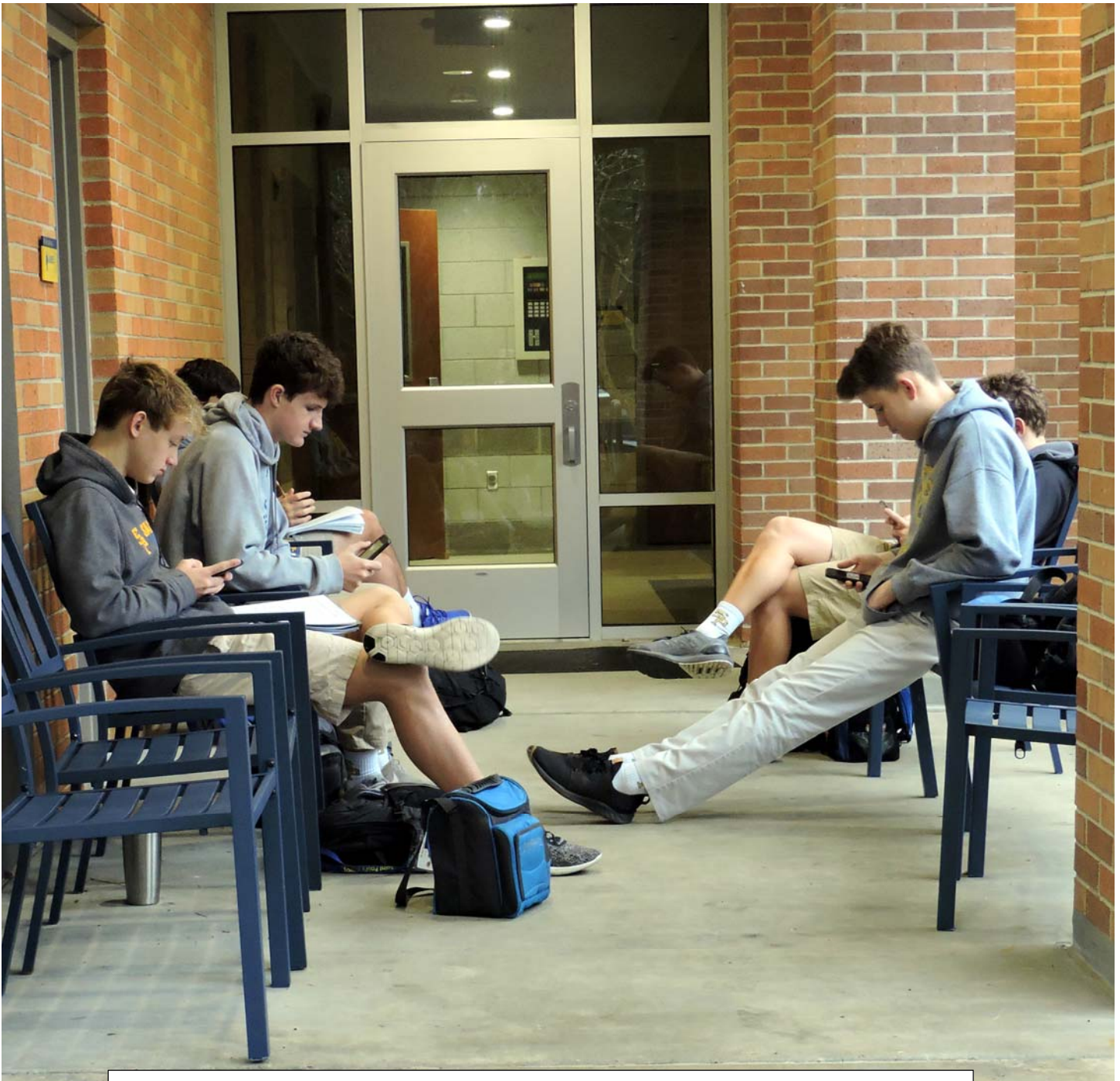
Typical before school scene....put the phones away, Wolves, and talk to each other!

SAFE DRIVING: Please obey the traffic laws: speed limit, no tailgating, no texting while driving, NO CELL PHONE USE DURING SCHOOL ZONE TIMES, buckle up, etc. Thank you!