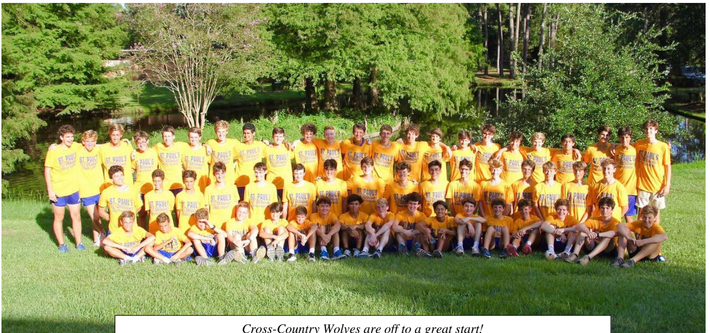
Cross-Country Wolves are off to a great start!