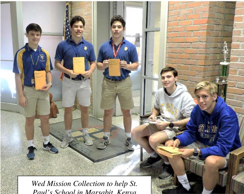
Wed Mission Collection to help St. Paul's School in Marsabit, Kenya

Mon, Sep 17 (Regular; C D E F G; we will have two five period days to make up for Fri)