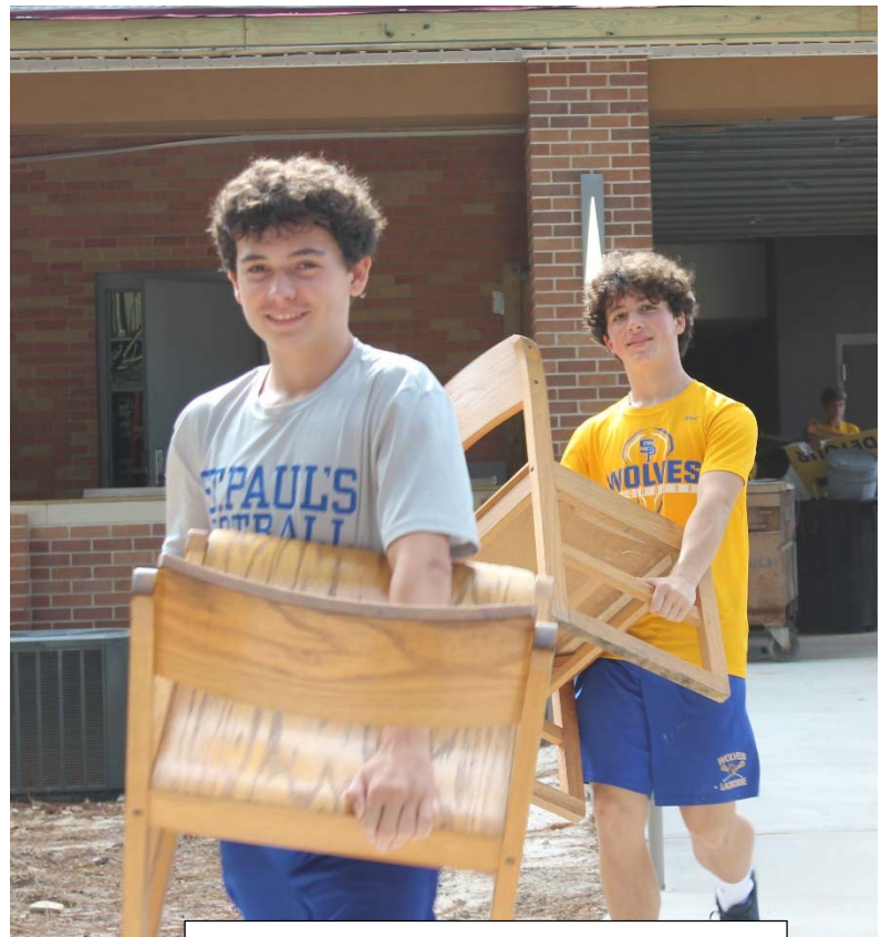
Pre-freshmen help move furniture into renovated Benilde Hall!