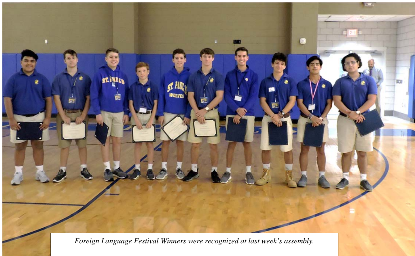
Foreign Language Festival Winners were recognized at last week's assembly.