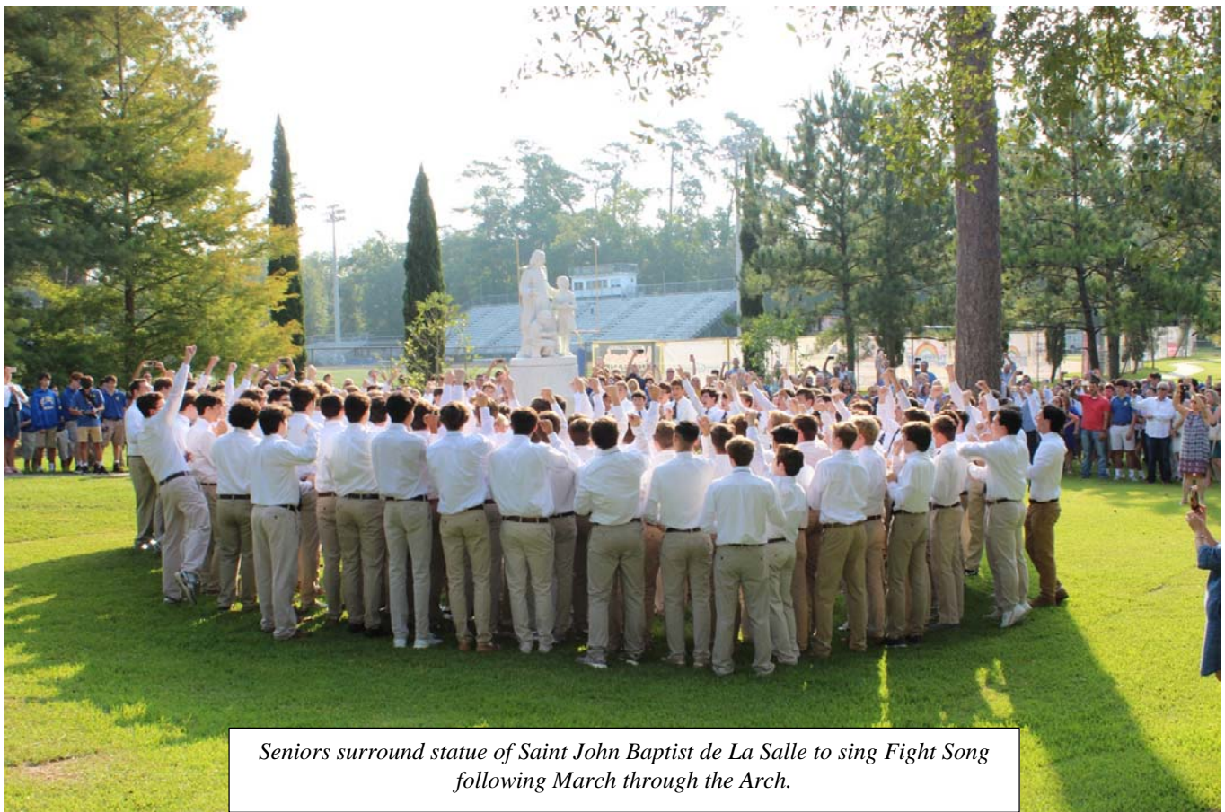
Seniors surround statue of Saint John Baptist de La Salle to sing Fight Song following March through the Arch.

~ St. John Baptist De La Salle (Meditation 99.2)