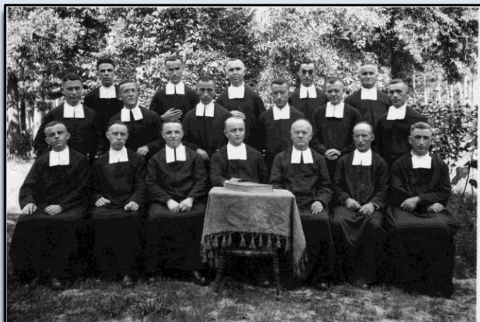
Saint Paul's College Faculty in 1921