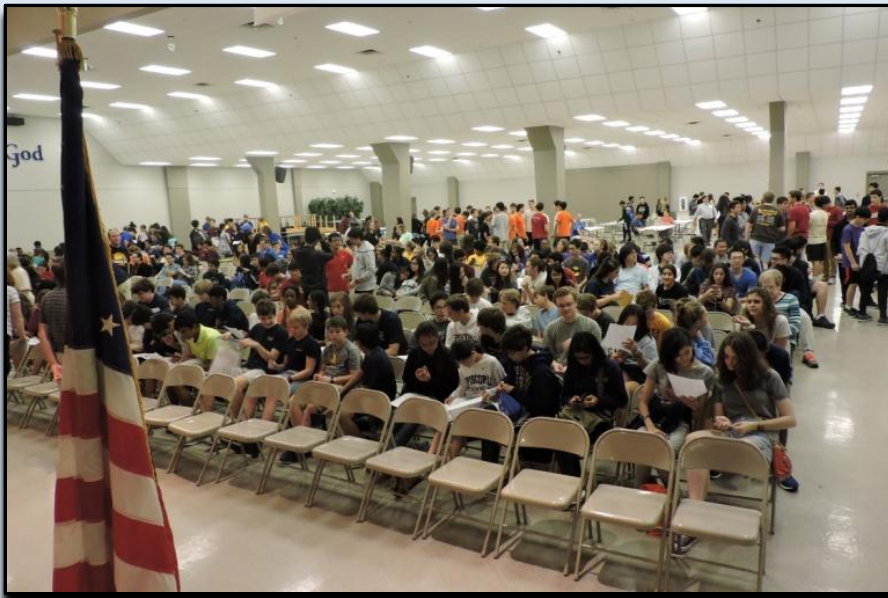
Math teams from over twenty schools gather in the Briggs Assembly Center to compete in the SPS Math Tournament.