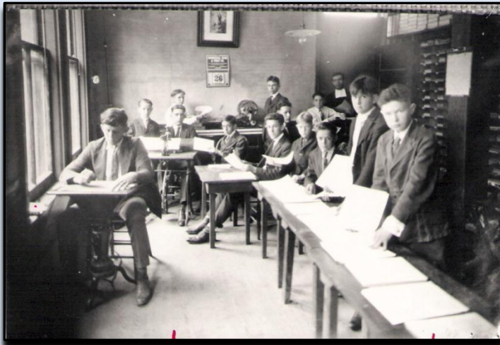
The newspaper staff of 1922 sorts pages of the school newspaper.

Or take the Paper Wolf online student newspaper, a program which has won multiple awards, including a first place prize given by the Columbia Scholastic Press Association, one of the most prestigious awards possible for any student newspaper. The Paper Wolf has remained at Saint Paul's School a beacon for all students to test their skills at journalism and writing, making it one of the most important clubs on campus as well as one of the most successful.