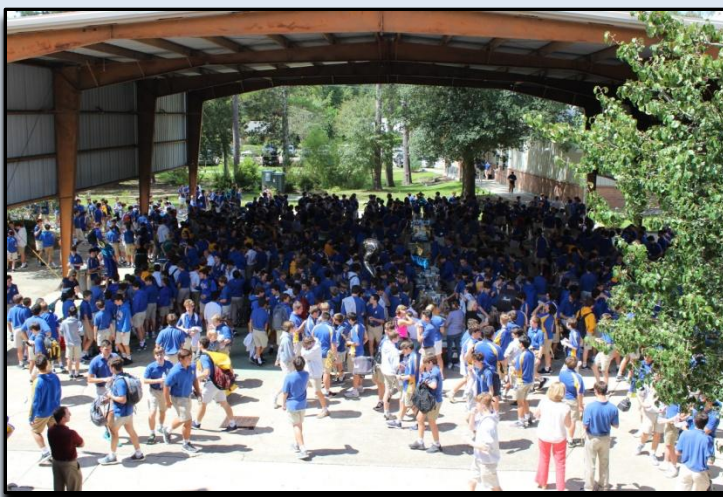
Students enjoy snack provide by The Mothers' Club.

The Marching Wolves lead the parade to commemorate the Brothers' and students arriving at Saint Paul's in 1918. Recently, the Wolves were highlighted on TV for their sense of style. Click HERE to view.