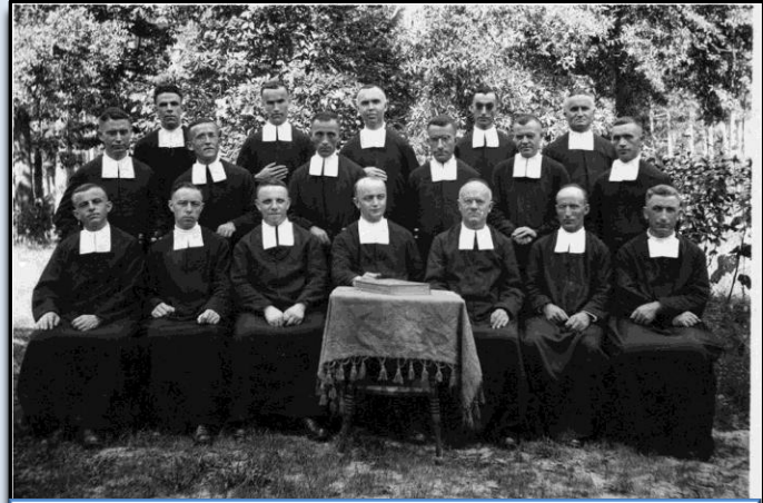
Saint Paul's College Faculty in 1921