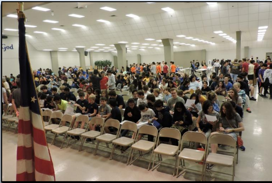
Math teams from over twenty schools gather in the Briggs Assembly Center to compete in the SPS Math Tournament.