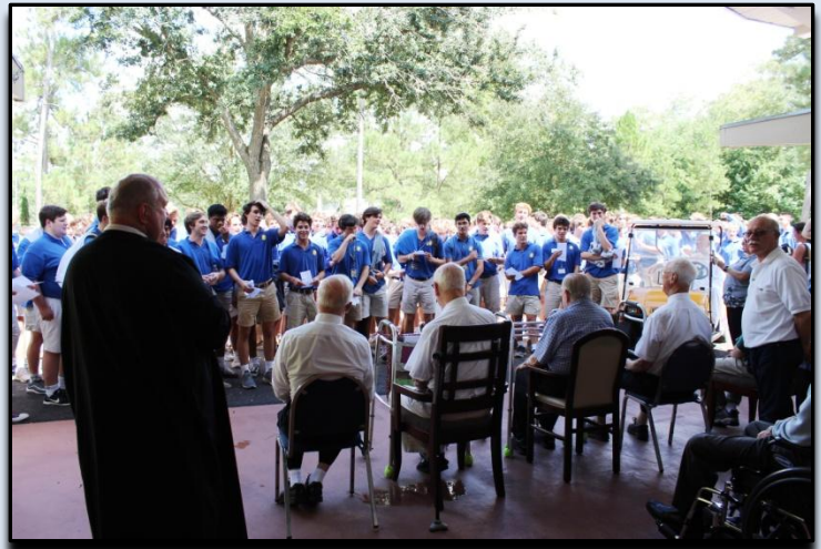
Students sing Honneur a Toi to the retired community of brothers.

The Marching Wolves lead the parade to commemorate the Brothers' and students arriving at Saint Paul's in 1918. Recently, the Wolves were highlighted on TV for their sense of style. Click HERE to view.