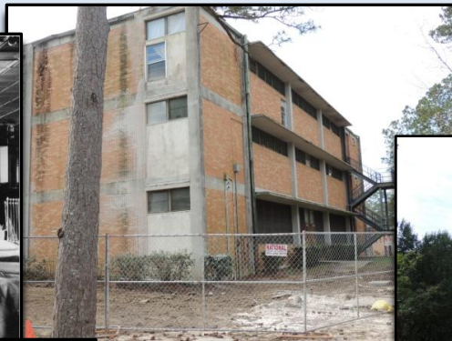
Elevator and new restrooms added.