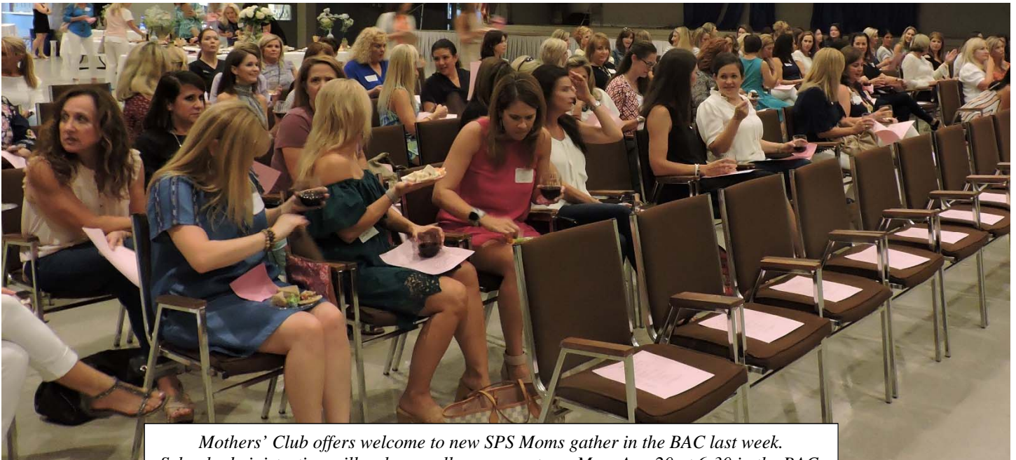
Mothers' Club offers welcome to new SPS Moms gather in the BAC last week. School administration will welcome all new parents on Mon, Aug 20 at 6:30 in the BAC.