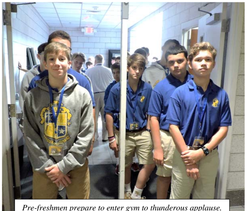
Pre-freshmen prepare to enter gym to thunderous applause.