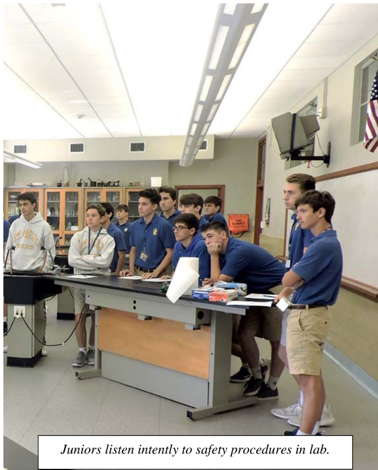
Juniors listen intently to safety procedures in lab.