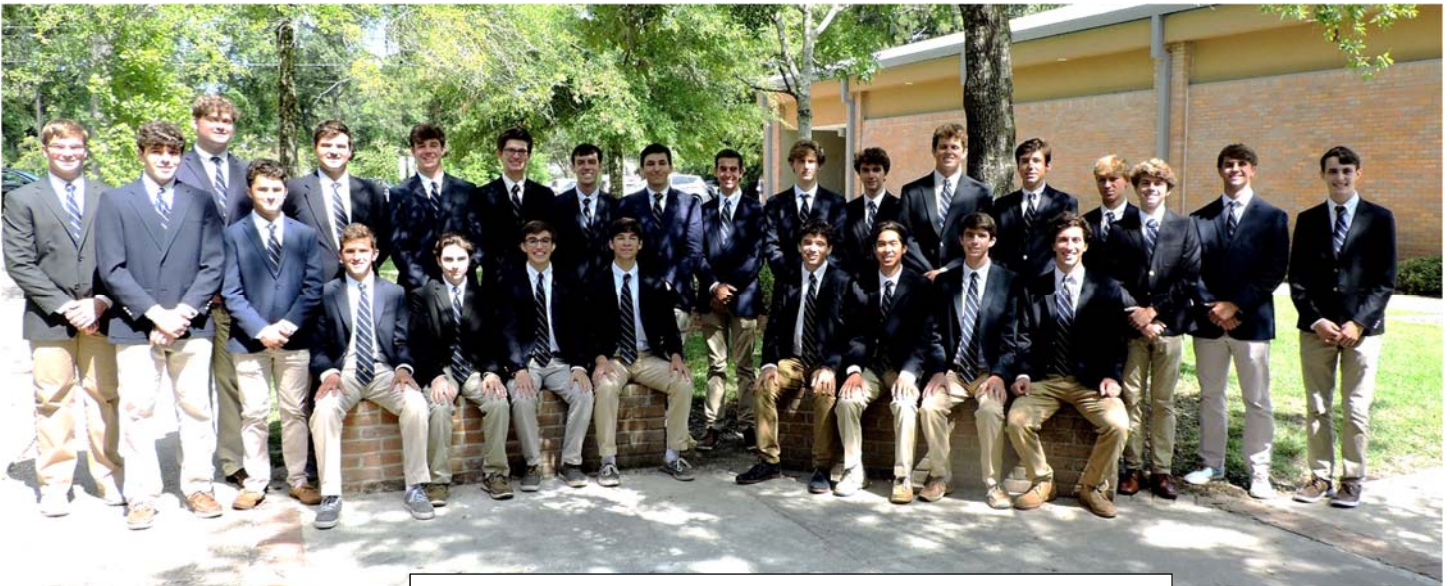
Our newly commissioned senior Eucharistic Ministers