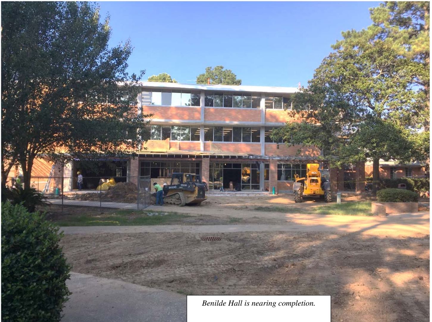
Benilde Hall is nearing completion.