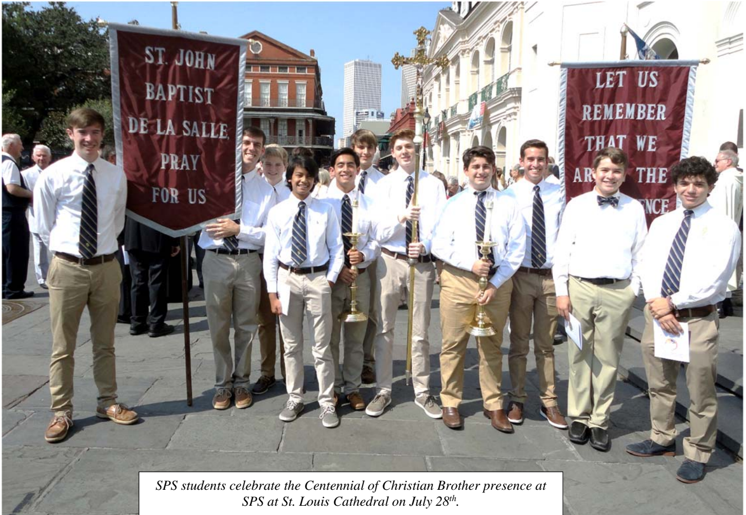
SPS students celebrate the Centennial of Christian Brother presence at SPS at St. Louis Cathedral on July 28 th .