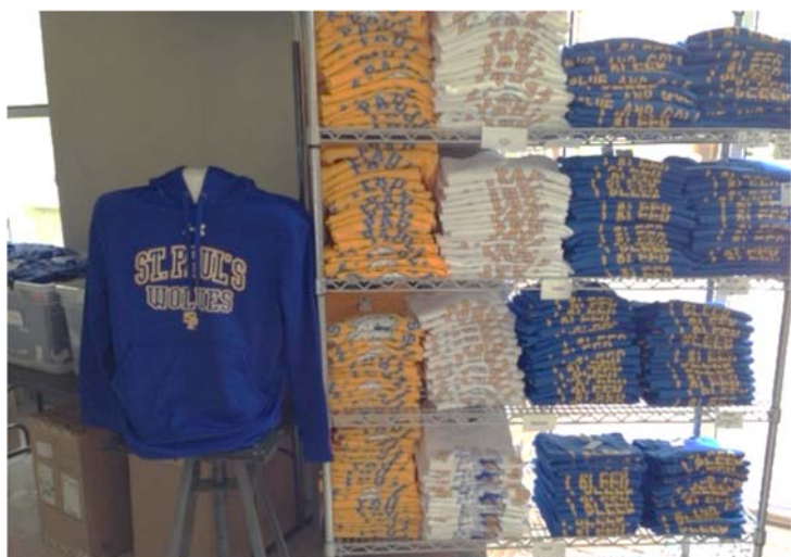
Mothers' Club Bookstore is well-stocked and ready for business. Thanks, MC!

School Mass: Our first all-school mass is Wednesday, Aug 15 – Feast of the Assumption.