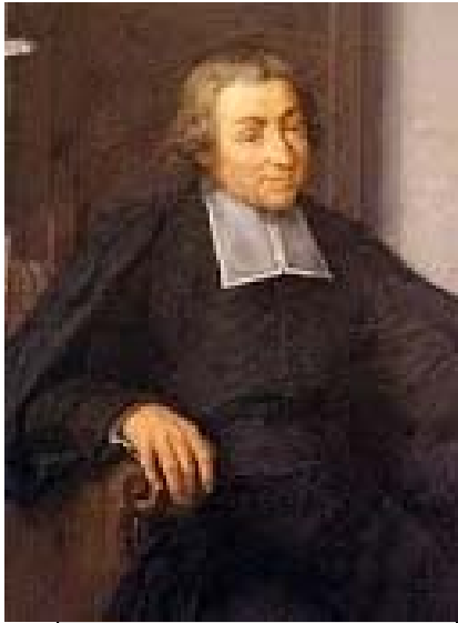
St. John Baptist de La Salle

Once again, welcome to 2018 - 19 school year – the beginning of the eighth year of our second century of life! I'm glad last week's mammoth newsletter didn't scare you off! I tried to make this one shorter!