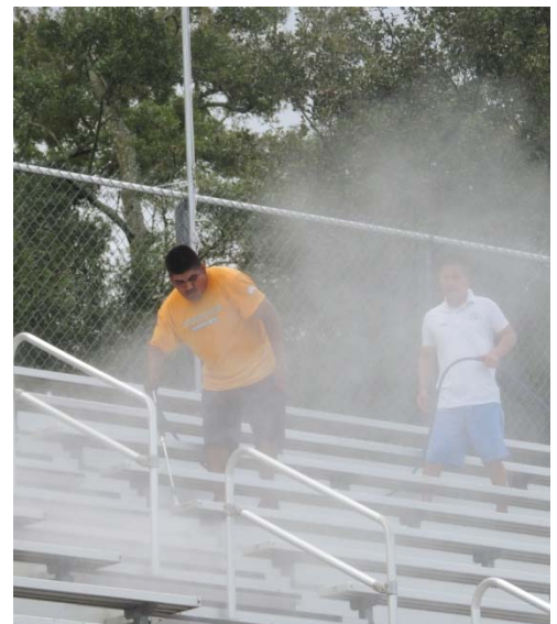
SPS Maintenance Crew power washes Hunter Stadium to prepare for 2018 season.

Late Start Dates: Here are late start (9 am) dates and days of no classes. If at all possible, please use these opportunities for your son's off campus appointments. I grow concerned about the amount of class time some students are missing: