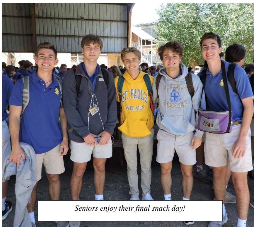
Seniors enjoy their final snack day!