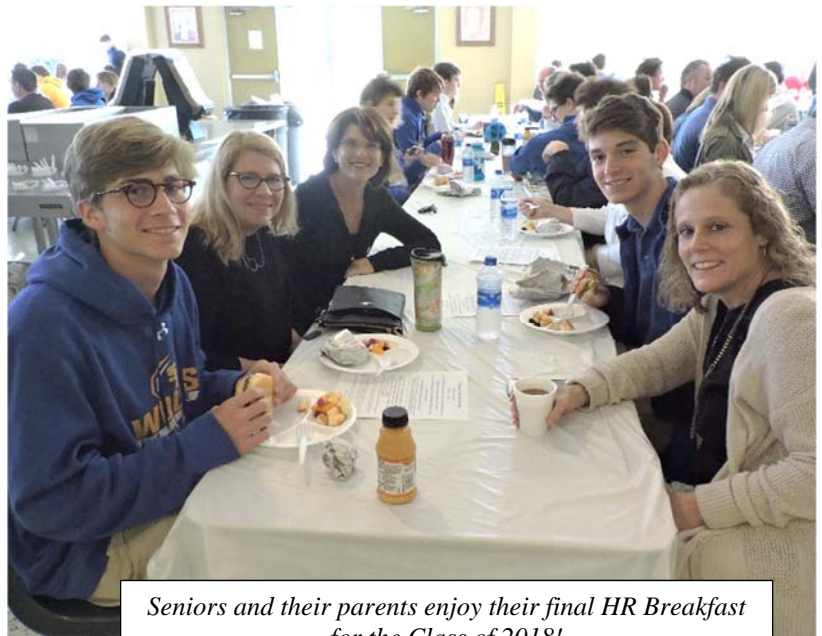
Seniors and their parents enjoy their final HR Breakfast for the Class of 2018!