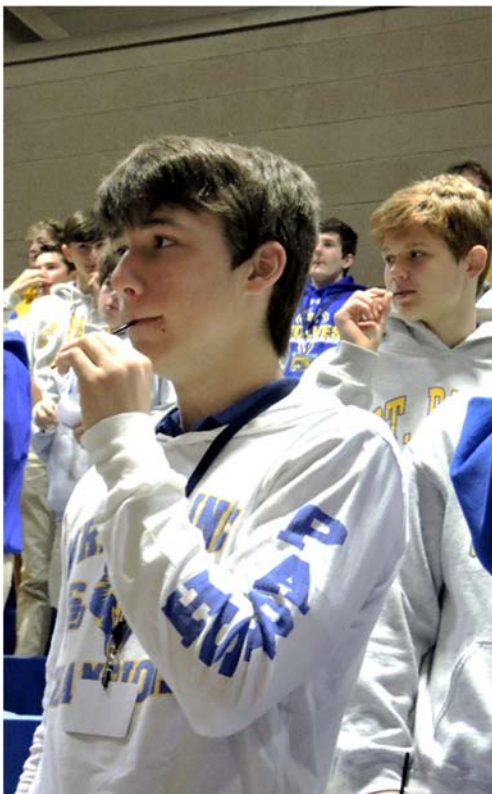
Students "breathe" through straws at last week's assembly. Ask your son why.