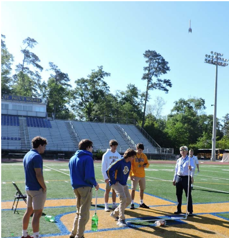
Senior-made rocket has lift off (upper right) in physics class.

Care and Vigilance: Please stress with your sons, especially your senior sons, that they must stay focused in these final weeks and do their jobs competently in order to end the year with “no issues.” We had several unacceptable behaviors again last week. I have instructed teachers to be caring – but vigilant – and hold students accountable.