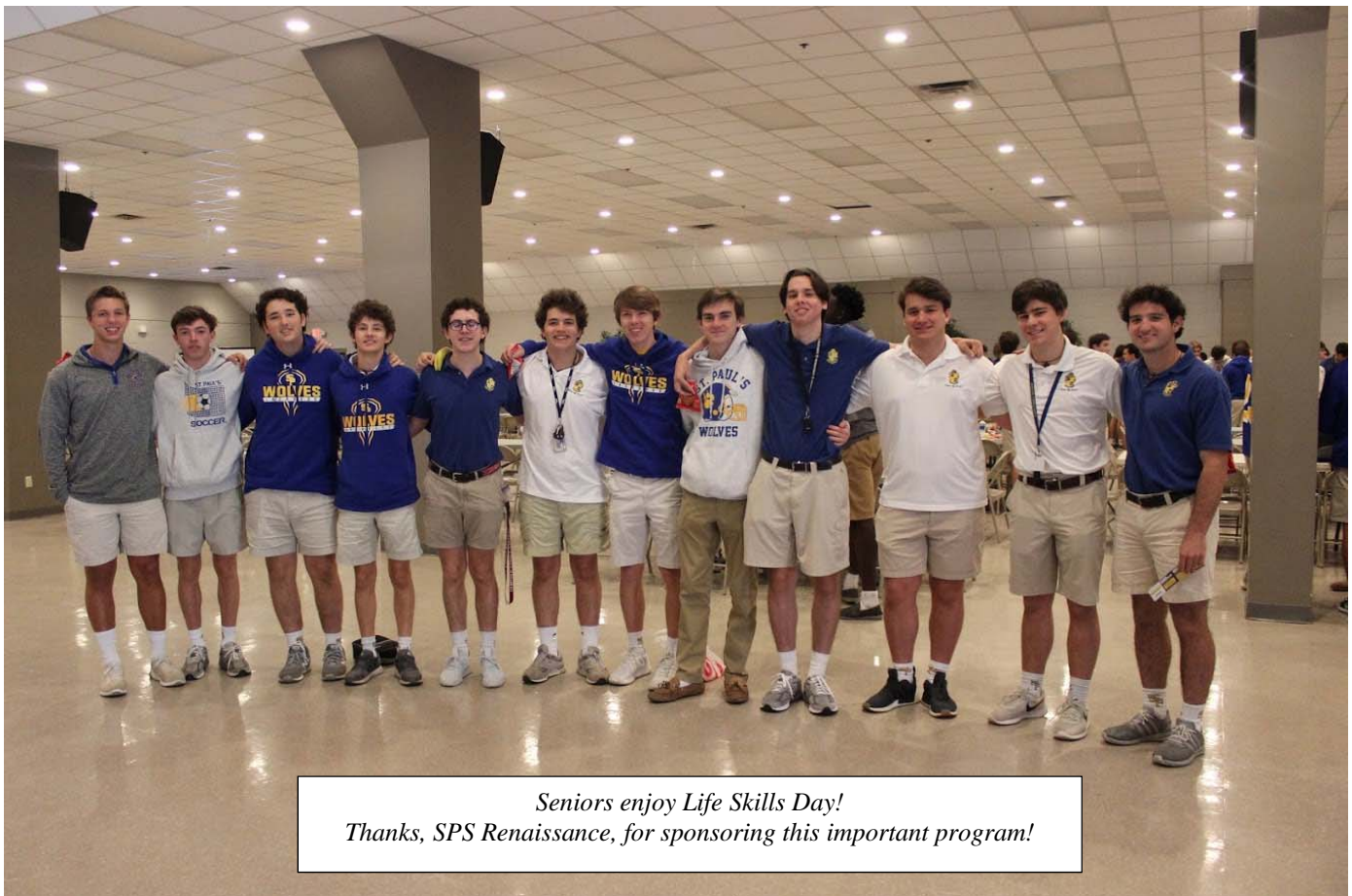
Seniors enjoy Life Skills Day! Thanks, SPS Renaissance, for sponsoring this important program!

Money: Parents, please stress with you son that they should NOT bring large sums of money to school. There is no need for students to have large cash amounts – which they invariable talk about which tempts others.