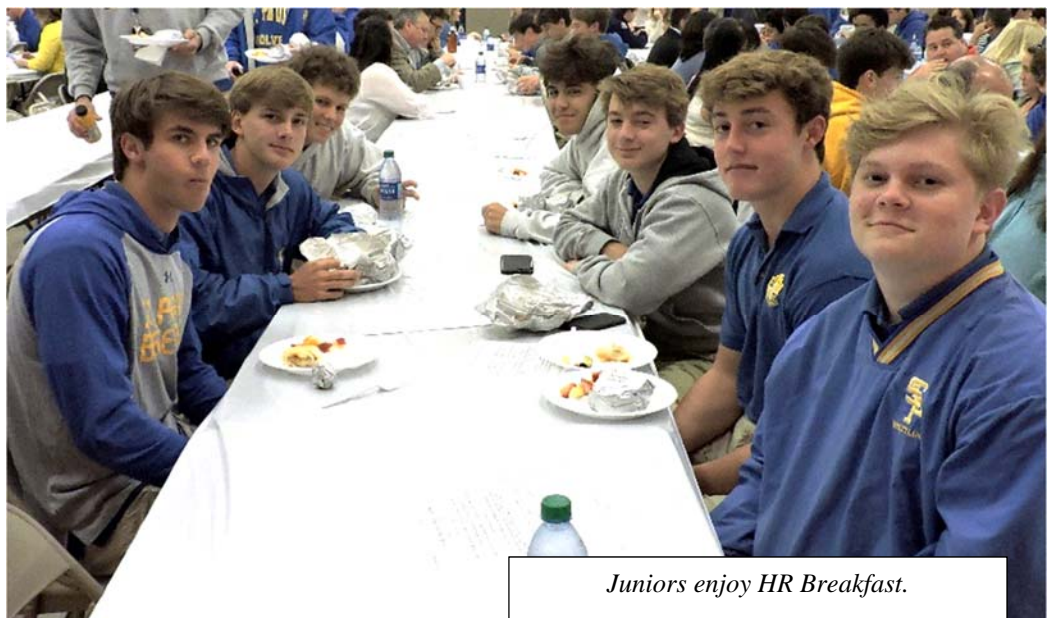
Juniors enjoy HR Breakfast.