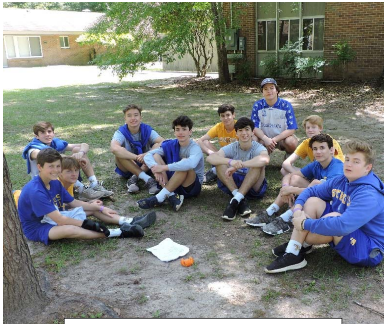
Freshmen cooperated with retreat last week.