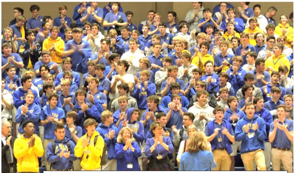
Students sing fight song following Wolves Semi-final basketball win!

Centennial Year: During 2018, we celebrate the 100 th anniversary of the Christian Brothers assuming ownership of Saint Paul's School in 1918, thus returning to the Archdiocese of New Orleans after an absence of many years. During 2018, we have a number of activities planned to celebrate this important milestone in our school's history – the bringing of the Lasallian dream to Covington, LA. The first – and biggest – event is the renovation of Benilde Hall (see above). More on these events later, but in addition to Benilde Hall, I am re-instating the Did You Know feature that I used for our Centennial Celebration of the school's founding during calendar year 2011. Enjoy these SPS tidbits!