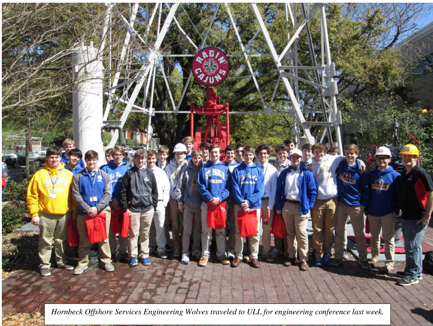
Hornbeck Offshore Services Engineering Wolves traveled to ULL for engineering conference last week.