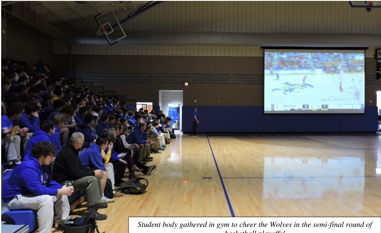
Student body gathered in gym to cheer the Wolves in the semi-final round of basketball playoffs!