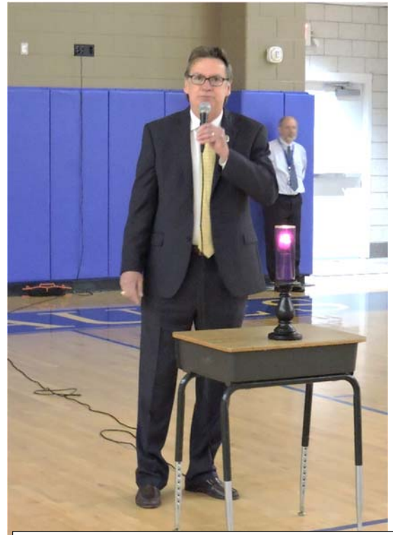
Covington Mayor Mike Cooper, a 1971 SPS alum, speaks to students about school safety.