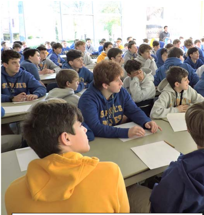
Pre-freshmen listen intently at scheduling assembly.