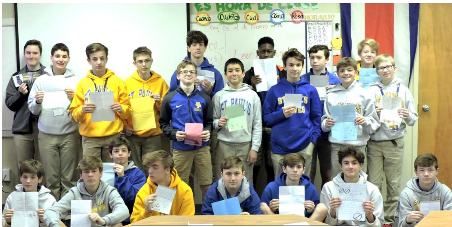
Spanish I class writes letters in Spanish to pen-pals.

Vaping: I'm sorry I have to mention this, but please speak to your son about the dangers involved in this latest fad. We continue to hear anecdotal reports of vaping by our students and have even taken disciplinary action against several of them who vaped at school events. We will continue to be vigilant and take strong measures against violators. Covington PD informs us that it is AGAINST THE LAW for minors to purchase vaping equipment. Make sure your son knows this – and complies with your wishes, school rules – and the law