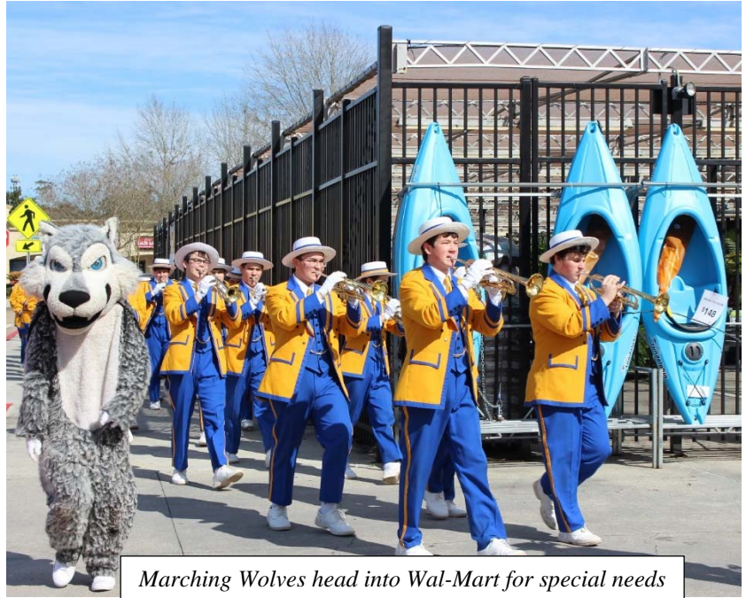
Marching Wolves head into Wal-Mart for special needs parade – always a special event.