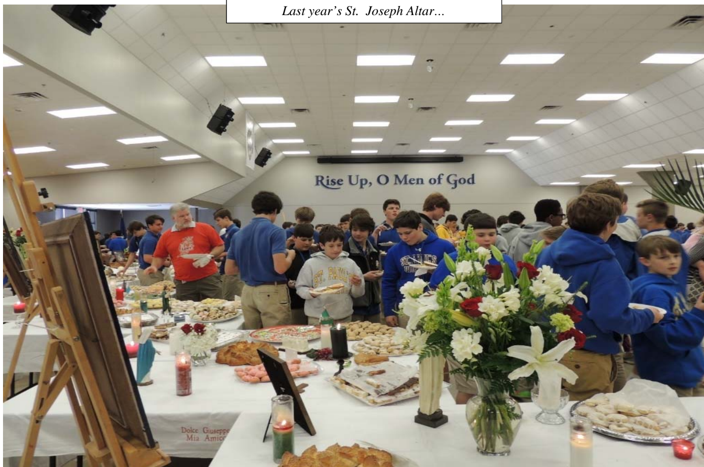
Last year's St. Joseph Altar...