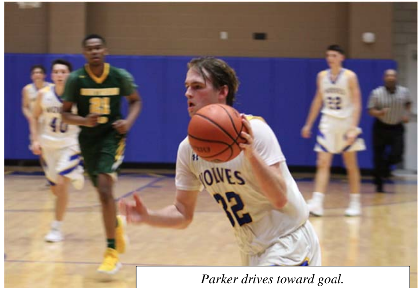
Parker drives toward goal.

Cash Back Programs: Please keep the following in mind when you shop: