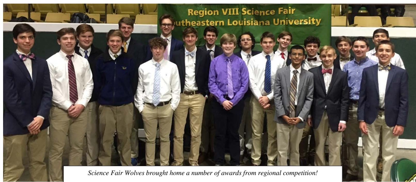
Science Fair Wolves brought home a number of awards from regional competition!

Yearbook: The 2017-2018 Confier is now available for purchase at www.yearbookforever.com for $65. The deadline to order is May 25, 2018 , and only a very limited number of extra books will be ordered. ALL Seniors will receive a yearbook and do not need to pre-order one, but Senior Ads must be placed by May 14, 2018 . This a great way for families to leave a lasting message for their sons. Go to www.yearbookforever.com to place your Senior Ad. Remember, you must spell out the word "Saint" in Saint Paul's School when ordering a book or placing an ad.