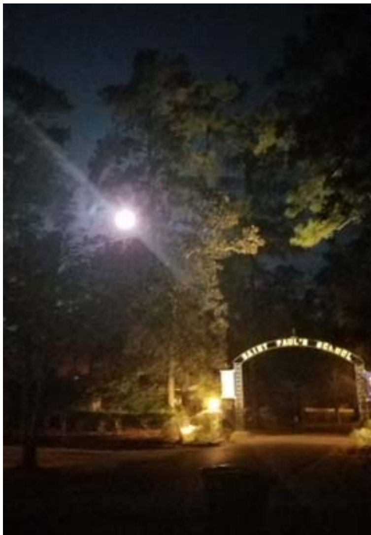
The super blue blood moon over the Arch last Tue AM!

Welcome to the final week before the Mardi Gras / Beginning of Lent Holidays! It is important to note that our week off next week is really for two reasons: Mardi Gras for two days and the beginning of Lent for three.