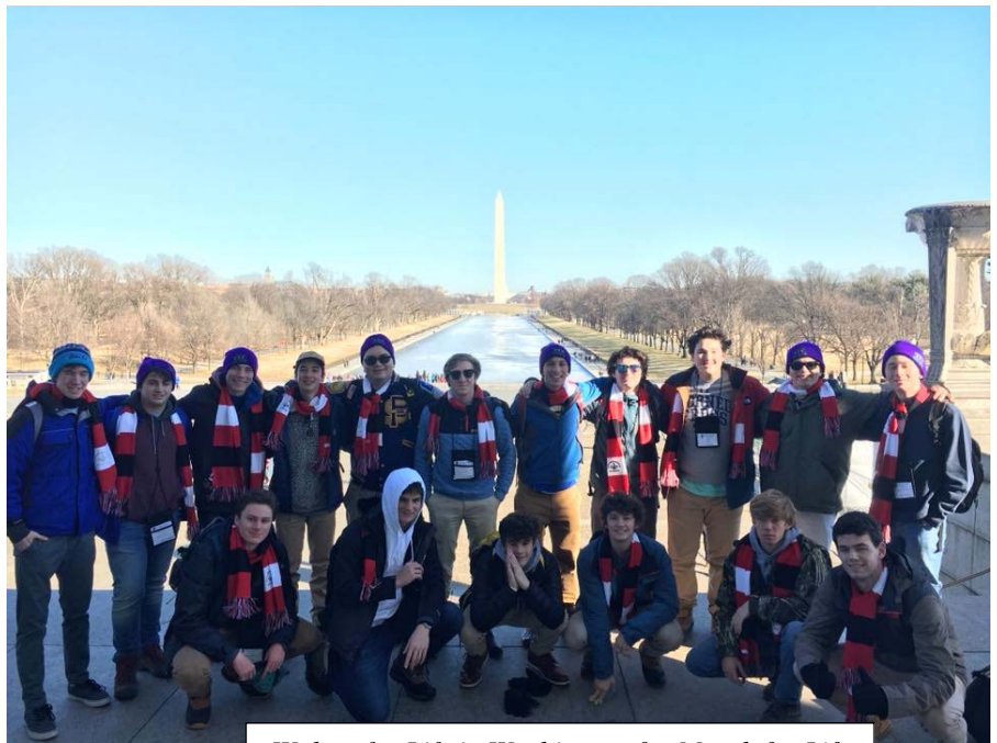
Wolves for Life in Washington for March for Life