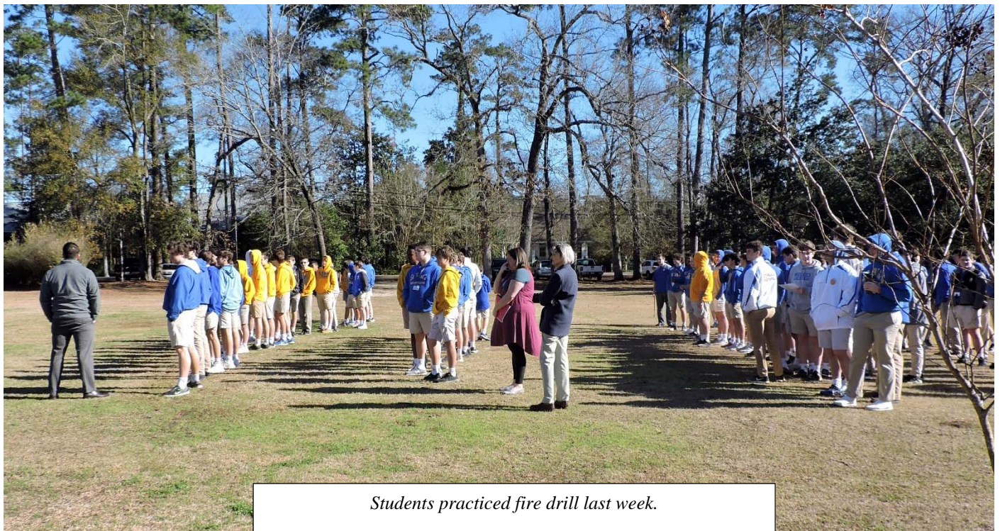
Students practiced fire drill last week.