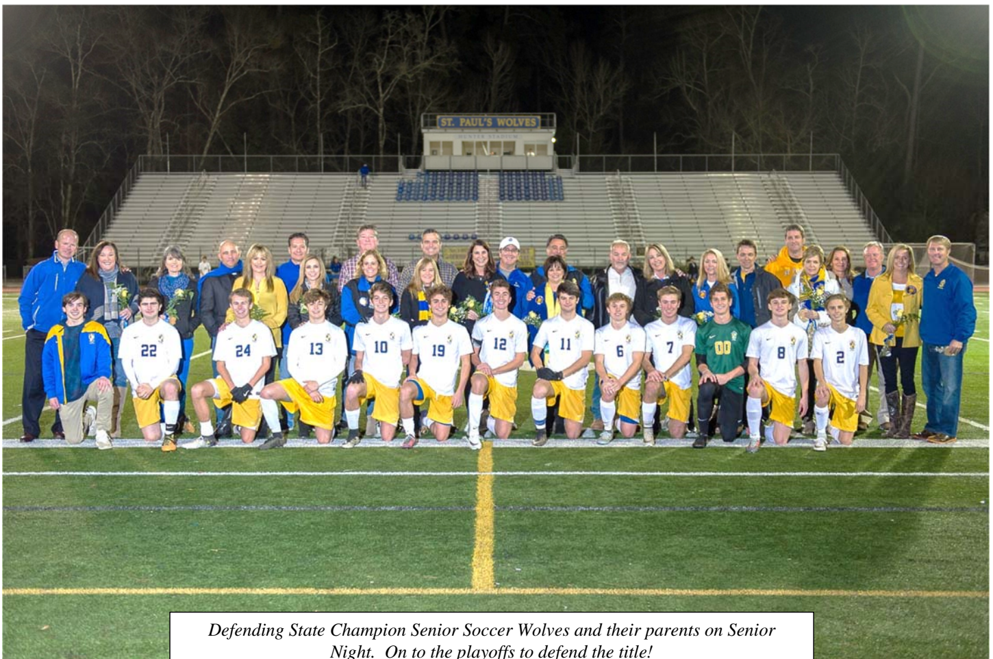
Defending State Champion Senior Soccer Wolves and their parents on Senior Night. On to the playoffs to defend the title!