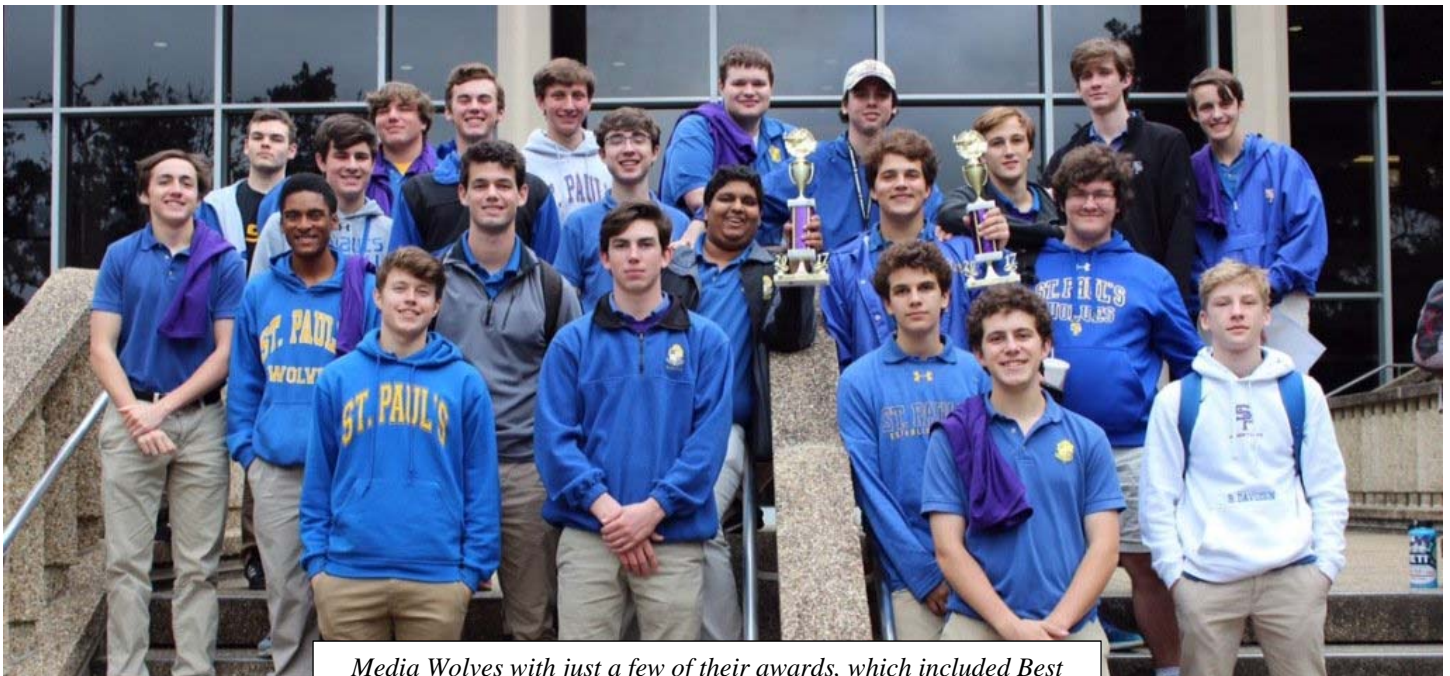
Media Wolves with just a few of their awards, which included Best School Newspaper in the State for 2 nd consecutive year!