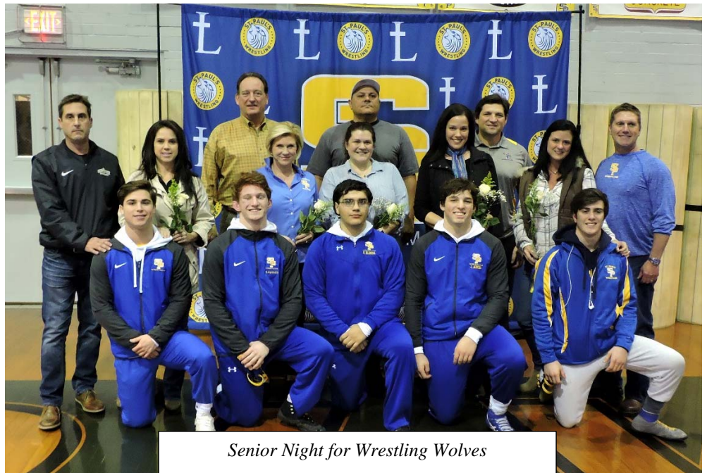
Senior Night for Wrestling Wolves