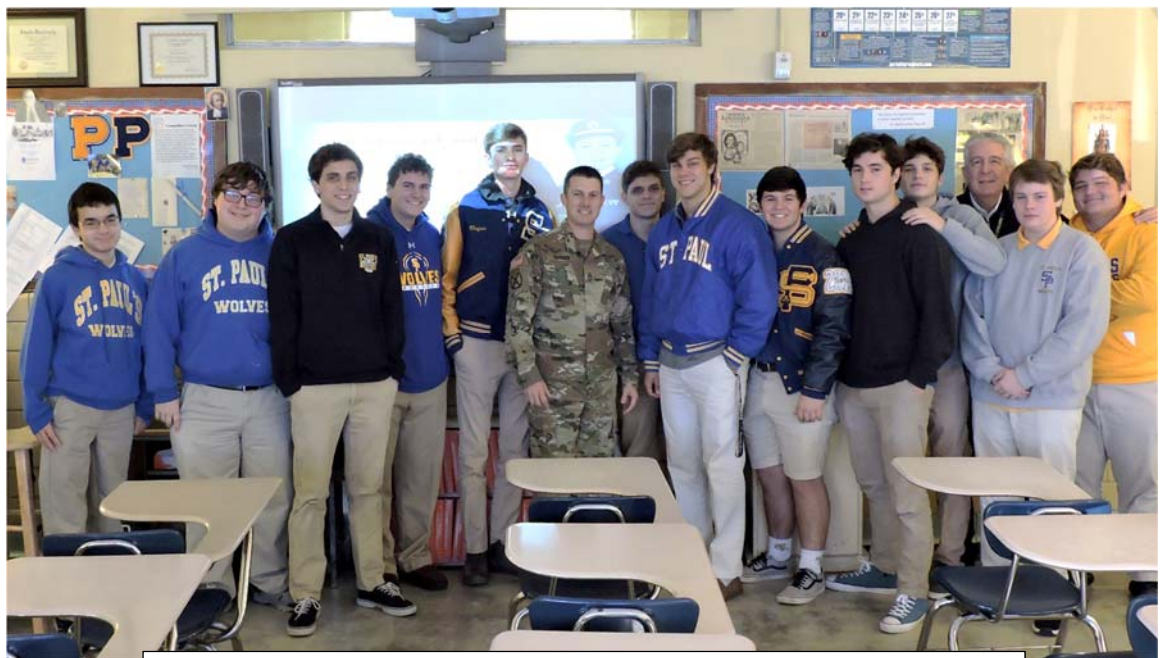
Senior Civics class welcomes a talk about National Guard opportunities.