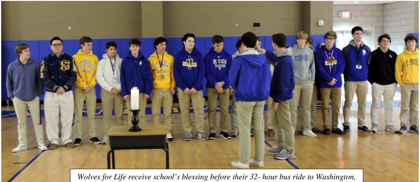
Wolves for Life receive school's blessing before their 32- hour bus ride to Washington, DC to participate in March for Life.

Whew! Enough for now. Even though it's a New Year, I will still close with a paraphrase of one of my favorite NPR radio shows (which I'm listening to now as I complete the newsletter and LOLing): well, it's happened again – you've squandered perfectly good time reading my ramblings! Know of my prayer for you and your family, especially as we begin the New Year! Again, thanks for being part of the 2017 - 18 edition of Saint Paul's! Happy New Year!