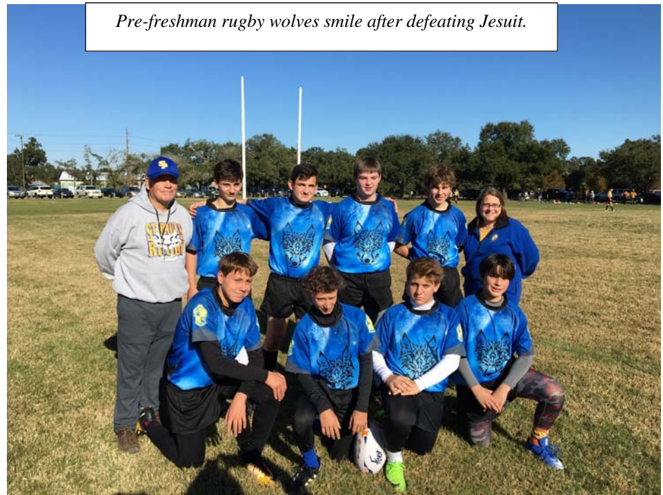
Pre-freshman rugby wolves smile after defeating Jesuit.