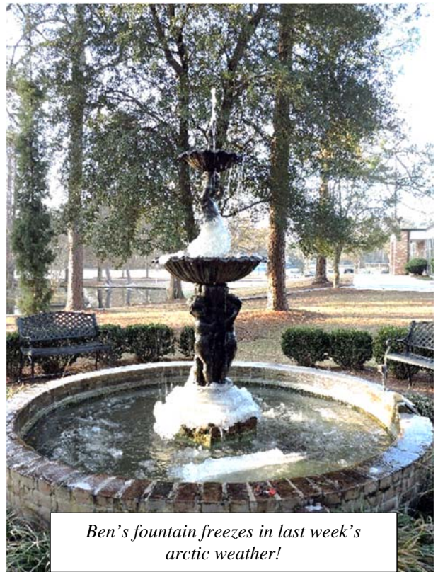
Ben's fountain freezes in last week's arctic weather!