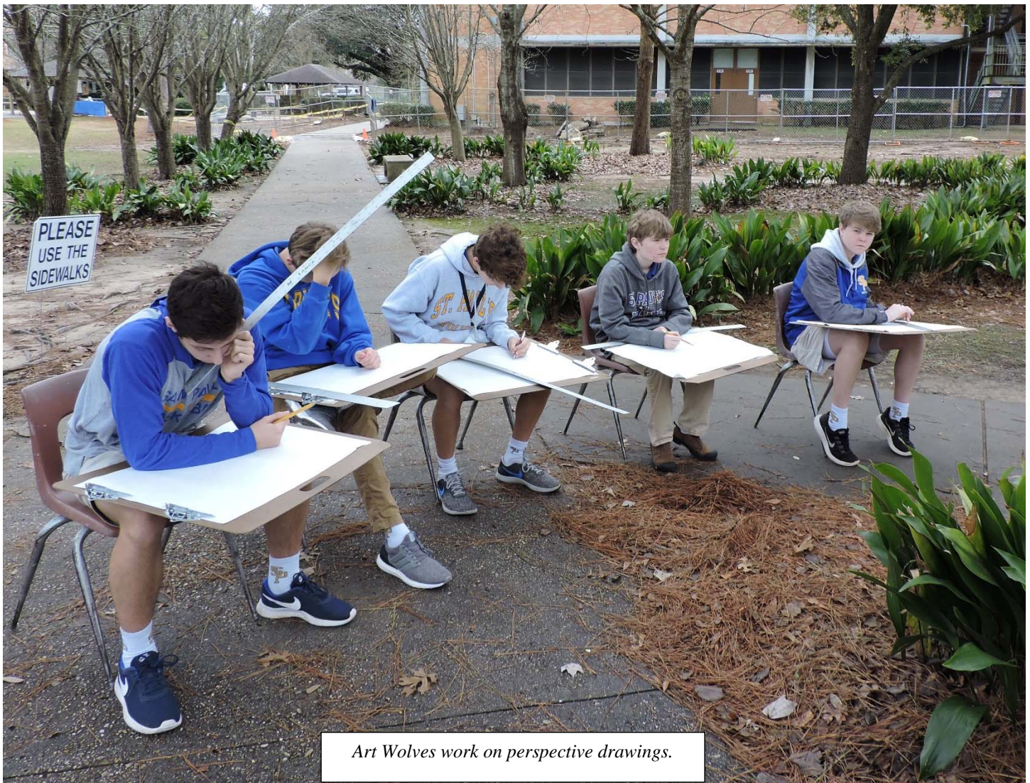
Art Wolves work on perspective drawings.

Phones: Please stress with your sons the need to follow school phone rules. Students must turn OFF phones in class and may only use them outside (between classes or at lunch.) A $10 fine is assessed for violating the rule – which, unfortunately, is happening way too frequently.