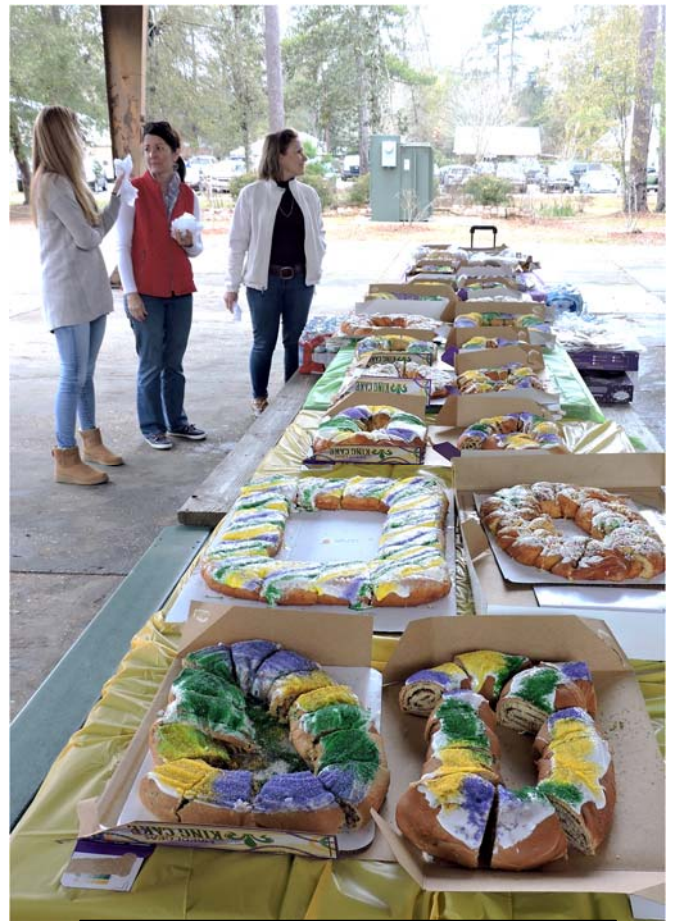
Moms calmly wait before the king cake storm.

Vaping: I'm sorry I have to mention this, but please speak to your son about the dangers involved in this latest fad. We are hearing anecdotal reports of vaping by our students and have even taken disciplinary action against several of them who vaped at school events. We will continue to be vigilant and take strong measures against violators. At last month's regular meeting with the Covington Police Department, we were informed that it is AGAINST THE LAW for minors to purchase vaping equipment. Please make sure your son knows this – and complies with your wishes, the rules of the school – and the law.