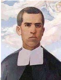
St. Brother Jaime

• TDIH: In 1937, Brother Jaime Hilario was martyred by Spanish revolutionaries in the Spanish Civil War. From the Christian Brothers Website: Born in 1898 in northern Spain, Jaime was only 12 years old when, with the blessing of his parents, he entered the minor seminary. He soon developed hearing problems and was advised to return home. Convinced that God was calling him, he was overjoyed in 1917 to learn that the Institute of the Brothers would accept him. After sixteen years in various teaching assignments, his hearing problems forced him to abandon the classroom to work in the garden at one of the schools. In July of 1936 he was on his way to visit his family when the civil war broke out. Recognized as a Brother, he was arrested and jailed. In December he was transferred to Tarragona and confined in a prison ship with several other brothers. On 15 January 1937 he was given a summary trial. Though he could have been freed by claiming to be only a gardener, he insisted on his identity as a religious and thereby sealed his doom. He was brought to the cemetery known as the Mount of Olives on 18 January to face execution. His last words to his assailants were "To die for Christ, my young friends, is to live." When two volleys failed to meet their mark, the soldiers dropped their rifles and fled in panic. The commander, shouting a gross insult, fired five shots at close range and the victim fell at his feet. He was canonized in 1999 by Pope John Paul II.