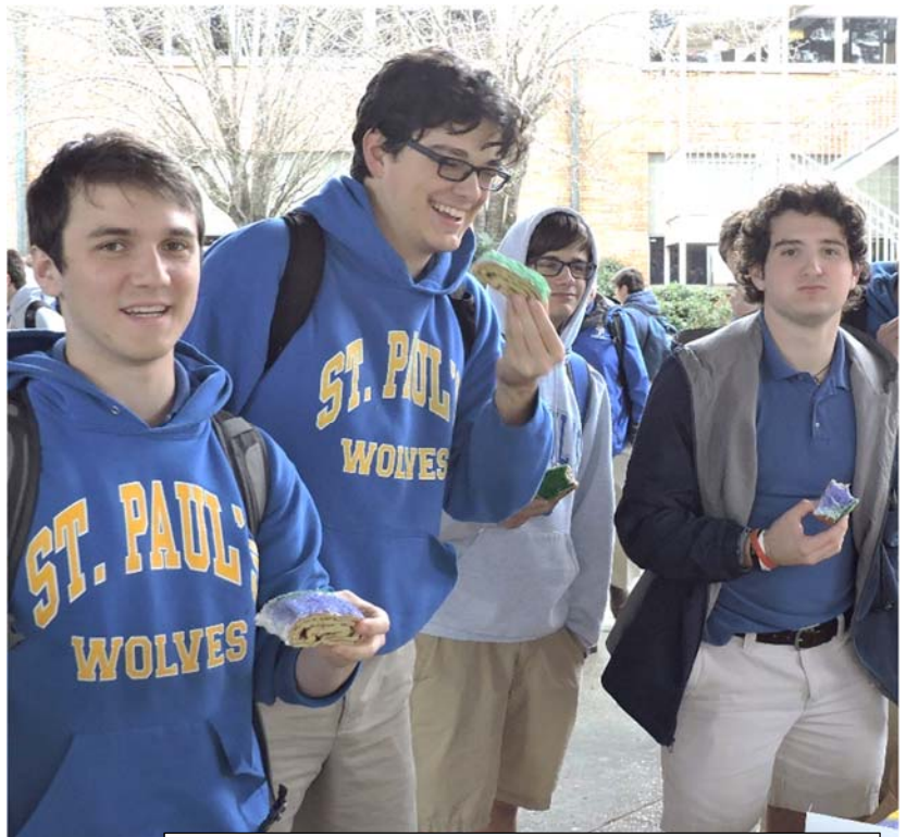
Seniors enjoyed king cake last week. Thanks, Mothers Club!