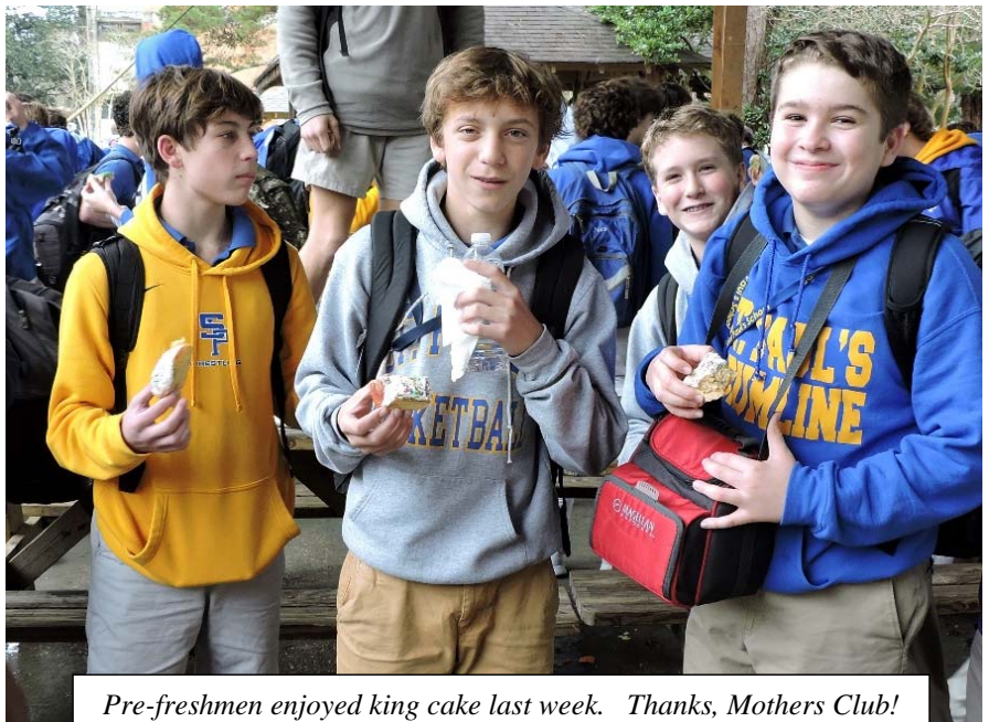
Pre-freshmen enjoyed king cake last week. Thanks, Mothers Club!