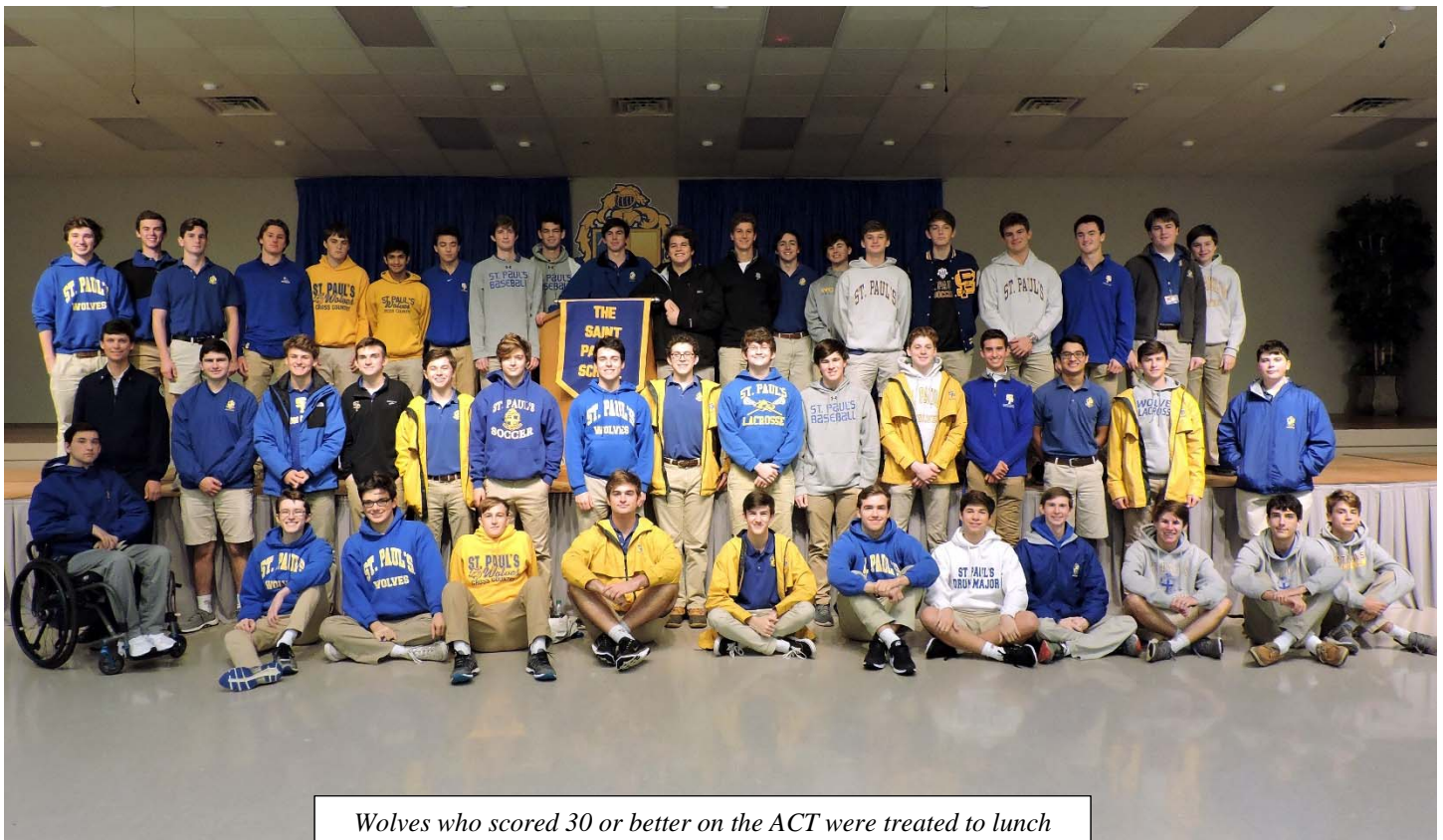
Wolves who scored 30 or better on the ACT were treated to lunch last week! Well done, Wolves!

Whew! I've worn you out again this week! But the newsletter goes on Christmas vacation so you get a break for the next two Sundays! The next newsletter will appear on Sunday, Dec 31.