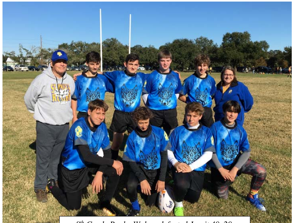
8 th Grade Rugby Wolves defeated Jesuit 40, 20. Geaux Rugby Wolves!