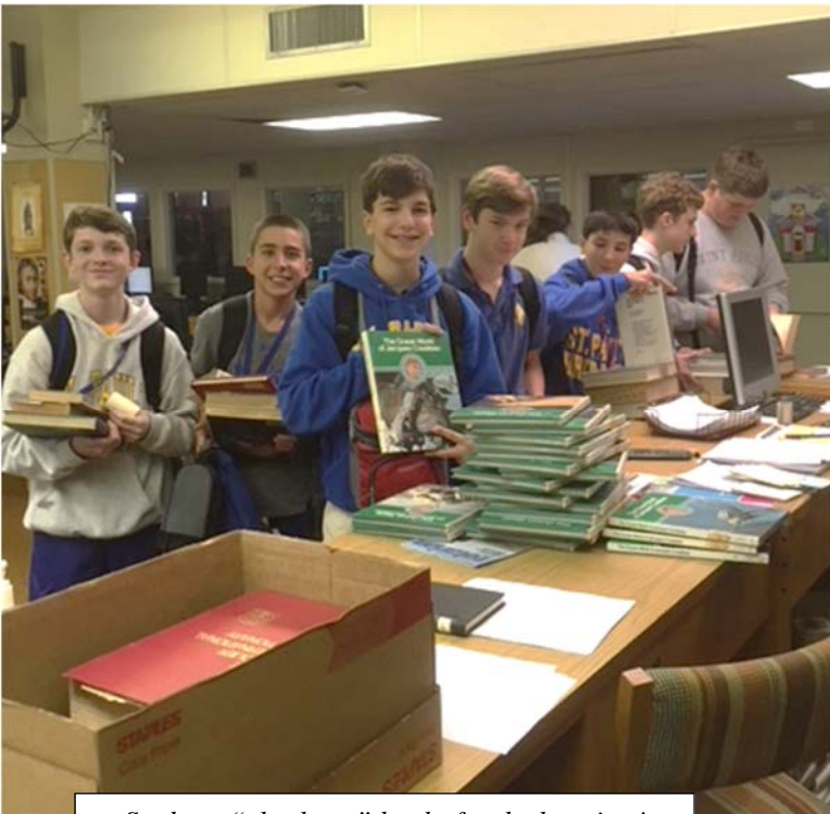
Students "check out" books for the last time!

ACT Scores: If you read the latest issue of Wolftracks (and I hope you did!), you could not help but be impressed at the 20 students who scored a perfect 36 on one of the subsections of the ACT over the past six months. Wow. What an accomplishment. Congratulate them when you see them! And the latest ACT test brought even more perfect 36 scores! We will be publishing a complete list soon. In the meantime, know that we take ACT prep seriously at SPS.