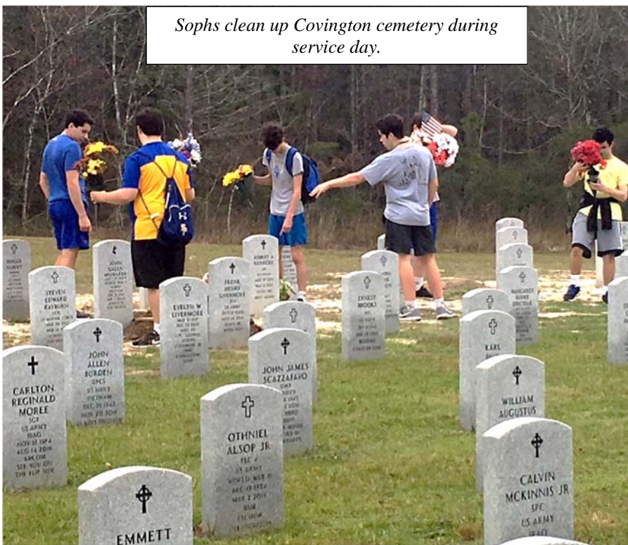
Sophs clean up Covington cemetery during service day.