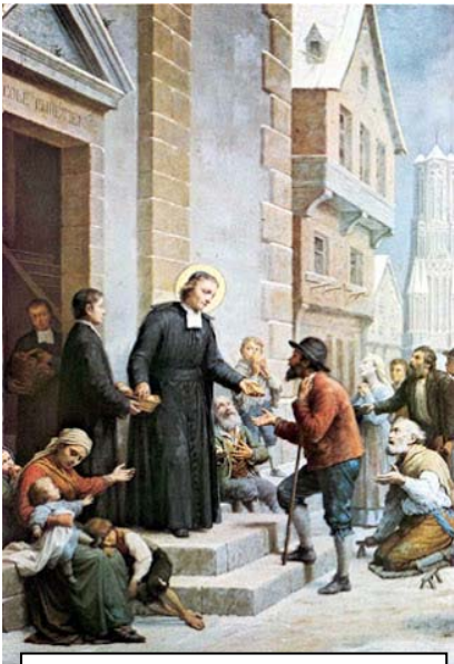
St. La Salle distributes bread to the poor of his day.

One of those authentically Lasallian Catholic values – as espoused by Pope Francis and enshrined as one of the seven social justice issues by the US Catholic Conference of Bishops – is concern for the poor, which is also one of our five Lasallian core principles.