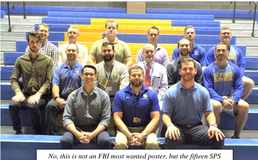
No, this is not an FBI most wanted poster, but the fifteen SPS alumni who currently serve on our faculty and staff.