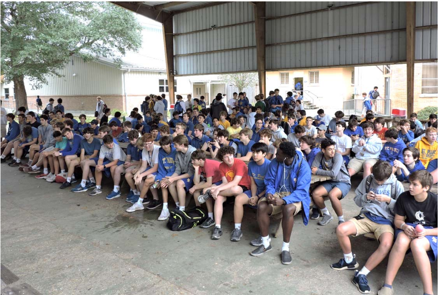
Sophomores wait patiently for lunch following their morning of service.