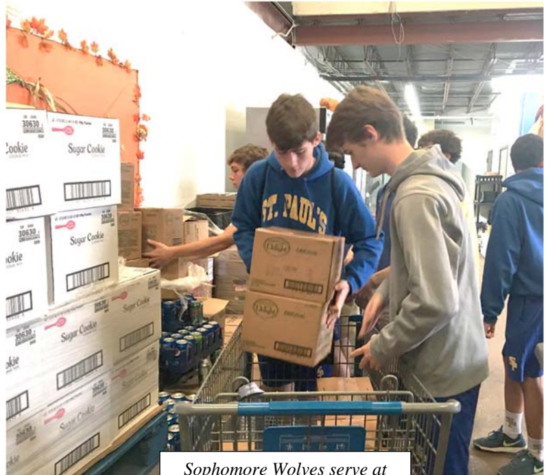
Sophomore Wolves serve at Northshore Food Bank