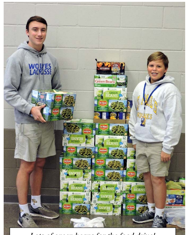
Lots of green beans for the food drive!