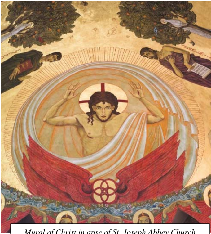
Mural of Christ in apse of St. Joseph Abbey Church

Christus Vincit! Christus Regnat! Christus Imperat! Christ conquers! Christ reigns! Christ commands!