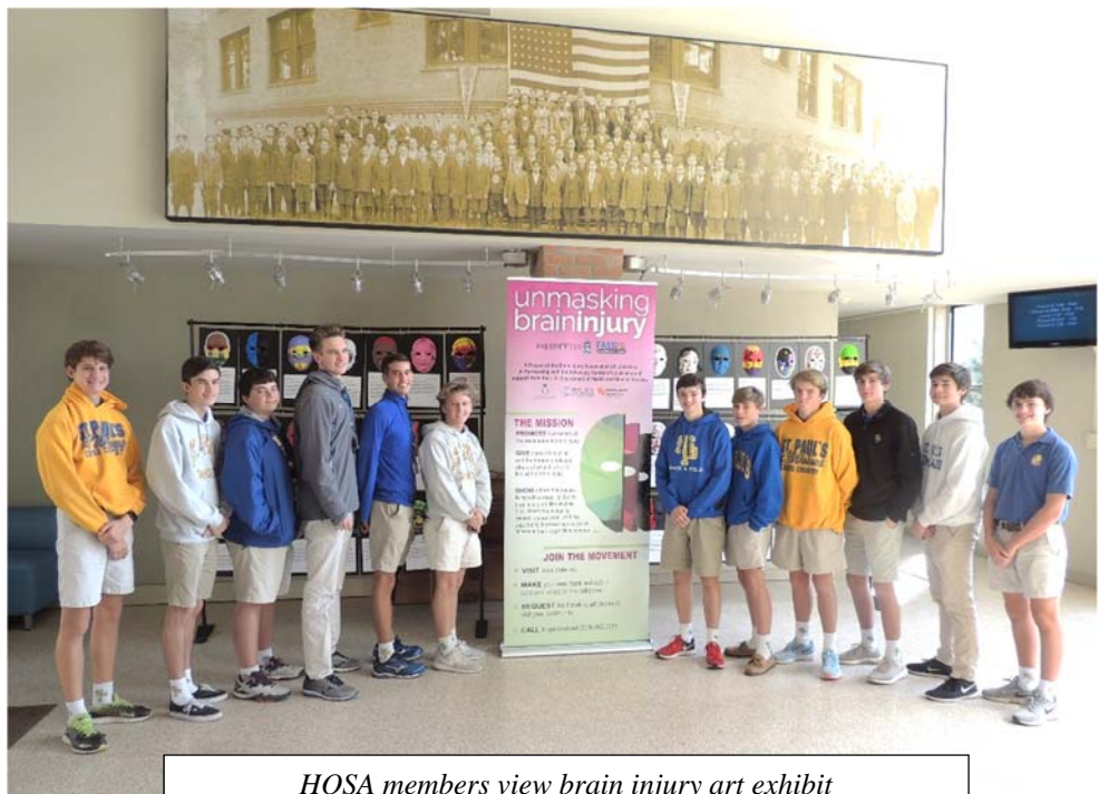
HOSA members view brain injury art exhibit