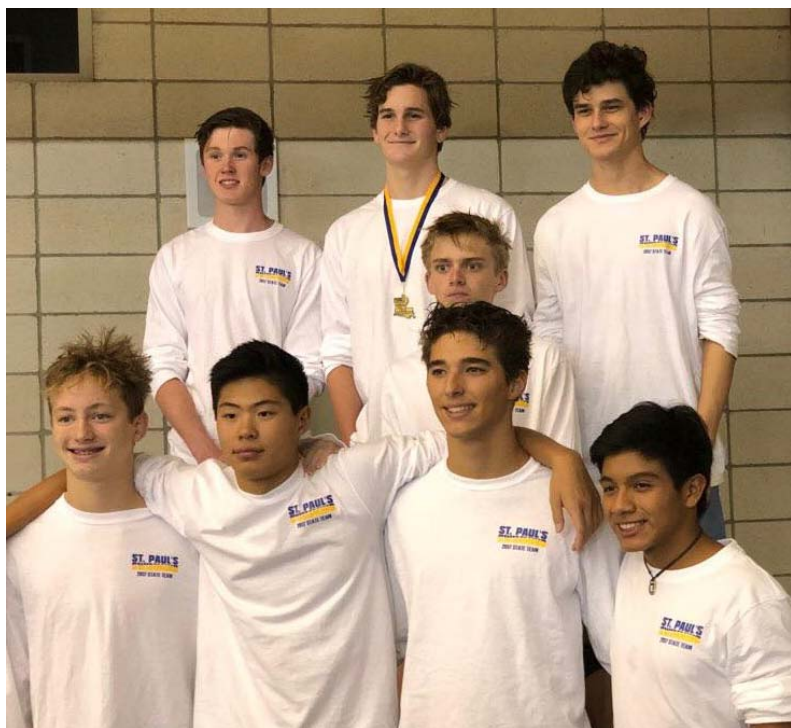
Aqua Wolves placed 4 th in State!