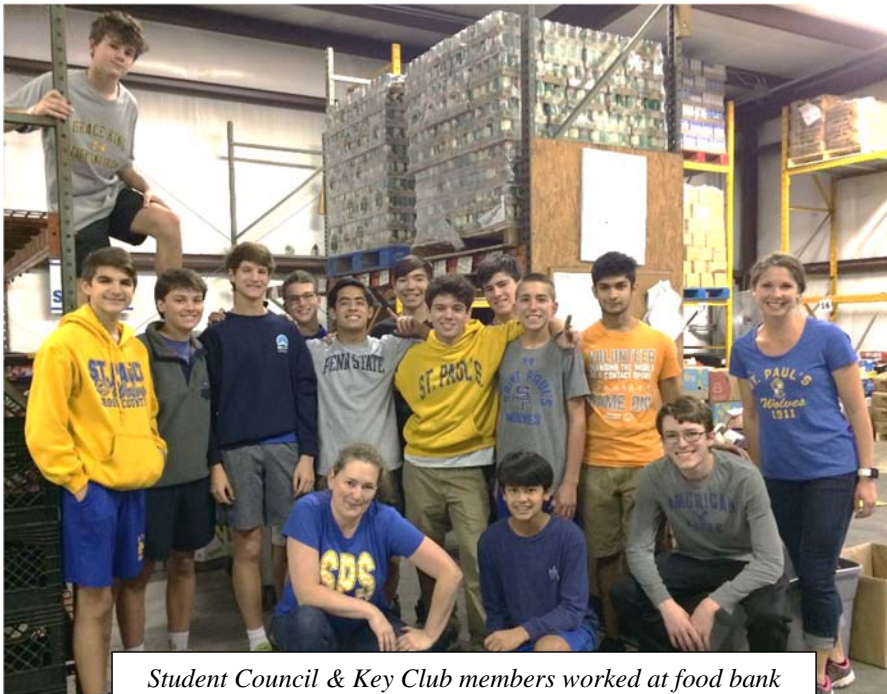
Student Council & Key Club members worked at food bank on Nov 21 sorting our almost 13,000 lbs of donated goods. Well done!

After School Issues: Assignment Hall and detention are in full operation. Parents, please stress with your sons the need to do homework and follow rules. And if your son does end up in AH or detention, please establish a procedure for him to follow so that you are not wandering around looking for him. We tell the AH student to call their parents. We'll provide a phone if needed.