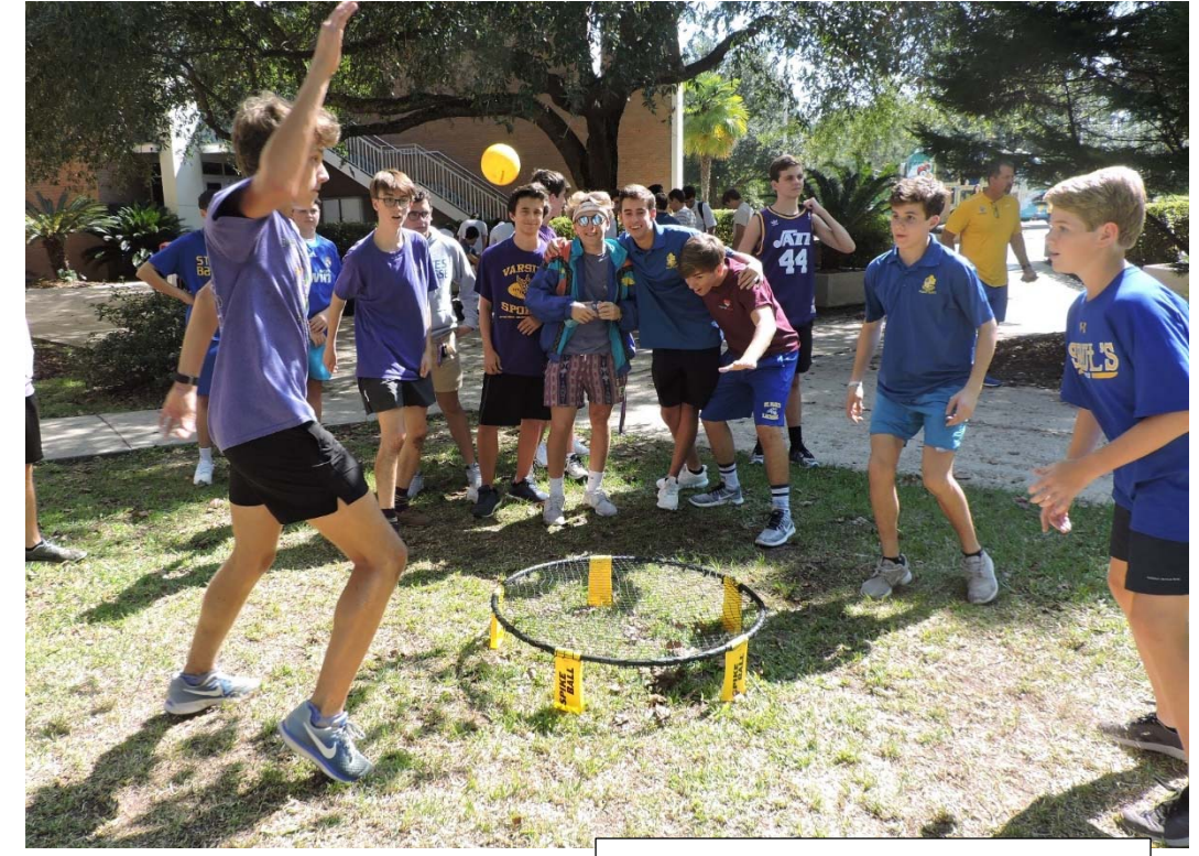
Wolves enjoy games on Field Day