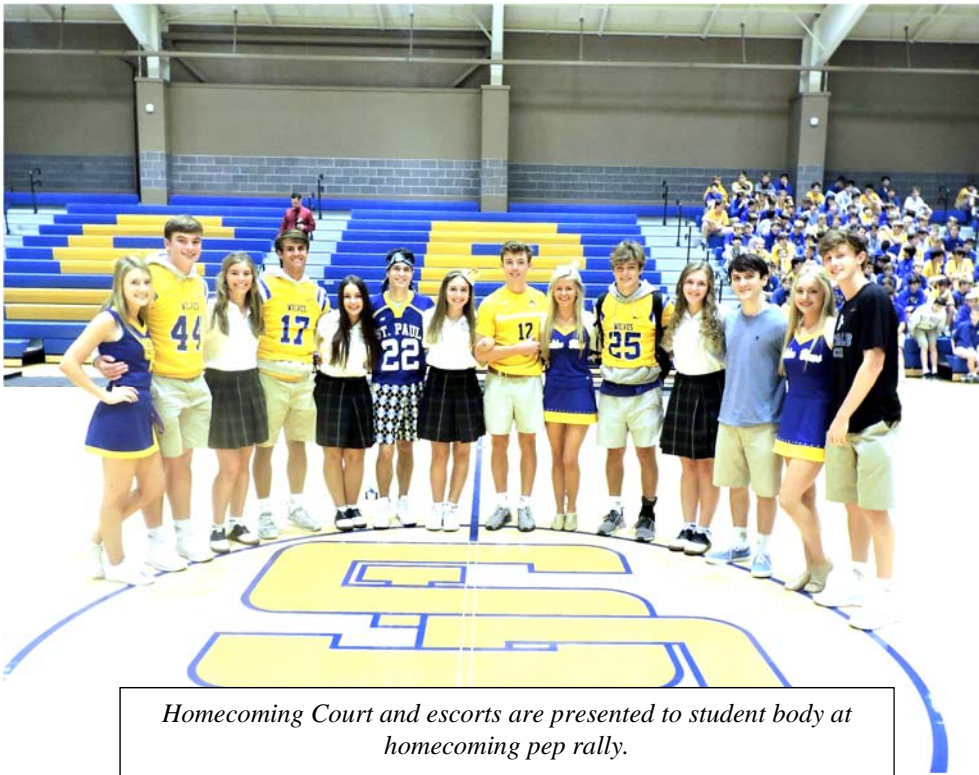
Homecoming Court and escorts are presented to student body at homecoming pep rally.