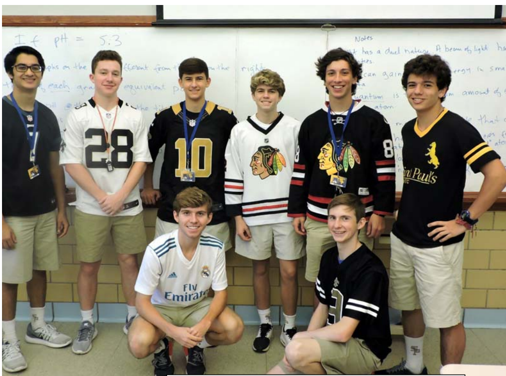
Juniors get homecoming spirit by celebrating Jersey Day

Moms for Mums: The Mothers' Club will again sponsor this wonderful event. The event honors the moms' sons while simultaneously beautifying the campus in anticipation of our many guests who will tour the campus during Open House. It's time to save the date. October 28th is the date for Open House so we will collect them starting on the October 19 - 27. This is always a special sight to see the campus festooned (love that word!) with mums. Thanks, Moms!