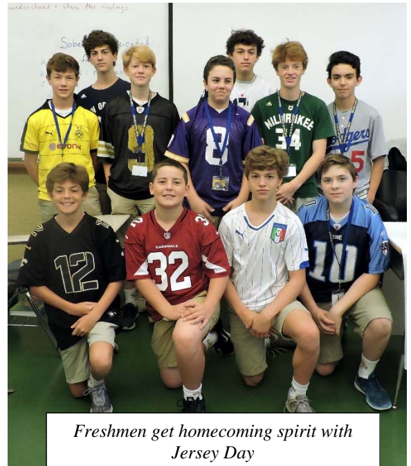
Freshmen get homecoming spirit with Jersey Day