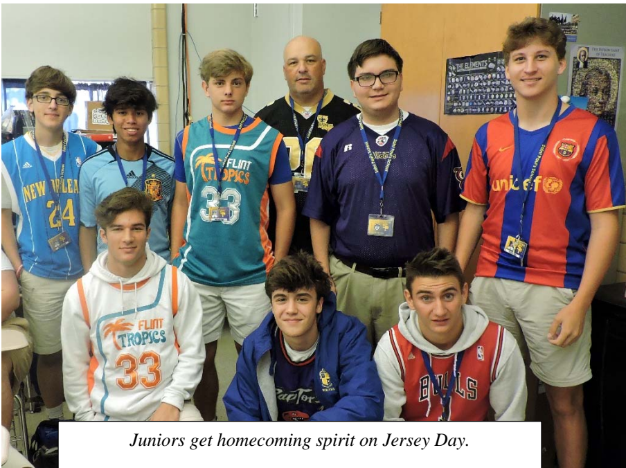
Juniors get homecoming spirit on Jersey Day.