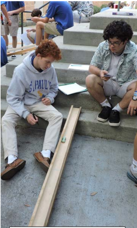
Seniors learn physics – and have fun, too.