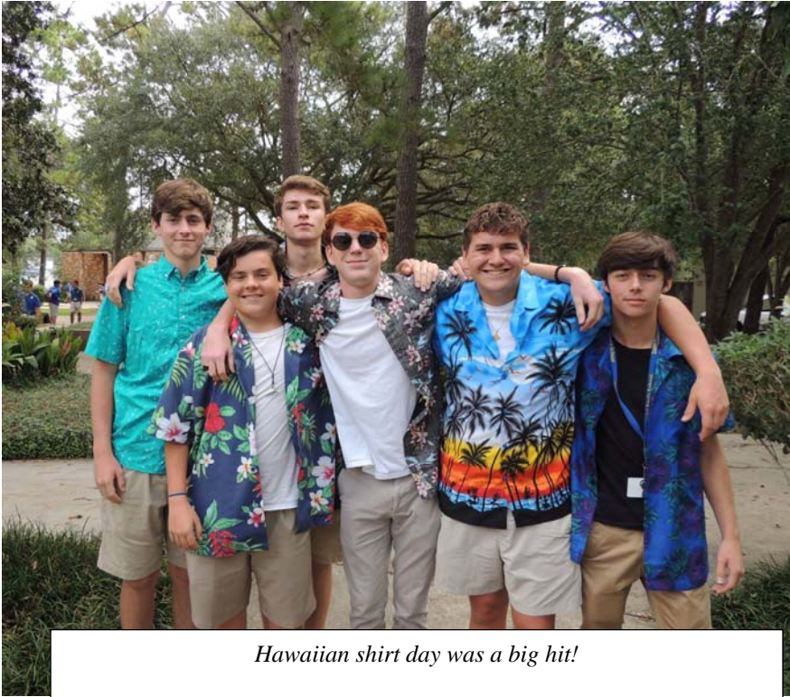
Hawaiian shirt day was a big hit!

encourage your son where possible to support: