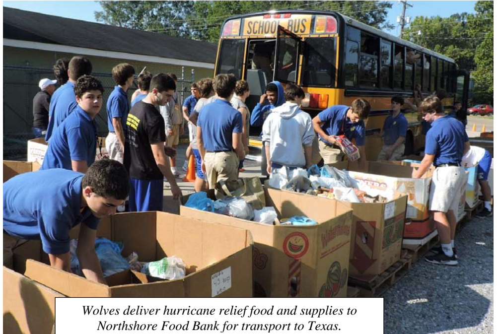
Wolves deliver hurricane relief food and supplies to Northshore Food Bank for transport to Texas.