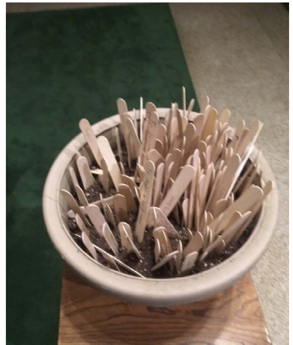
Craft sticks containing prayers of our freshmen