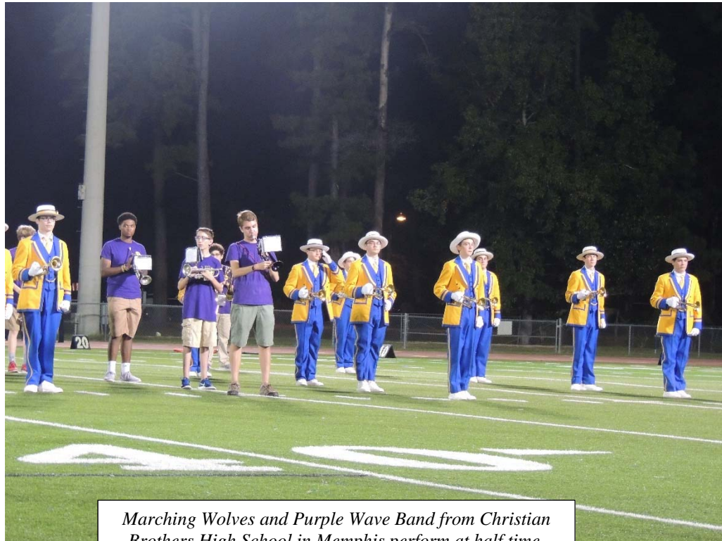
Marching Wolves and Purple Wave Band from Christian Brothers High School in Memphis perform at half time.