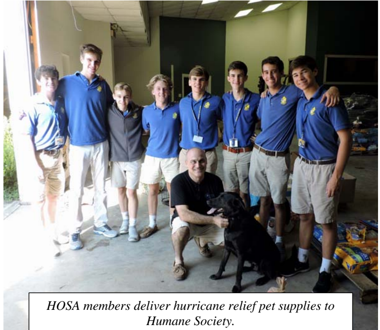
HOSA members deliver hurricane relief pet supplies to Humane Society.