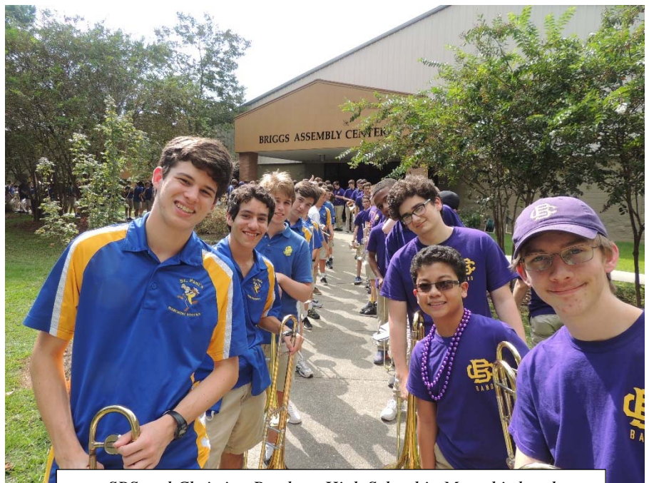
SPS and Christian Brothers High School in Memphis band members prepare to enter stadium.