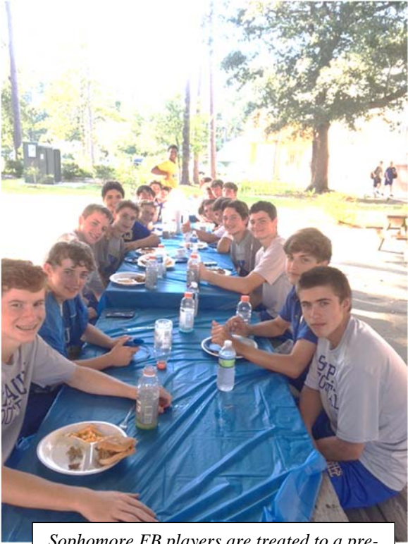
Sophomore FB players are treated to a pre-game meal by their moms.

Attendance: Please comply with our attendance regulations as printed in the handbook that is posted on our website. This is especially true when a student is absent or needs to check out during the day. Here's the link to our handbook: