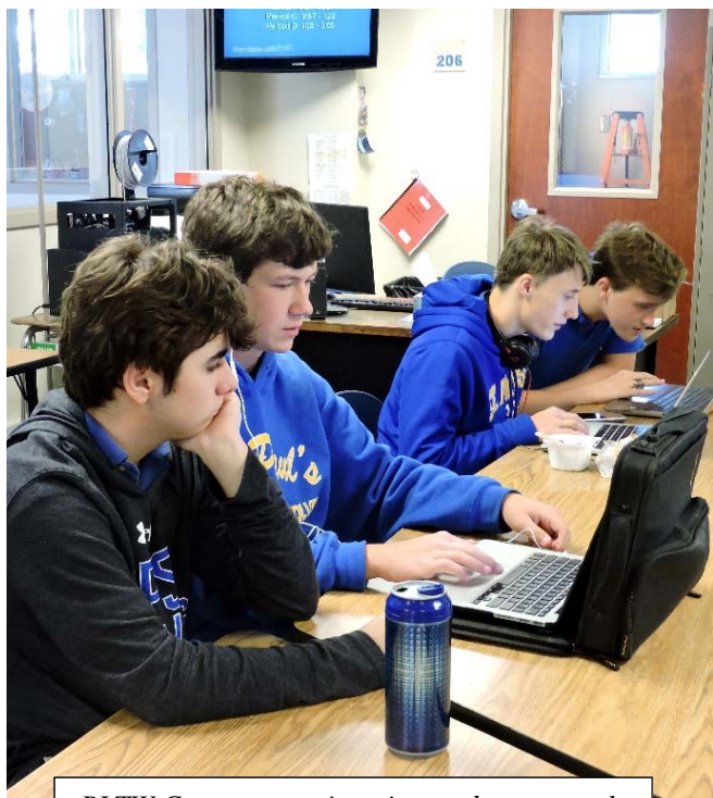
PLTW Computer engineering students at work.

Attendance: Please comply with our attendance regulations as printed in the handbook which is posted on our website. This is especially true when a student is absent or needs to check out during the day. Here's the link to our handbook: https://www.stpauls.com/student-life/student-parent-handbook1-pdf/