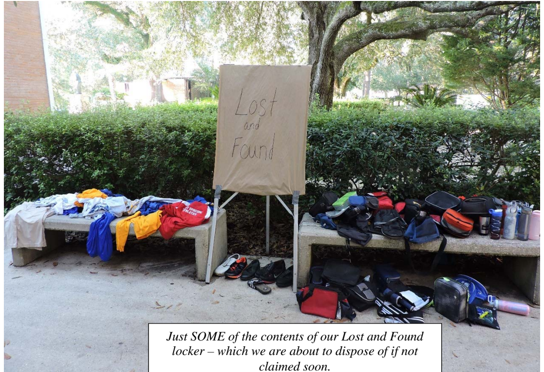
Just SOME of the contents of our Lost and Found locker – which we are about to dispose of if not claimed soon.

14 – Exams 15 – Exams 18 – Exams 19 – Exams – Christmas (not winter) holidays begin following second exam (approx. 11:15)