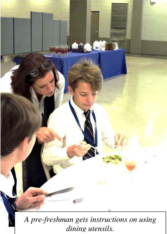
A pre-freshman gets instructions on using dining utensils.

Memphis, dating back to 1871. Just like the persecution in France and Mexico led the Brothers to Covington, the great Chicago fire of 1871 destroyed several of the Brothers' schools in that city, leading four Brothers to re-locate to Memphis and open a school. Today, CBHS is a modern, school of first choice for 880 students in grades 9-12. We welcome our Lasallian brothers to SPS. May our common heritage provide great competition and even greater sportsmanship. And the answer to your question is "Yes, we will be traveling to Memphis next year."