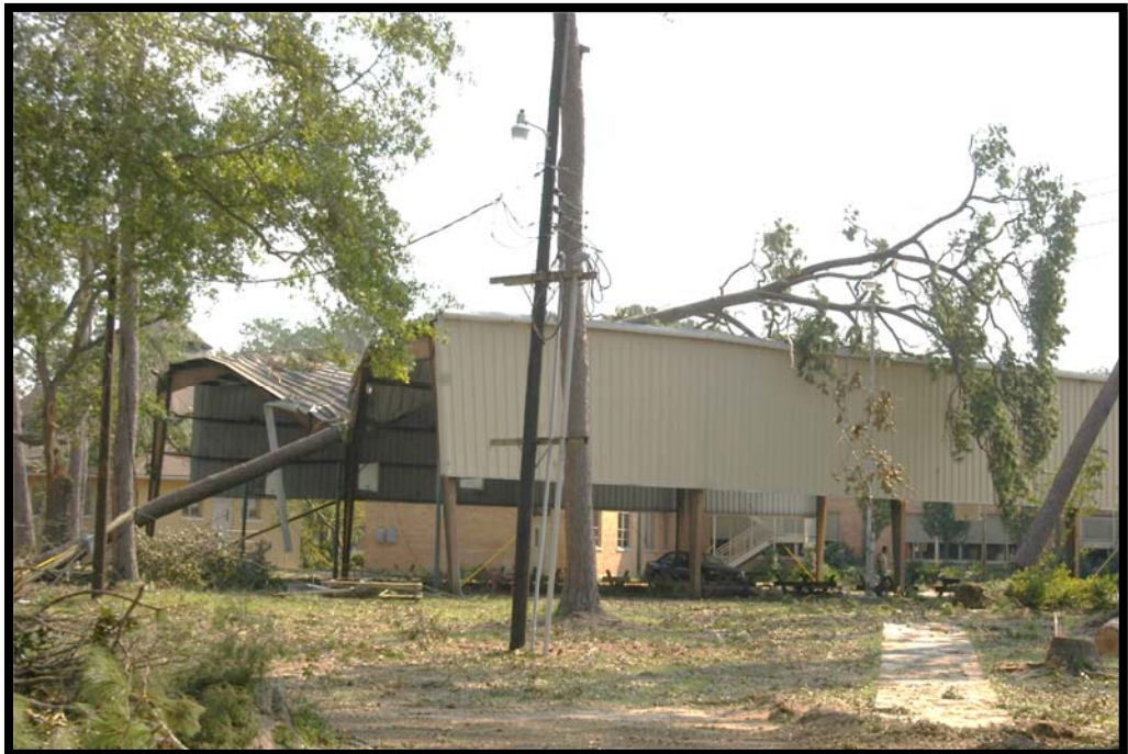
Our campus 12 years ago Tuesday...