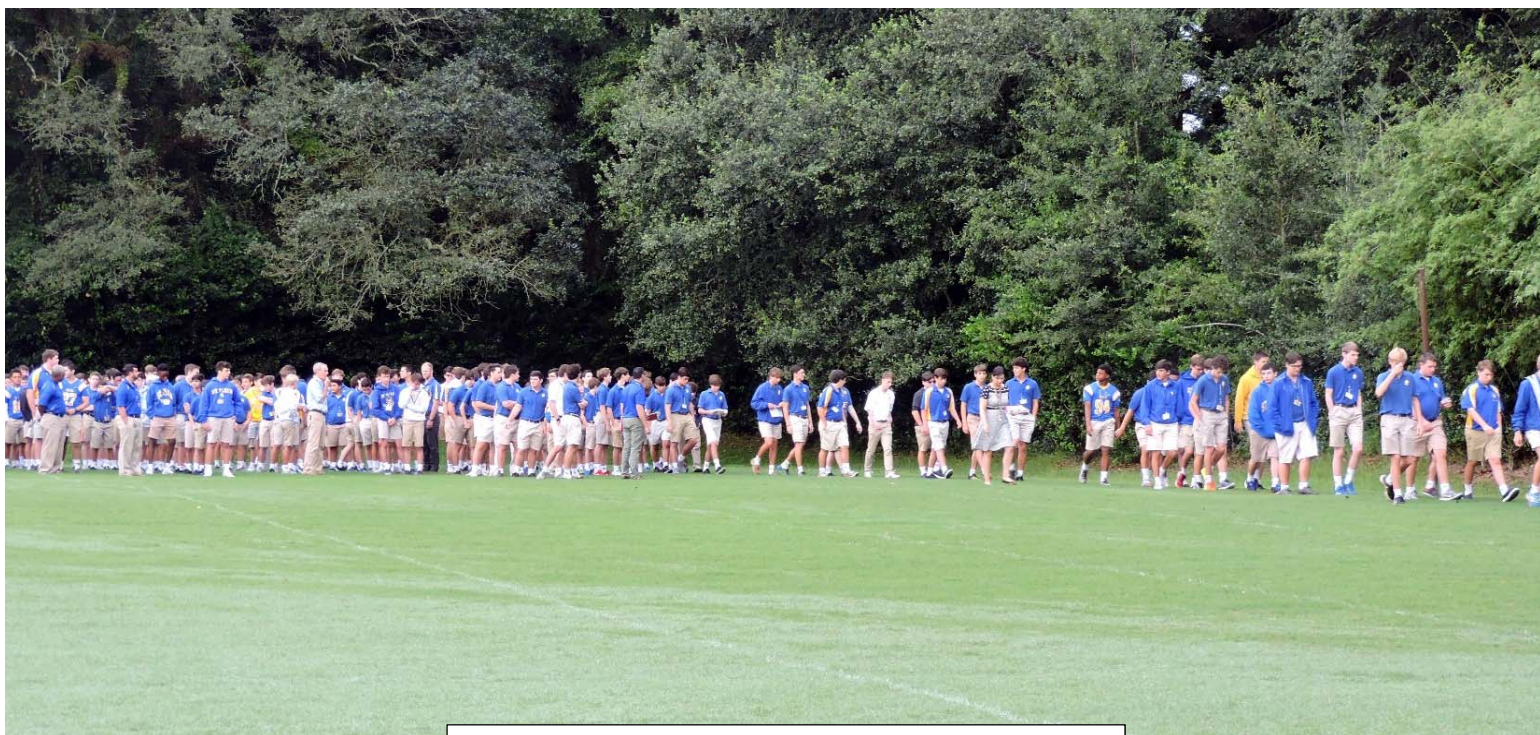
Students practice evacuation drill.

Whew! That's enough for now! I'm sure I've forgotten something so email me if you still have a question about the opening of school.