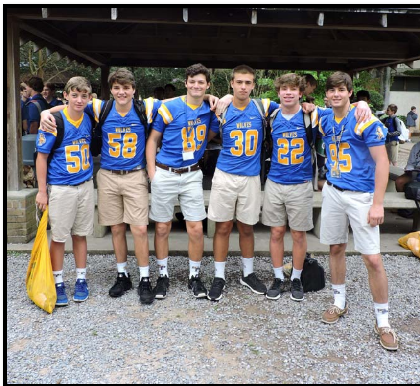
Sophomore FB players await the Jamboree.

Homecoming Dances: Student Council is pleased to announce the dates for the Homecoming dances