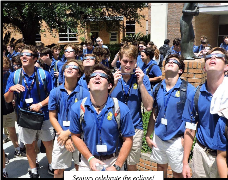
Seniors celebrate the eclipse!