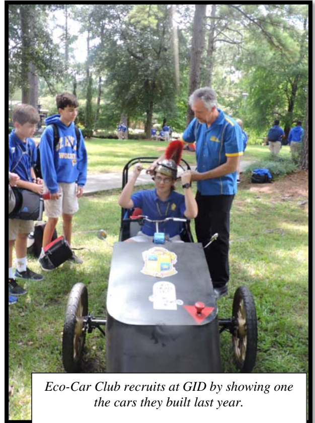
Eco-Car Club recruits at GID by showing one the cars they built last year.