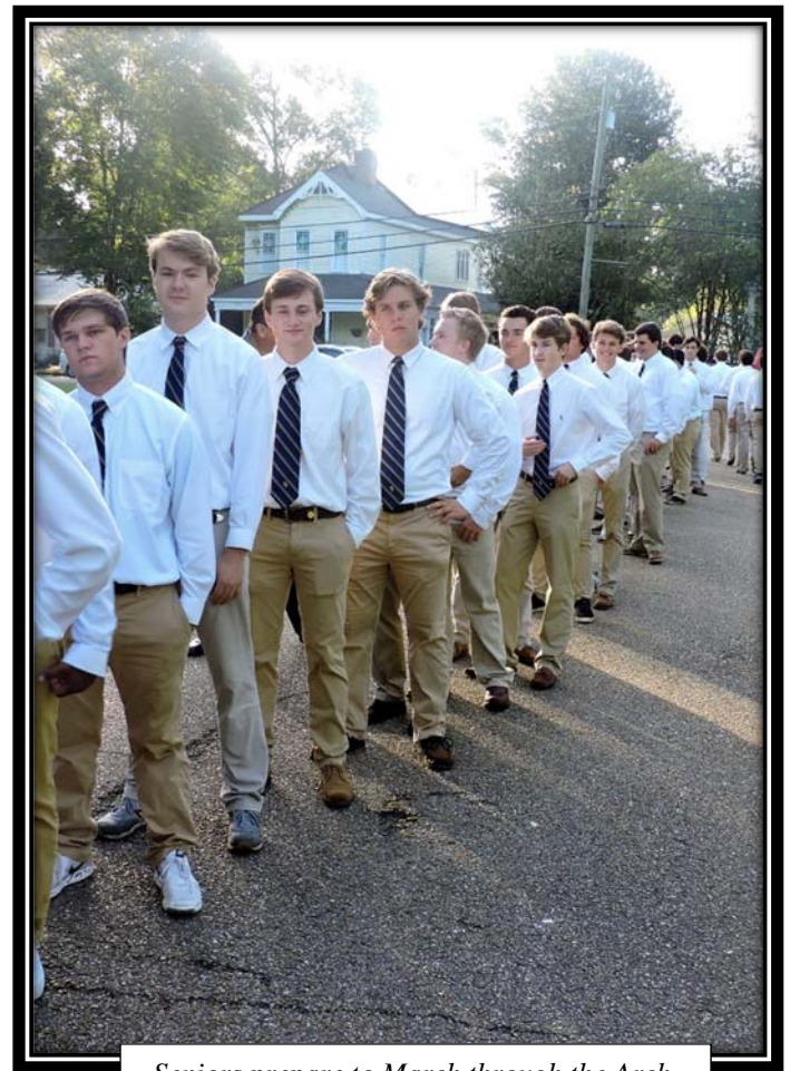
Seniors prepare to March through the Arch, symbolically re-enacting the beginning of Saint Paul's, as they take their places in our 106 year old tradition.

I could go on with many more such quotations, but I think you get the flavor of our together. SPS is indeed transforming lives –which Lasallian education has been doing since 1680. God bless the Class of 2018! I'm incredibly proud to be their school president – and the Classes of 2019, 2020, 2021 & 2022! And, of course, you, too!