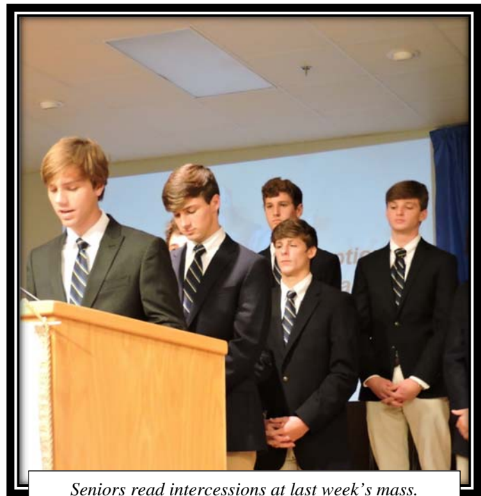
Seniors read intercessions at last week's mass.

Q: Why did the banana go to the hospital? Because it wasn't peeling very well