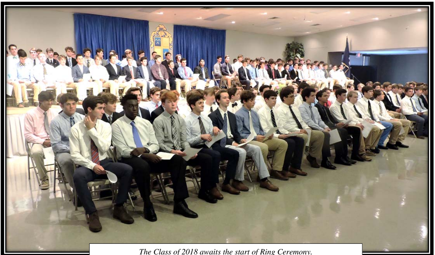
The Class of 2018 awaits the start of Ring Ceremony.