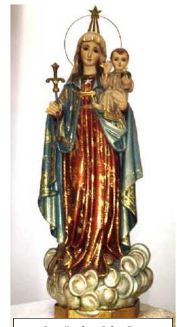
Our Lady of the Star Statue in Brother's Motherhouse in Rome

the Monastery and Sanctuary acts as the custodian of this ancient Marian shrine. A number of Brothers of the Christian Schools are individual members of this association.