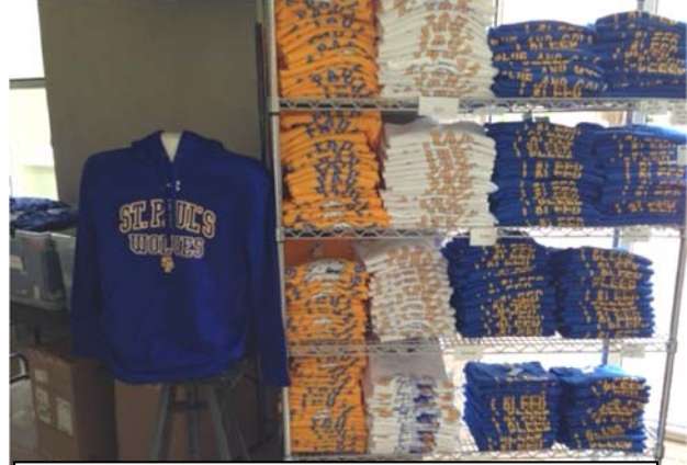
Mothers Club Bookstore shelves are well-stocked and ready for sale this week. Thanks, MC!

Football: Calling all 8th graders interested in playing football for the Wolves! Come sign up for 8th grade football on Tuesday, August 1 at 6pm in the new gym. Information will be given regarding the upcoming season, practices, games, etc. You will also have a chance to meet the coaches. You are also invited to come out early and watch the end of Varsity practice prior to the meeting.