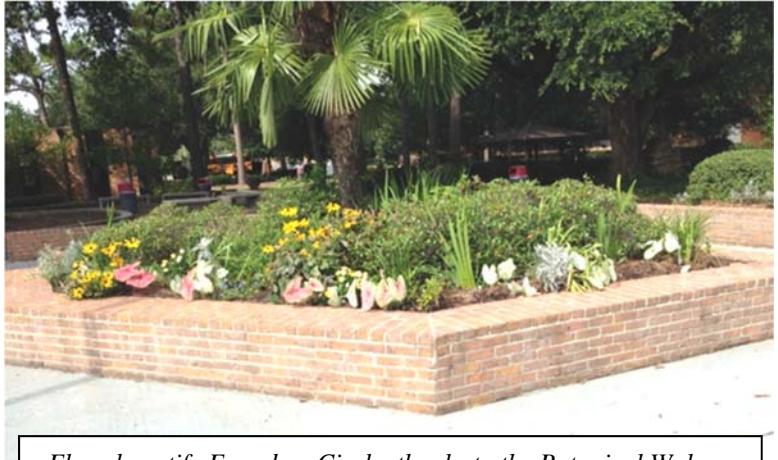
Flora beautify Founders Circle, thanks to the Botanical Wolves.