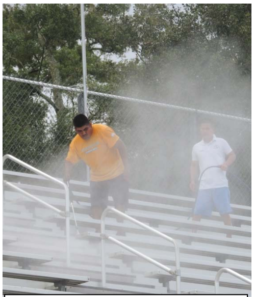
SPS Maintenance Crew power washes stadium to prepare for 2017 season.

• Feast of the Transfiguration: In a resplendent cloud, the Holy Spirit appeared. The Father's voice was heard: This is my beloved Son, with whom I am well pleased. Listen to him. May we listen to the Lord on this first day of school – and every day throughout the new school year!