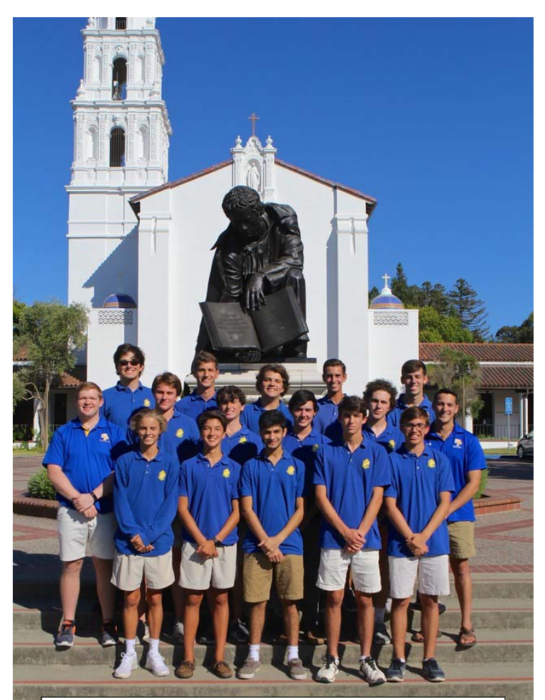
14 Lasallian Student Leaders and Two Chaperones spent a week on campus of St. Mary's College in Moraga, CA where they interacted with over 200 students from 15 Lasallian high schools.

Dress Code: Students must comply with the dress code beginning Aug 7. WE INTEND TO INCREASE OUR ENFORCEMENT OF THE DRESS CODE THIS YEAR. Refer to previous newsletters or the student handbook on our website for particulars if you are still unsure. Note: We have a number of clean, pre-owned SPS uniform shirts in good condition. If the family budget is tight, feel free to ask for some of these clothes. Nothing is done to embarrass a student and no one will know. Thanks to those families who supply us with their outgrown uniforms.