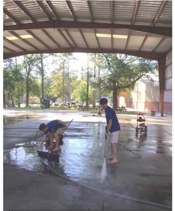
Student Council pressure washes Wolf Dome to prepare for graduation