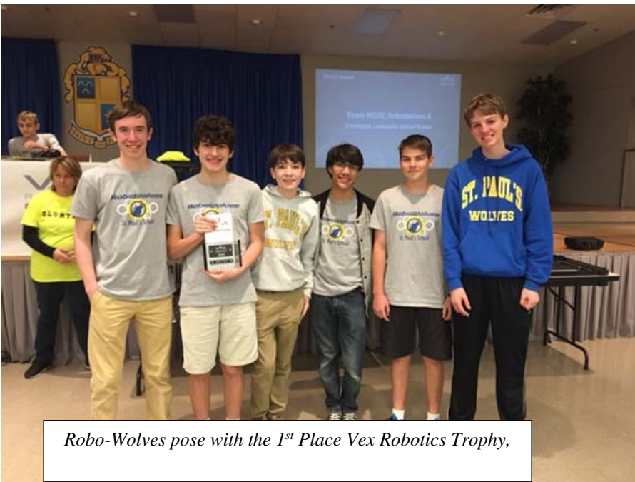
Robo-Wolves pose with the 1 st Place Vex Robotics Trophy,