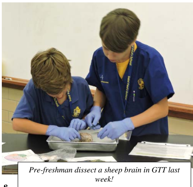
Pre-freshman dissect a sheep brain in GTT last week!

Please stress with your son the need to follow all rules in this last stretch of the school year. We had a couple of students make bad decisions recently. They are suffering consequences, as we will not overlook these poor decisions. We will teach until the end. Let's start the final stretch of our school year on a positive, problem-free note.