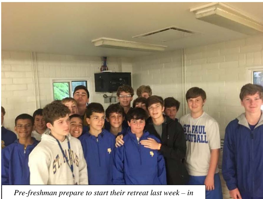
Pre-freshman prepare to start their retreat last week – in spite of the rain.