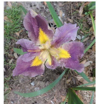
Iris are blooming all over campus.