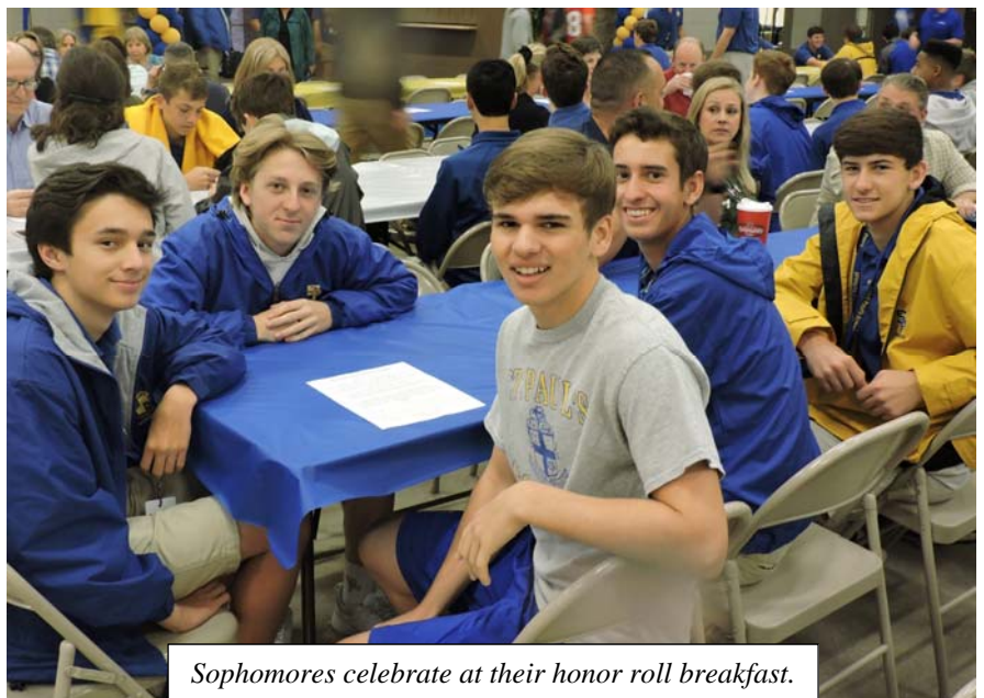
Sophomores celebrate at their honor roll breakfast.

"I cannot go to school today," Said little Peggy Ann McKay. "I have the measles and the mumps, A gash, a rash and purple bumps. My mouth is wet, my throat is dry, I'm going blind in my right eye. My tonsils are as big as rocks, I've counted sixteen chicken pox And there's one more--that's seventeen, And don't you think my face looks green? My leg is cut--my eyes are blue--It might be instamatic flu. I cough and sneeze and gasp and choke, I'm sure that my left leg is broke-- My hip hurts when I move my chin, My belly button's caving in, My back is wrenched, my ankle's sprained, My 'pendix pains each time it rains. My nose is cold, my toes are numb. I have a sliver in my thumb. My neck is stiff, my voice is weak, I hardly whisper when I speak. My tongue is filling up my mouth, I think my hair is falling out. My elbow's bent, my spine ain't straight, My temperature is one-o-eight. My brain is shrunk, I cannot hear, There is a hole inside my ear. I have a hangnail, and my heart is--what? What's that? What's that you say? You say today is. . .Saturday? G'bye, I'm going out to play!"