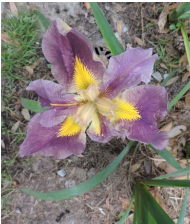
Easter beauty fills the campus. Thanks, Botanical Wolves!

How have we done with Brother Superior's challenge in the past year? Let us commit ourselves to doing even more this year, accepting the grace of Easter to help accomplish the goal of being "merciful ministers of God."