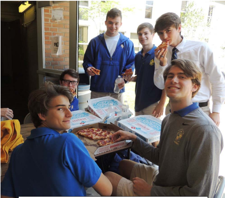
Seniors celebrate their ACT scores of 30 or better with pizza! Over 50 current SPS students are part of this elite group!