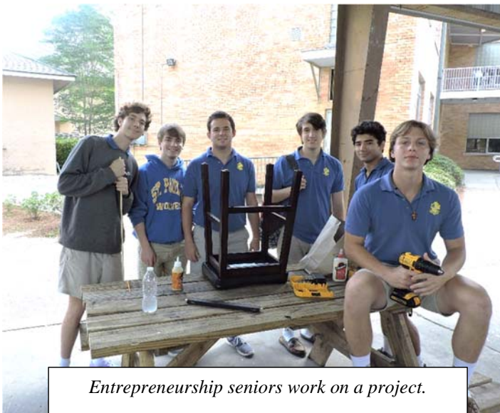
Entrepreneurship seniors work on a project.