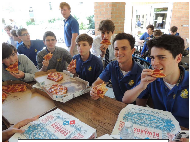
Juniors in the ACT 30+ Club enjoy their pizza lunch.