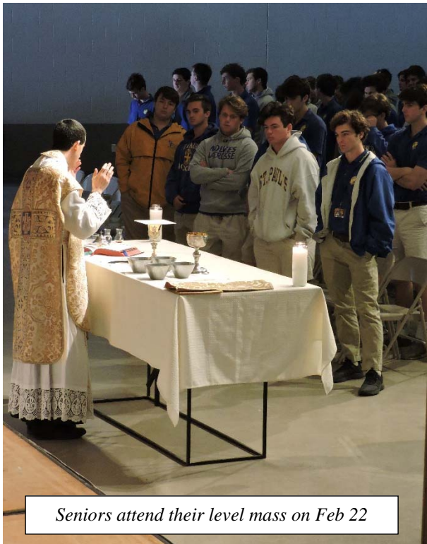
Seniors attend their level mass on Feb 22