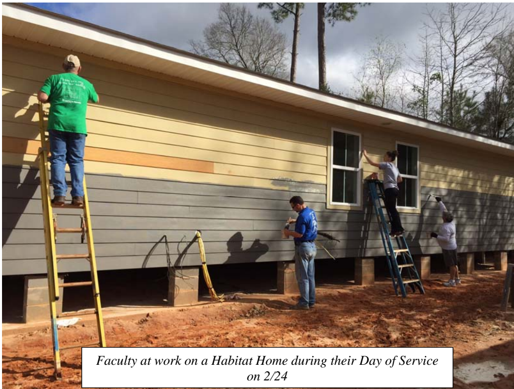
Faculty at work on a Habitat Home during their Day of Service on 2/24