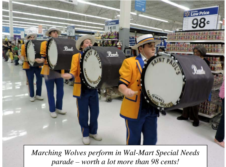
Marching Wolves perform in Wal-Mart Special Needs parade – worth a lot more than 98 cents!

Application Letter Excerpt: This letter from a next year applicant is extraordinary and needs to be read by all: