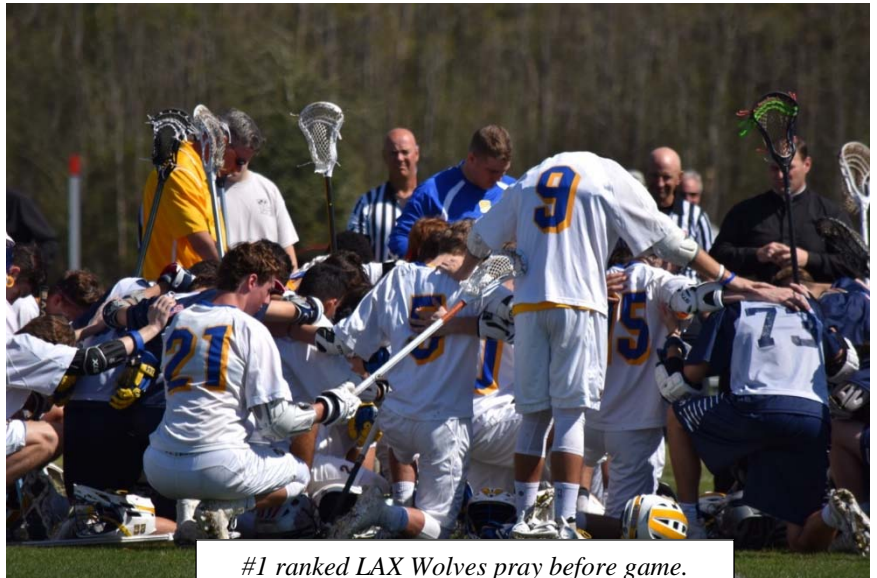
#1 ranked LAX Wolves pray before game.

National Catholic Sisters Week: Wed, March 8 begins NCSW to shine a national spotlight on the good works and good will of the almost 50,000 Catholic sisters in the US. It recognizes past and present sisters, from the movers and shakers of Catholic education, to those who pressed the front lines of social change to those who ministered to the sick in hospitals to those faithful praying in cloistered chapels. Few students today have had contact with Catholic nuns. Sad. Some of my most influential teachers in elementary school were nuns. Let's pray for an increase of vocations to this worthy life and thank God for the good these faith-filled women have done so much for so many, many years – and continue to do today.