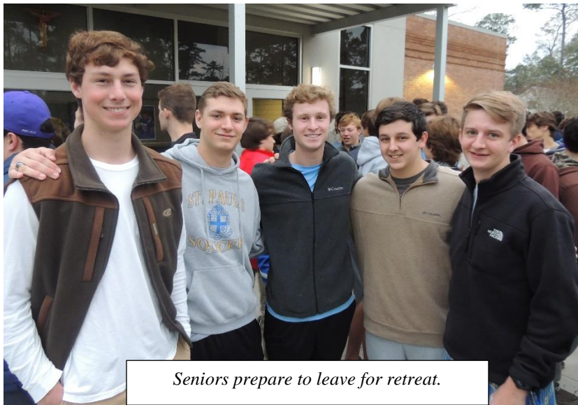
Seniors prepare to leave for retreat.