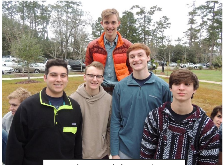
Seniors ready for retreat!

9 – CDEF 10 – GABC - Pack Time 11 – DEFG 12 – ABCD 13 – EFGA – CPR Training 17 – BCDE - President's Assembly 18 – FGAB 19 – CDEF 20 – GABC 23 – DEFG – 8 th -9 th HR Breakfast in BAC 24 – ABCD – 10 th -11 th HR Breakfast in BAC 25 – EFGA – Feast of St. Paul Mass 26 – BCDE – Career Day in AM for Juniors 27 – FGAB – 12 th HR Breakfast in Cafeteria 30 – CDEF 31 – GABC – President's Assembly