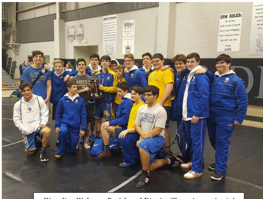
Wrestling Wolves – Parish and District Champions – Again!