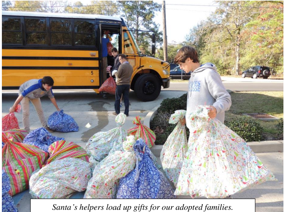
Santa's helpers load up gifts for our adopted families.

Sweatshirts & Cold Weather: ONLY SPS cold weather wear is accepted. If you cannot afford one, contact me and I will take care of it confidentially.