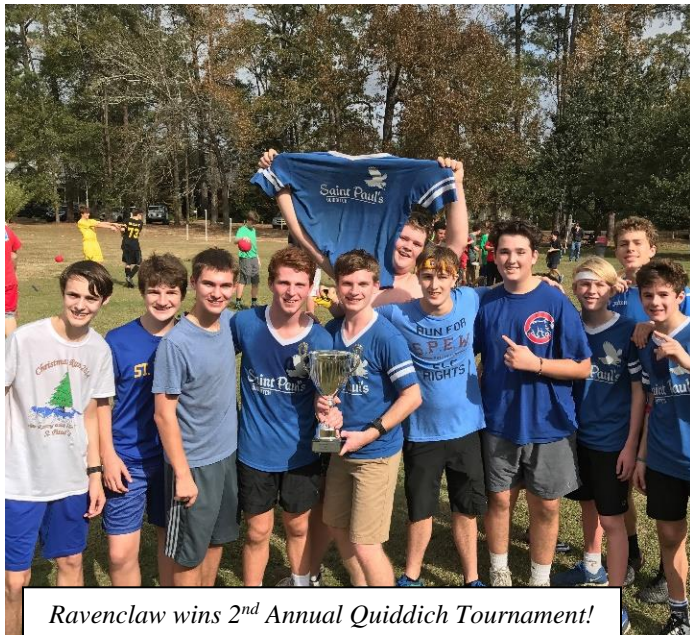
Ravenclaw wins 2 nd Annual Quiddich Tournament!

Enjoy the quiet from that angry partridge in the pear tree and those darn drummers drumming! Trivia Question of the Week: do you know the traditional names of the three kings? Answer at end of newsletter.