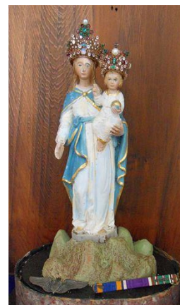
Original OLPS brought from France in 1727 by Ursuline nuns.