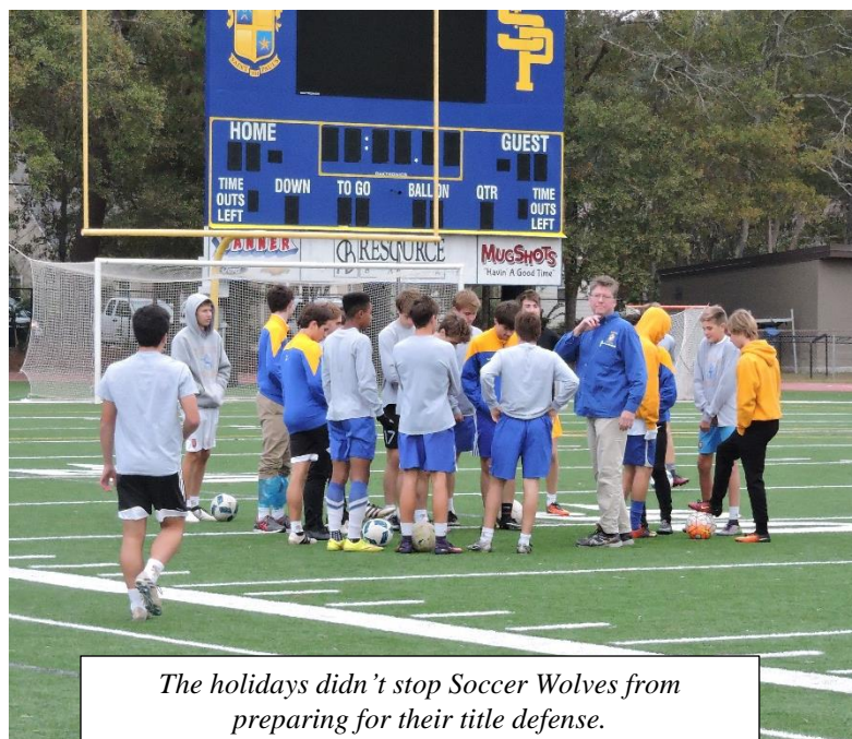
The holidays didn't stop Soccer Wolves from preparing for their title defense.

Welcome to January: Here are some of the causes celebrated in January: Apple and Apricots Month, Artichoke and Asparagus Month, Bath Safety Month, Be Kind to Food Servers Month, Birth Defects Month, California Dried Plum Digestive Month, Celebration of Life Month, Financial Wellness Month, Get A Balanced Life Month, Get Organized Month, International Creativity Month, National Clean Up Your Computer Month, National Glaucoma Awareness Month, National Hot Tea Month, National Mentoring Month, National Polka Music Month, National Poverty in America Awareness Month, National Soup Month, National Volunteer Blood Donor Month, Oatmeal Month, Rising Star Month, Shape Up US Month, Teen Driving Awareness Month, Tubers and Dried Fruit Month, Thyroid Awareness Month, & Worldwide Rising Star Month. Something for everyone!