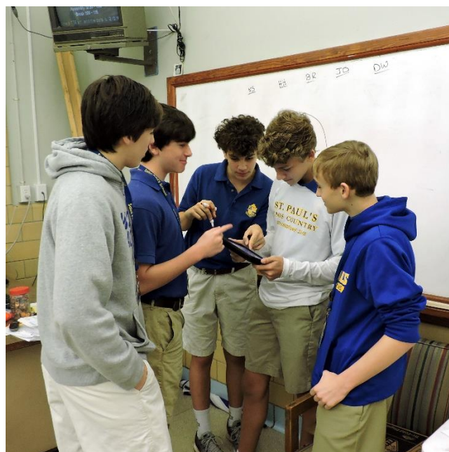
Sophomores review for their exam before holidays begin.