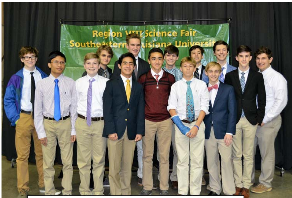
Fighting Science Wolves at Regional Fair at SLU.

11 – DEFG – Pack Time – Teacher Appreciation