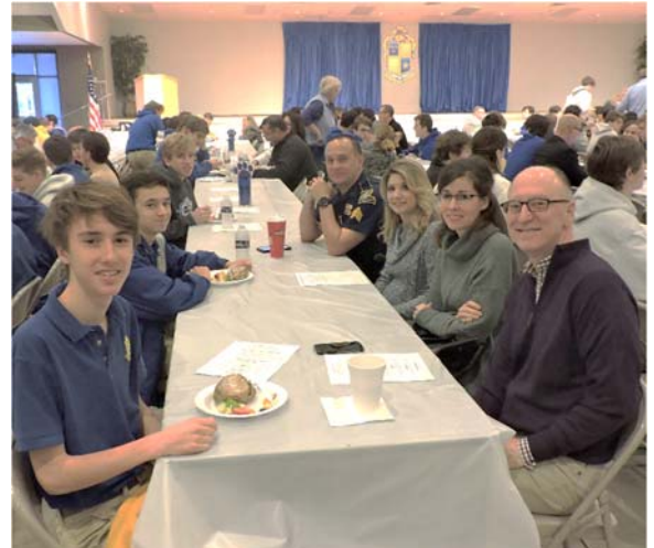
Sophs and their parents enjoy HR Breakfast.