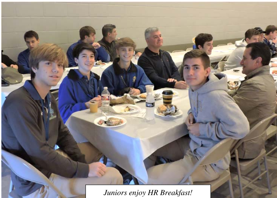
Juniors enjoy HR Breakfast!