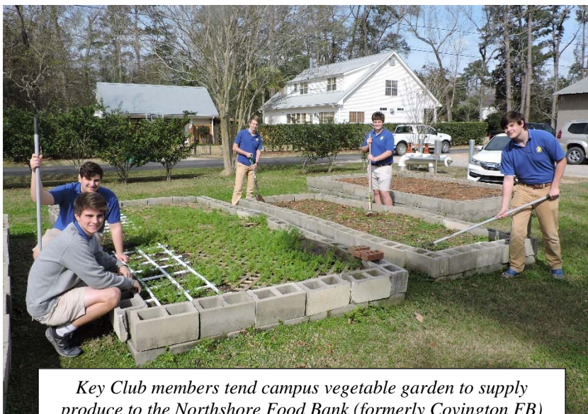
Key Club members tend campus vegetable garden to supply produce to the Northshore Food Bank (formerly Covington FB)

Archdiocese of New Orleans Family Life Apostolate’s FATHER-SON HUMAN SEXUALITY PROGRAM Archdiocese of New Orleans Family Life Apostolate presents a FATHER-SON HUMAN SEXUALITY PROGRAM for fathers and their 12-14-year-old sons on Sunday, March 19, 2017 from 5-8 PM in St. Mary’s Hall at St. Peter Catholic Church, Covington. Fathers and sons are invited to grow together in God’s gift of human fertility and the wonder of growing up and becoming a man. The program is based on the teachings of Pope Saint John Paul II’s “Theology of the Body”. Presenters include peers, health care professionals and fathers. Cost is $25. For more information, please contact St. Peter Office of Religious Education, 985.893.2446 or email ore@stpeterparish.com .