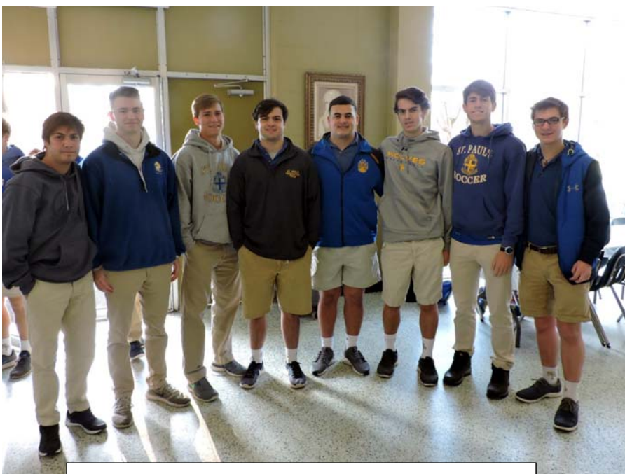
Seniors enjoy their penultimate honor roll breakfast.

A SERVE TEN Reminder: Five service hours are due. Students must fill-out and turn in completed "Serve Ten" forms to the Counseling Department in order to get credit for their service hours. We have been advertising MANY service opportunities. Remember that service hours are mandatory, not optional.