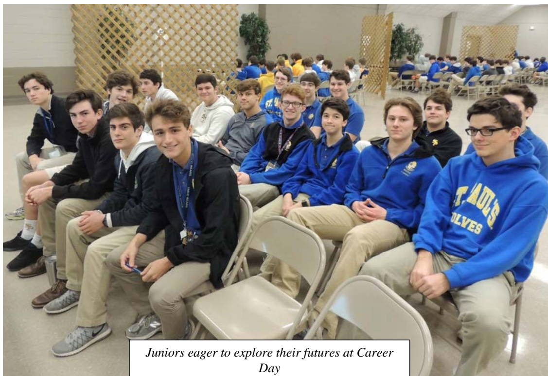
Juniors eager to explore their futures at Career Day

School Zone Cell Phone Ban: It is illegal to use a cell phone in a school zone while driving. I see some students and parents driving in the morning and using a cell phone. This sets a bad example – and is illegal. Please do not drive on campus during school zone hours while using a cell phone. _