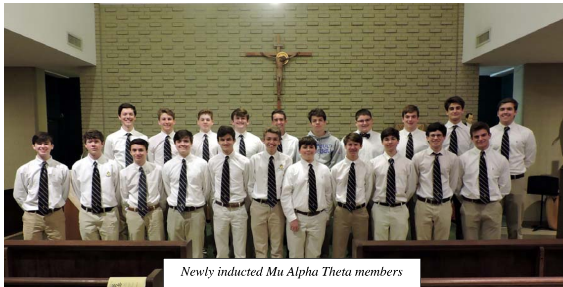
Newly inducted Mu Alpha Theta members