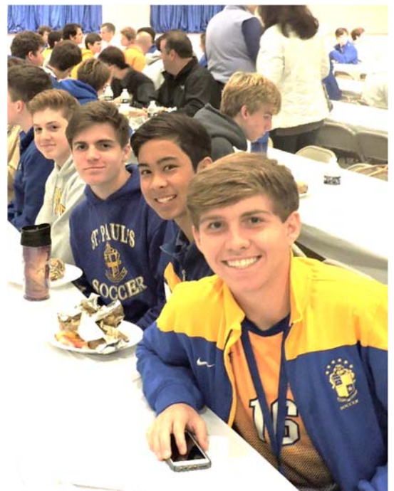
Sophomores await start of Honor Roll Breakfast – and the chance to expand their vocabulary!