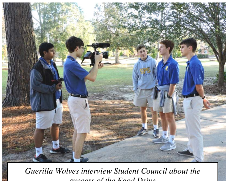
Guerilla Wolves interview Student Council about the success of the Food Drive

The Annual Fund: Last week, I officially launched our Annual Fund Drive – just like almost every other private school. You should have received in the mail a brochure explaining the drive and a response card. I'm humbled by the number of you who have anticipated the drive and have already sent in your donations. The success of this drive is critical to Saint Paul's. Please keep us in mind as you plan your end of year giving. Again, thanks to all who have already contributed. We need everyone, to at least some degree, to follow suit.