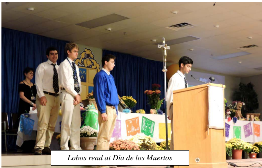
Lobos read at Dia de los Muertos

handbook – which you pledged to uphold at the beginning of the year when you signed. And we just can’t stop everything to deliver an assignment, a lunch, a message – we just don’t have the personnel. Thanks for understanding.