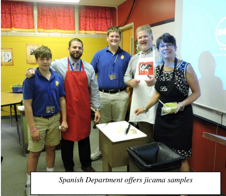
Spanish Department offers jicama samples

Lost and Found: The accumulation continues. Sweatshirts, pants, belts, uniform shirts, many, many lunch boxes, books, art supplies, pencil cases, folders, flash drives, you name, it's probably in our lost and found. Parents, please put your son's name on things and stress with your son the need to be responsible with his belongings.