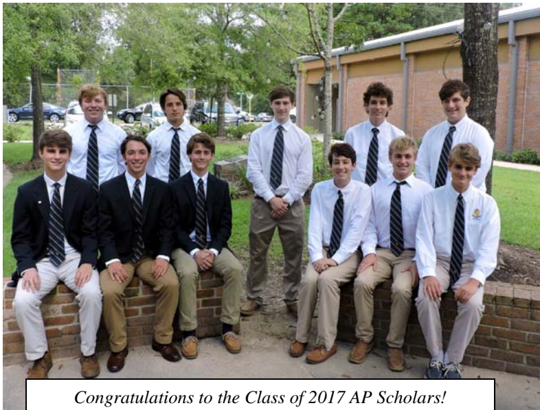
Congratulations to the Class of 2017 AP Scholars!