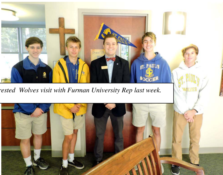
Interested Wolves visit with Furman University Rep last week.