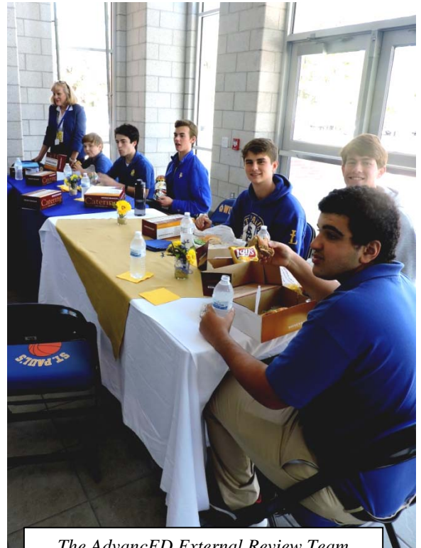
The AdvancED External Review Team interviews students at a working lunch.